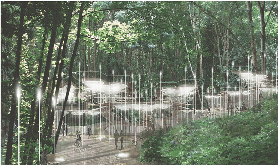
fig. 5.51. Sylvan Constellation at Amos Vale.