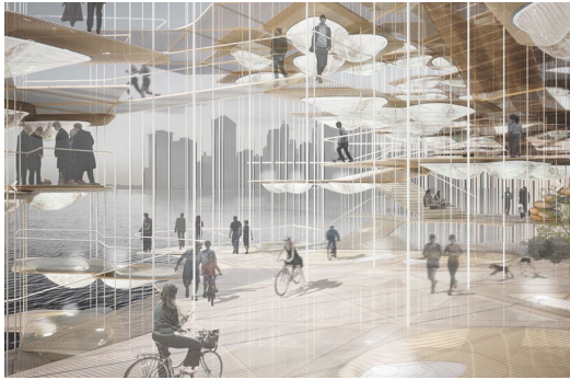
fig. 5.46. Perspective of the processional promenade in Constellation Park.