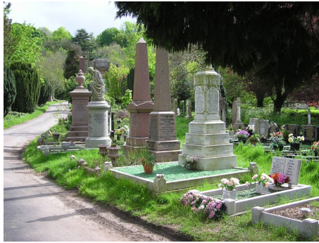
fig. 5.49. The forest at Amos Vale reclaiming graves.