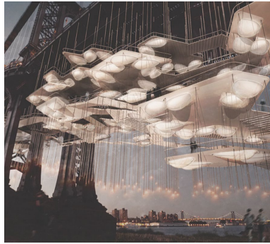
fig. 5.47. Constellation Park suspended below Manhattan Bridge.