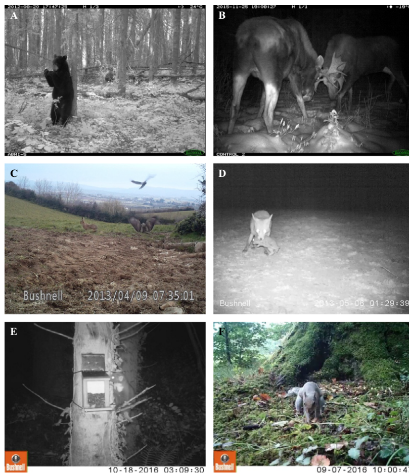
Figure 1. Examples of animal behaviour captured by camera traps: (A) Scent marking by an American black bear ( Ursus americanus ); (B) intraspecific competition in moose ( Alces alces ); (C) interspecific interactions between a European hare ( Lepus europaeus ; anti-predator response), a common buzzard ( Buteo buteo ; avoidance and attempted predation) and a hooded crow ( Corvus cornix ; anti-predator behaviour) captured on video (available at 10.6084/m9.figshare.4508369); (D) predation of a European rabbit ( Oryctolagus cuniculus ) by a red fox ( Vulpes vulpes ); (E) investigation of a squirrel feeding station by a pine marten ( Martes martes ); (F) nut caching by a grey squirrel ( Sciurus carolinensis ).

now being duplicated in other parts of the world. Picman and Schriml (1994) observed the predators of quail ( Coturnix coturnix ) nests in a variety of habitats, elucidating temporal variation and relative importance of each predatory species. The application of this method to the study of threatened avifauna has clear conservation benefits via the identification of direct impacts on egg success and the development of appropriate mitigation and monitoring techniques. Similarly, cameras provide more accurate post-hibernation den-emergence estimates for American black bears ( Ursus americanus ) than conventional methods, that is, den visits and radio telemetry (Bridges et al. 2004). Long-term monitoring of emergence relative to climate may yield important insights into the effects of climate change on black bears and other hibernating species (sensu Bridges and Noss 2011).