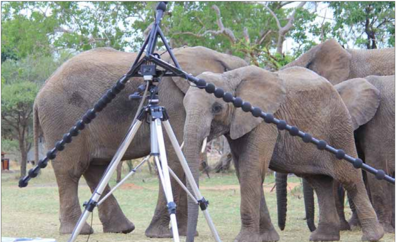
Experimental setup at Adventures with Elephants.

African elephants are well known for their very low-frequency (infrasonic) sounds, with pitches below the range of human hearing. These low frequency sounds, termed “rumbles”, are the most frequently used vocalisations. Female African elephants use these rumbling vocalisations mainly for group cohesion and coordination.