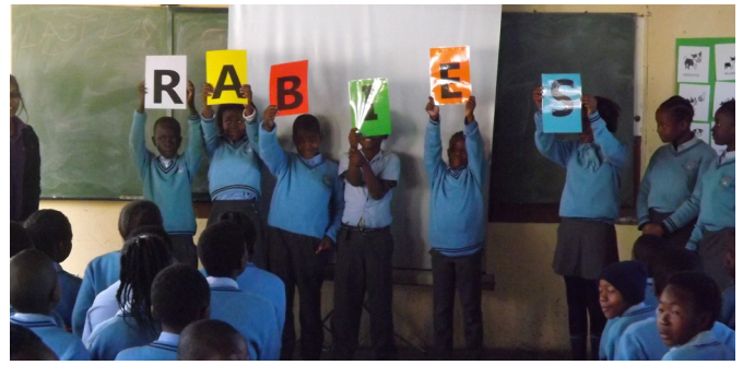
Kosea Moeka Primary School learners learn about rabies

Our hope is for a working relationship to develop with Kosea Moeka Primary School to further improve not only the school, but also educate the community and their children on animals and preventable disease.