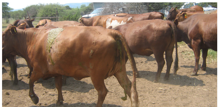
The animals received Lumpy Skin and Supravax vaccinations