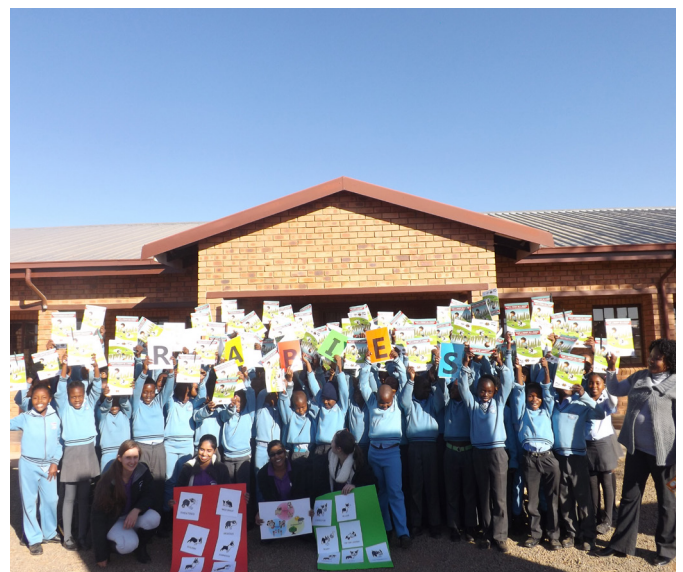
Veterinary Science students getting to know the Grade six learners of Kosea Moeka Primary School

The experience of going out into a community was both exhilarating, and rewarding. Talking to teachers and interacting with the learners gave us a better understanding of the community and its needs. Before having implemented this, the project merely seemed like an unwanted task, but it turned