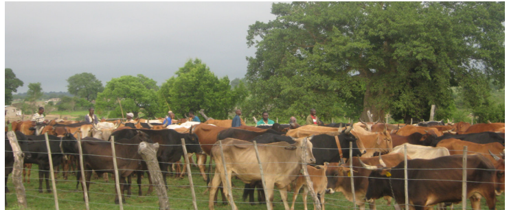
Veterinary Science students, along with community members

The farmers received free Lumpy Skin and Supravax vaccinations for their animals, with the team also treating any other issues evident to them upon closer inspection of the animals. It was incredible to see the selflessness and fellowship between the farmers as they all assisted one another in the proceedings of the day; all working together towards one common goal.