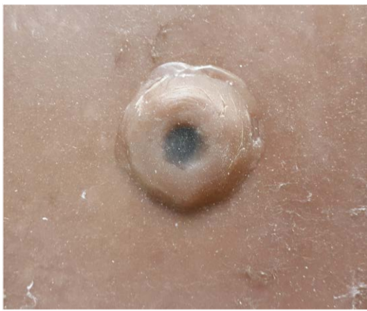
Swelling with central necrosis