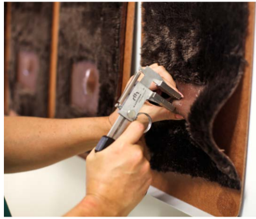
Reading of skin fold thickness by means of calipers in the live animal and the skin model