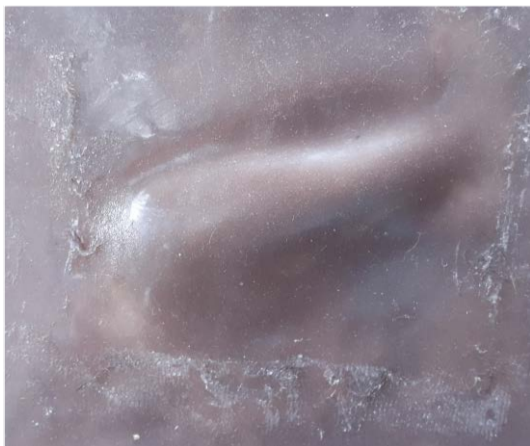
Oedema with diffuse swelling and adhesion