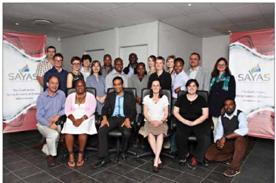
SAYAS members at the General Assembly held at ASSAf's offices in Pretoria.

In its founding year last year, 20 top young scientists were inaugurated into SAYAS, and each year 10 new members will be elected until a total of 50 members is reached. Following five years of service, which involves actively working towards achieving the goals of the Academy, members will become alumni and will be replaced by new members. To become a member of SAYAS, a candidate should be in possession of a PhD (in the natural sciences, social sciences and humanities, medical sciences or engineering), below the age of 40, and should display evidence of scientific excellence in terms of an exceptional publication record and receipt of honours and awards among other criteria. A rigorous selection procedure follows the annual call for nominations from institutions around the country. More information on the Academy can be found at www.assaf.co.za/sayas-south-african-young-academy-of-sciences/ .