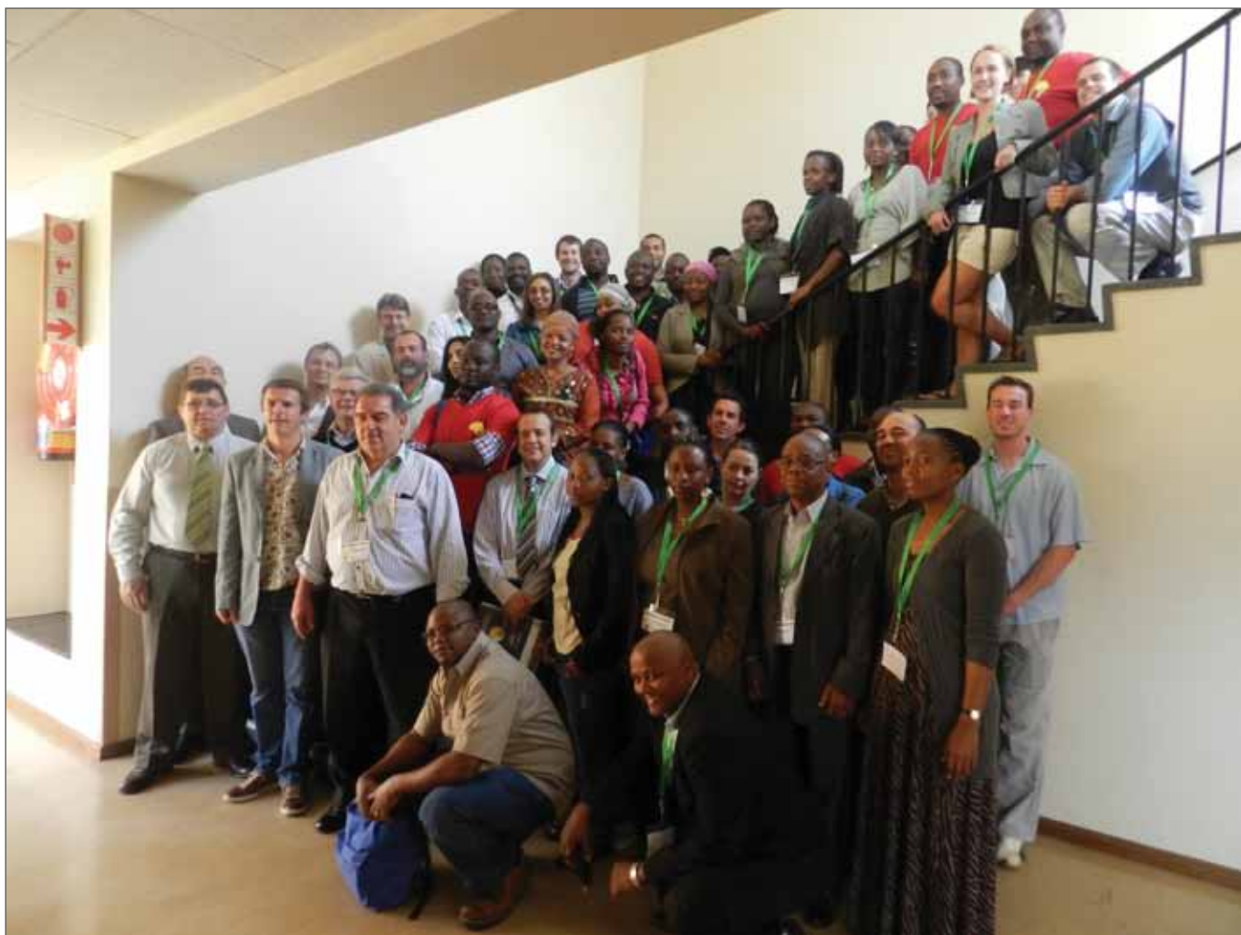
Delegates at the second Southern African Postgraduate Student Symposium.

In 2009, the Department of Veterinary Tropical Diseases (DVTD) of the Faculty of Veterinary Science at the University of Pretoria hosted the first Southern African Postgraduate Student Symposium with specific focus on veterinary tropical diseases. As a result of the success of this symposium, the organisers decided to present a second student symposium, which was hosted in collaboration with the Institute of Tropical Medicine, Antwerp, Belgium from 16 to 18 September 2012.