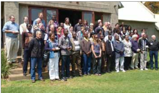
The congress delegates on the steps of the Wild Geese Lodge.

at Zimbabwe Veterinary Congress from 5 to 8 September 2012