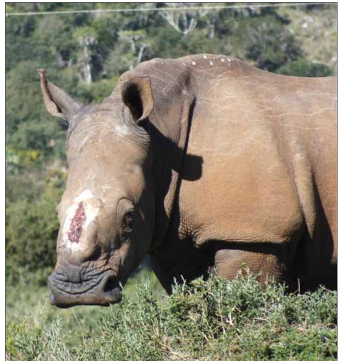
Thandiswa on the road to recovery.

The rhino poaching trend is extremely worrying and affects each individual in our country. If it is not stopped, the world could lose African rhinos and that is a tragedy we do not want to contemplate.