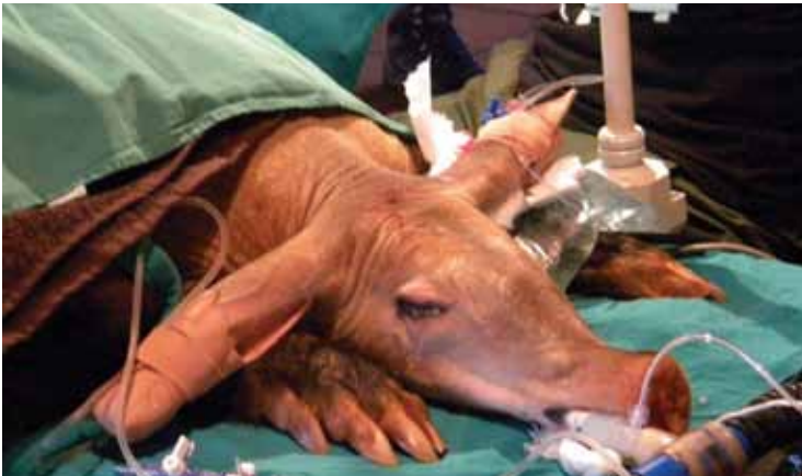
An anaesthetised aardvark undergoing the surgical implantation of data loggers and a tracking device.