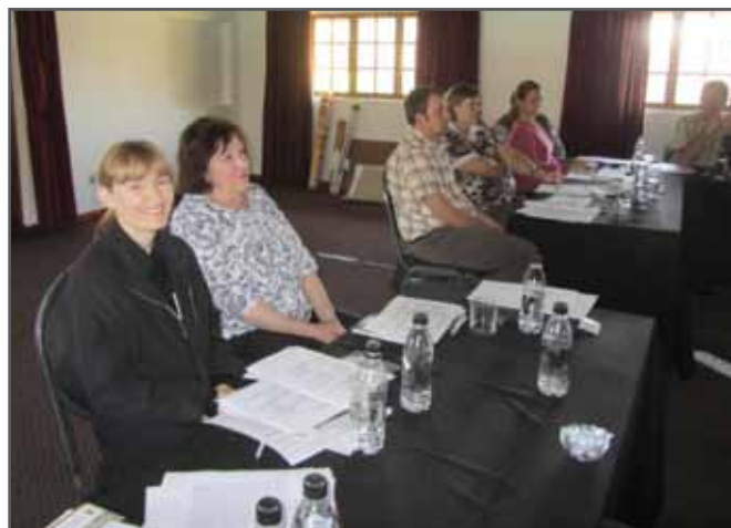
Delegates at a meeting to discuss the Veterinary Public Health curriculum.