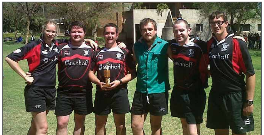
The Black Label Students team received the OP Touchies Floating Trophy after they defeated the CACS Kings in the final.

The tournament kicked off on 12 August, and the semi-final and final matches were played on