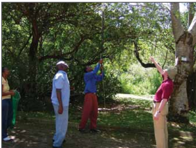
Three PhD students and Prof Franz from Austria, collecting tree leaves.