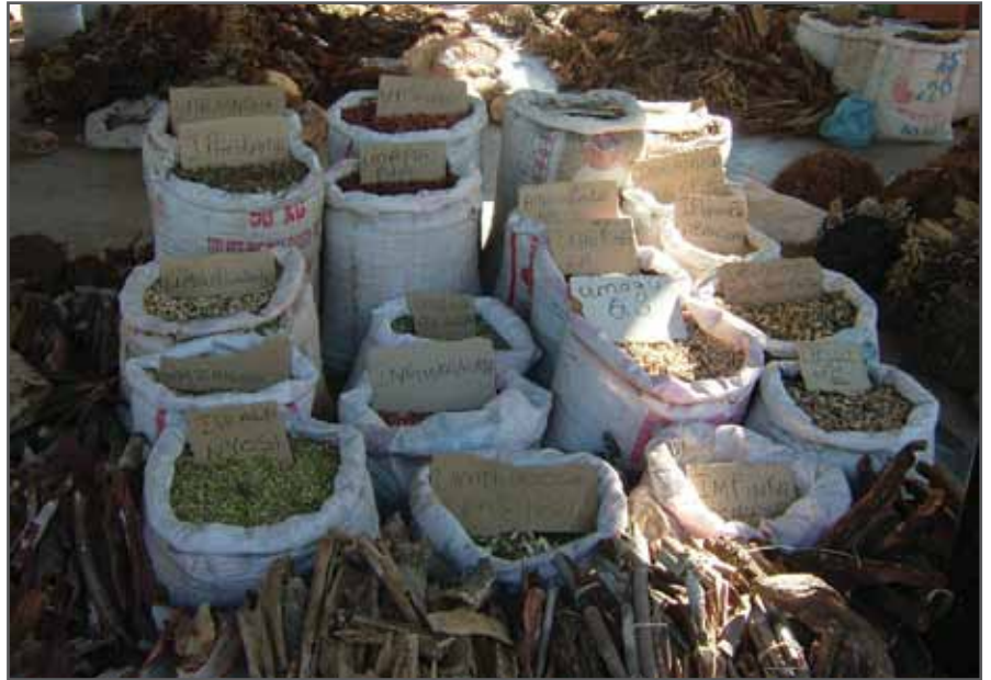
The Phytomedicine Programme investigates therapeutically useful compounds present in plants growing in South Africa.

In an effort to promote the sharing of knowledge and future research collaborations in the field of the biological activity investigations of indigenous plants, the Phytomedicine Programme in the Department of Paraclinical Sciences hosted a seminar day in May 2011 for research group leaders from various institutions based in Gauteng and surrounding areas.