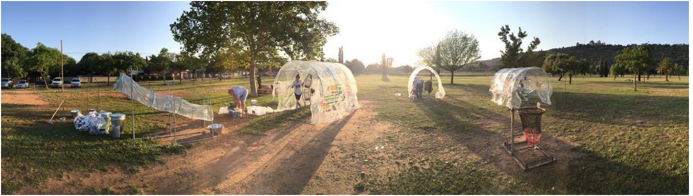
Figure 15: Josly van Wyk, Nomadic Objects , 2016. Art installation and household waste. Rietondale Park, Pretoria, RSA.