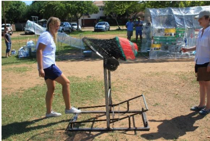
Figure 23: Josly van Wyk, Dancing Dustbin , 2016. Household waste, metal, wire coil and cogs. 120 x 76 x 110 cm. Rietondale Park, Pretoria, RSA..

The top of the bag is made of ordinary black refuse bags. As the bag flips, bright contrasting colours of red and green become visible.