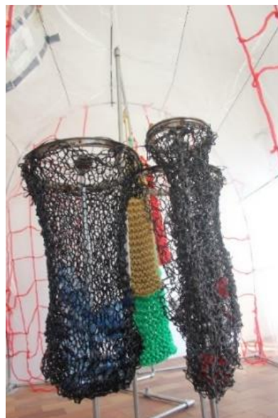
Figure 14: Josly van Wyk, Shift to Process , 2015. Household waste, galvanised pipes and bicycle rims. 180 x 180 x 216 cm. Art studio, Pretoria, RSA.

During my experimentation to integrate metal structures and knitting of plastic shopping bags, I tied plastic weaves to the discarded wheels, for example, in Shift to Process (2015) (Figure 14). I experimented with knitting discarded plastic as a means of using the vast amount of plastic shopping bags that community members had collected. The craft of knitting is a skill that I obtained through familial learning and it furthers the domestic influence that my work conveys. In South Africa, a common practice among craft artists is to knit or crochet with plastic shopping bags to create utilitarian objects such as rugs, hats and bags (Coetsee 2015:15). Drawing from local cultural practices, I use knitting as a means of incorporating household waste, and to further enhance the cultivation aspect of my work, I also used synthetic agricultural twine made from recycled plastic bags. I connected the subsequent plastic weaves to the wheels that were now connected to a fixed point to structurally empower the plastic weaves to contain waste objects. The moment the wheel rotated in the nomadic presence of the plastic weaves, I realised that the focus of my art practice should rather be on the cycle of household waste and that I should stray from transforming waste materials into a recreated object.