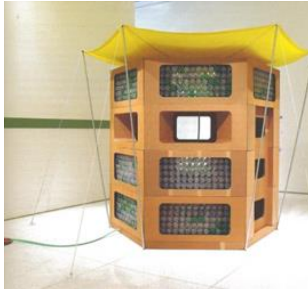
Figure 7: Learning Group, Collected Material Dwelling , 2005. Mixed media installation. Dimensions variable. Chicago, USA. (Smith 2005:63).

The representational installation work of Collected Material Dwelling does not reflect the same aesthetic experience as the original, owing to the lack of a do-it-yourself appearance instilled in Collecting System . Furthermore, Collected Material Dwelling reads as a model that is designed and fit for a white cube gallery. This becomes problematic, as one of the members of Learning Group, Julio Castro, states that Collecting System was brought to life when the social context and process became the focus, whereas the Collected Material Dwelling is void of the two aspects that awaken such an installation (Smith 2005:65). Although the significance of such a project rests on the engagement with the community, the ethical responsibility of the artists also obliges them to feed the social incentive back into the art world.