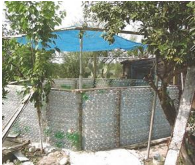
Figure 4: Learning Group, Collecting System , 2005. Plastic bottles, wood and wire. Dimensions variable. Monterrey, Mexico. (Smith 2005:69).

together configuration of waste materials, which is central to the do-it-yourself movement (Kelly 2008:25). As Nicole Dawkins (2011:263, 274) states, the interdisciplinary movement of do-it-yourself is based on a post-feminist mindset that uses craft techniques such as knitting, sewing and needlework to create contemporary craftwork. As examples of stitching in contemporary art practice, Nash sews plastic bags together with thread, Anatsui stitches liquor-bottle caps with copper wire and the art collective of Learning Group uses steel wire to adjoin plastic bottles. The abovementioned materials are not conventional art media, however, contemporary artists utilise this low-tech, handmade technique to instil a subjectivity in artworks that are made from mass-produced objects (Manco 2012:6). Therefore, do-it-yourself allows artists to mould cultural traces according to their own subjectivity (Vergine 2007:13).