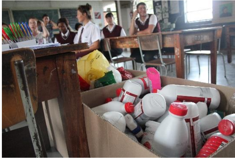
Figure 24: Household waste at the workshops, 2016. Documentation of art workshops. Hoërskool Hendrik Verwoerd, Pretoria, RSA.

Later on, when I presented art workshops (Figure 24) at the local school Hoërskool Hendrik Verwoerd, I could supply boxes of categorised waste as art materials. When I first started collecting waste, I asked my neighbours to keep a specific type of bag or bottle separate from their weekly waste collection. I anticipated that I would have to distribute pamphlets to ask for assistance from the community, however, it was never necessary. There was always a surplus available from the households who assisted me; this made the collection process efficient. The community provided enough waste for my own art practice, for the workshops and for use at the Nomadic Objects exhibition. When contemporary artists work alongside community members to address social concerns, the boundaries of convention and understanding are breached, allowing the effects of such practices to surface on a social level (Sommer 2014:50). Therefore, community members who assisted with the collection of waste materials allowed me to understand the community that informed and enriched my art practice.