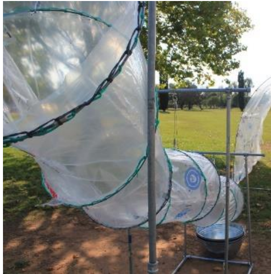
Figure 17: Josly van Wyk, Spiral Supply , 2016. Household waste, galvanised pipes, wire coil, metal cable and pulleys. 200 x 200 x 60 cm. Rietondale Park, Pretoria, RSA.

patterns of consumption of households in Rietondale. This chute is also suggestive of the tunnel vision consumers demonstrate when adhering to the demands of consumer culture. These discarded remnants of Rietondale are ironically re-presented in the exhibition, Nomadic Objects , where viewers are enticed to scavenge and interact with their own waste.