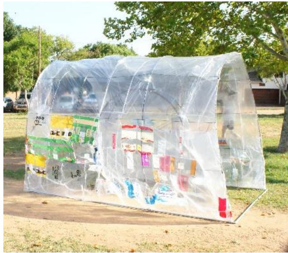
Figure 16: Josly van Wyk, Greenhouses , 2016. Household waste, galvanised pipes and fibre-glass tent poles. 200 x 200 x 300 cm. Rietondale Park, Pretoria, RSA. (Photograph by author).

The transparency of Greenhouses suggests cultural practices that are exposed. This relates to Julia Kelly's (2008:30) understanding that viewers unravel a confluence of ideas when artists use culturally loaded items of the everyday. I used everyday shopping and bread bags gathered by the local community as a tool that allows viewers to identify with Greenhouses . The manner in which I applied the flexible material that encapsulates the structural elements of Greenhouses draws attention to domestic activities, as it had been sewn, and displays colourful patterning of South African product brands. Patricio del Real (2008:85) speaks of the confrontational work of Potrč as a resourceful method to use situations, materials and individuals that exist in the world, rather than recreate an idealised perception for viewers. I therefore used recognisable waste materials to entice viewers. However, they needed to actively engage with the work in order to decode the meaning I presented to them. Viewers' active engagement of the socio-political context of an installation artwork could potentially cause fading boundaries between art and everyday life (Bishop 2005:11). I therefore explored household waste within the context of art practice but, when engaging with the community, I encountered moments where the boundaries between art and life blurred.