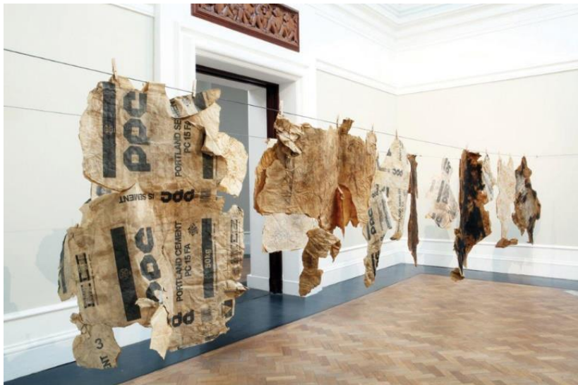
Figure 9: Moshekwa Langa, Untitled , 1995. Art installation from discarded cement bags. South African National Gallery, South Africa. (O’Toole 2016:[sp]).

Lauwrens (2012:3) explains that the conventional manner of perceiving art from a distance in art history becomes problematic to the aesthetic experience as the artwork and viewer are disconnected. In this regard, I refer to the notion of Immanuel Kant (cited in Cazeaux 2011:3) that the human experience and their surrounding environment are integral to one another. This informed Merleau-Ponty’s (1962:61) version of phenomenological experiences that should be based on thought, interrelationships and affinity. Therefore, an aesthetic experience does not pertain to an isolated perception but, as Francis Halsall (in Lauwrens 2012:6) states, to an “inter-connected” sensorial field. As an example of an interrelated mode of experience, I refer to the work of Moshekwa Langa, Untitled (1995) (Figure 9) (O’Toole 2016:[sp]).