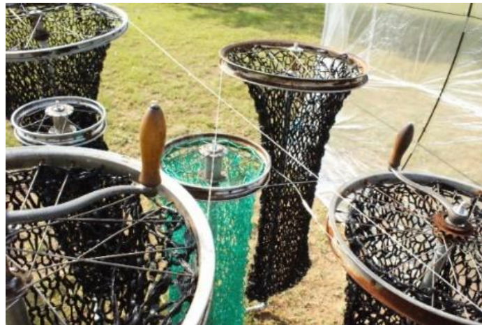
Figure 21: Josly van Wyk, Wasted Web , 2016. Household waste, galvanised pipes, bicycle rims, food processing handles and weaved netting. 200 x 100 x 120 cm. Rietondale Park, Pretoria, RSA.

motion of the wheels. Weaved plastic bags are attached to the bicycle wheels. The plastic weaves are a functional part of the sculptural structure and resemble a spider's web. The title of this work is concerned with how the accumulation of waste pollutes the surrounding environment and ultimately wastes the natural and urban environments. The empty bags capture the dismantled and deconstructed waste objects as the participants categorised them according to the size of the filter compartments. I wish to draw attention to a full Wasted Web (2016) (Figure 22) that was systematically jam-packed by participants, who had sorted and filtered household waste through the Nomadic Objects cycle of sculptures.