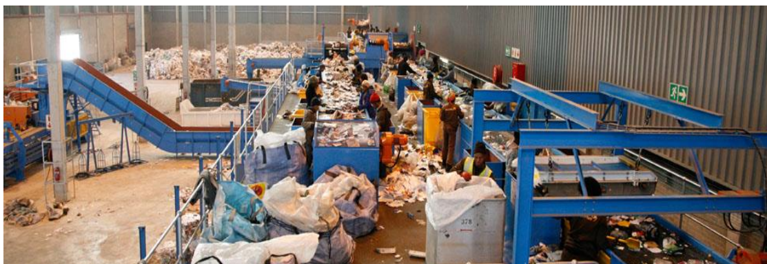
Figure 12: WastePlan Waltloo recycling factory, 2015. Workers sorting recyclables with residential recycling collections. Pretoria, RSA. (WastePlan 2015:[sp])

As a result of the disposable use of consumer products and the constant change in use value, the suggestion of Peterman that a nomadic quality is inherent to waste is central to how I interpret household waste. The WastePlan Waltloo recycling factory (2015) (Figure 12) located in close proximity to Rietondale is an example of how workers interact with the household waste of consumer society. The process of sorting, assisted by conveyer belts and chutes, demonstrates how humans steer the voyage of household waste. As workers handle the waste generated by consumer society, this remedied process of engagement points toward the time and effort invested into waste, a cultivation of sorts. During my initial attempt to explore waste materials, I considered the act of incorporating waste into art to instil the sense of cultivation into the subsequent artwork. However, the process of working with waste became more significant than creating an artwork to elevate the status of waste. Therefore, the interaction between humans and waste materials became central to this study.