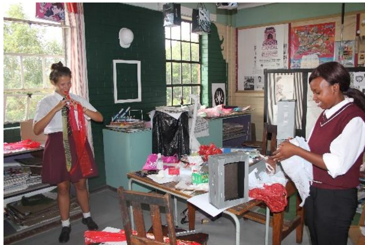
Figure 26: Learners during art practice, 2016. Documentation of art workshops. Die Hoërskool Hendrik Verwoerd, Pretoria, RSA.

learners identified current predicaments in society. The questionnaires reflected that most of the learners considered waste objects as viable art materials. Some learners attributed personal value to their artworks, which came as a result of the time and effort that they had invested in creating it. Others expressed that creativity leads to new ideas, which correlates with my own practice-led methodology of how explorative art practice allows the artist to gain a new perspective. Something that I noticed when revising the questionnaires is that the learners interpreted art practice as a personal activity that one would use to express oneself freely without the fear of judgement or potential grades. According to McWilliam (2008:33), learners need to reflect on experiences to consider the meaning and impact of what happened. Following this train of thought, I consider the art practice of the learners to be for self-expression and personal enrichment.