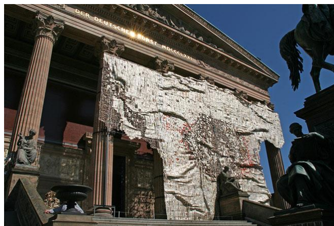
Figure 2: El Anatsui, Ozone Layer , 2010. Liquor-bottle caps and copper wire. Dimensions variable. Berlin, Germany. (Okeke-Agulu 2010:52).

In this section, I investigate the development of the cultural practice of bricolage and how artists have chosen to adopt certain customs of this practice as a means of collecting waste materials. During the early twentieth century, the role of the bricoleur in Parisian society was to reclaim any reusable objects to sell to junk dealers or to repurpose these objects for new use (Whiteley 2011:16). When Anna Dezeuze (2008:31) explains the cultural practice of bricolage as a mode of engaging with everyday life, she refers to the anthropologist Claude Lévi-Strauss (cited in Dezeuze 2008) who explains a bricoleur as a gatherer of “residues”. Bricoleurs were known as bric-a-brac 8 men who collected as a means of survival. During the 1960s, the idiom of artist as bricoleur was established by artists who collected waste materials to use as an art medium (Whiteley 2011:9). Contemporary artists who use waste in their art practice extract meaning by balancing ideas and the physical appearance to represent waste as a “footprint of life” (Vergine 2007:13). Therefore, artists who use bricoleur culture as an influential source to how they approach their art practice attempt to capture a version of everyday life that could reinforce the meaning of the collected objects or repurpose the function.