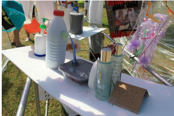
Figure 27: Artwork from workshop, 2016. Household waste. 60 x 25 x 25 cm. Rietondale Park, Pretoria, RSA. (Photograph by author).

The work of one particular learner influenced the way that I consider processes and how a series of actions account for one aim. The inspiration of this particular artwork (Figure 27) was based on a documentary television show that the learner watched on the Discovery channel. He used the process of art practice to consider how one would go about to genetically manipulate chickens. He was unsure of whether such a process intrigued or disgusted him. The learner created an imaginative circuit which could inject a chicken, cultivate new genes, heat chemicals, clean the product and display it as beautified and ready for consumption in a grocery store. I appreciated how this learner identified an issue and investigated it by physically creating different stages of the process. He added details such as flames to show heat and splash rings from the chemicals. My interpretation of this process of inquiry that the learner followed informed my perception of processes and led me to create Dancing Dustbin that is a process-oriented sculpture.