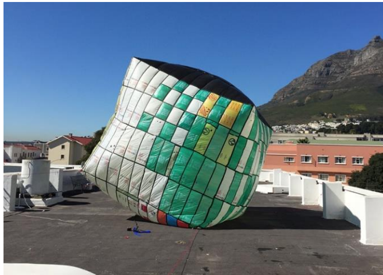
Figure 3: Heath Nash, Flying Museum , 2016. Used plastic bags. Dimensions variable. Cape Town, RSA. ( That Art Fair 2016:[sp]).

In this section, I will focus on the material and conceptual significance of waste objects. The process of assemblage will be investigated as a do-it-yourself art method to consider the potential aesthetics of household waste. The sculptural process of assemblage combines various found objects, which may include waste materials, to form a three-dimensional artwork (Whiteley 2011:33). Assemblage is also associated with other artistic techniques such as collage and montage, which involve the composition and juxtaposition of fragments of objects, materials or images (Whiteley 2011:33). Therefore, assemblage as a method is the assembling or combining of different parts of found objects. Following the conceptual process that bricolage entails, when assemblage merges physical waste objects, the meaning and function that waste objects retain are central to this investigation.