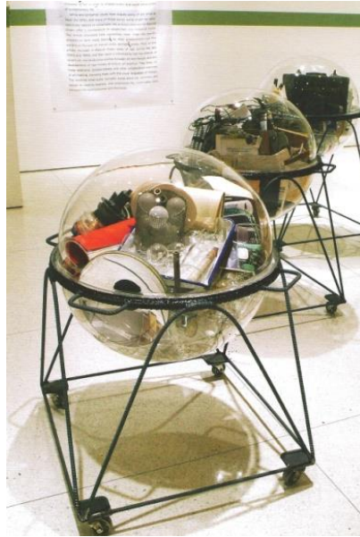
Figure 6: Dan Peterman, Excerpts from a Universal Lab , 2005. Mixed media. Dimensions variable. Chicago, USA. (Smith 2005:103).

metaphorically represents this nomadic quality by using mobile containers to encapsulate waste materials in Excerpts from a Universal Lab (2005) (Figure 6) (Smith 2005:102).