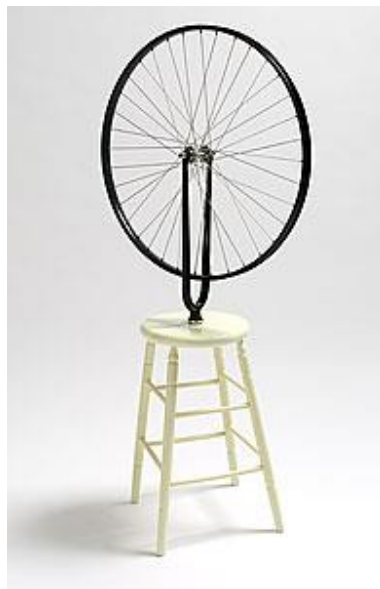
Figure 1: Marcel Duchamp, Bicycle Wheel , 1913 (replica 1964). Mixed media. Dimensions variable. Milan, Italy. (Celant and Maraniello 2007:127).

that Duchamp extracted from everyday life assisted his process of posing subversive questions to the viewer (Schneckenburger 2005:457). Duchamp's experimentation with the aesthetic consideration of found objects from everyday activities became a celebration of the mundane (Goldsmith 1983:197). This celebratory aspect of the everyday in the work of Duchamp highlights the collision of art and life (Goldsmith 1983:198). An example of an everyday object that is removed from its functional environment and inserted into a reflective field (Goldsmith 1983:198) is Bicycle Wheel (1913) (Figure 1). This shift away from utilitarian function toward conceptual use is pertinent in Bicycle Wheel , where the work suggests a sense of purposelessness after the removal of its original use value. Both the wheel and stool become physically superfluous by the manner in which Duchamp configured Bicycle Wheel . However, I regard this construction of Bicycle Wheel to eliminate the intended purpose of two functional objects as an artistic decision that instils a sense of futility. Duchamp creates this futile quality by disposing of the function of these objects that acquire conceptual meaning.