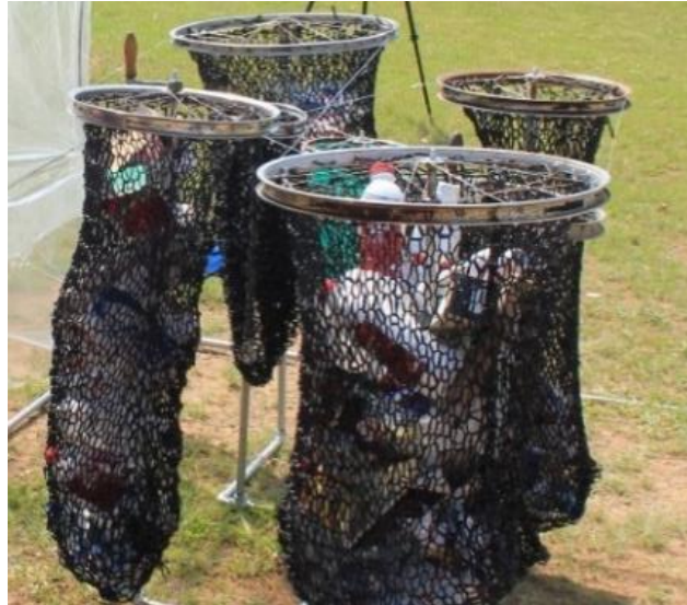
Figure 22: Josly van Wyk, Full Wasted Web , 2016. Household waste, galvanised pipes, bicycle rims, food processing handles and weaved netting. 200 x 100 x 120 cm. Rietondale Park, Pretoria, RSA.

bags as part of the process to replace the filled-up bags. This could even have formed part of the collaborative aspects of this study, especially the art workshops I presented. Wasted Web signals the end destination for the household waste in the Nomadic Objects cycle, thereafter viewers may move on to Dancing Dustbin .