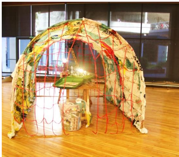
Figure 13: Josly van Wyk, Exploring Household Waste , 2013. Dustbins, household waste and fibre-glass tent poles. 200 x 300 x 200 cm. Rautenbach Hall, University of Pretoria, Pretoria, RSA. (Photograph by author).

water pipes with open slots for the tent poles to slot into in order to stabilise the skeleton framework. By using galvanised water pipes, I remind the viewer of the concealment of functional elements within the domestic sphere. By exposing elements such as pipes and dustbins that are usually hidden within the home owing to their aesthetically displeasing appearance, I draw attention to hidden processes such as the disposal of affluence. These hidden processes act as barriers that distance humans from clandestine happenings within the home. Another process that humans are removed from is the disposal of waste. Even though we consider waste as thrown away, a landfill or recycling plant does not abolish waste objects. Disposing of waste simply adds fuel to the environmental threat (Seegert 2014:7). I wish to confront viewers with this endless cycle of waste.