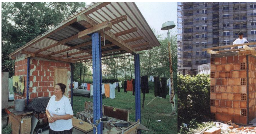
Figure 8: Marjetica Potrč, House for Travellers , 2002. Building materials. Dimensions variable. Ljubljana, Slovenia. (Del Real 2008:97).

As Jackson (2011:9) states, to empower marginal communities, members of such a community need to learn self-reliance, local involvement and civic responsibility. Potrč explores creative methods that address marginal urban developments and attempt to extend infrastructural grids (Del Real 2008:97). Potrč builds urban and architectural structures that resemble an innovative informal urbanism to challenge rampant housing predicaments that act as social confrontation (Gonzalez 2004:57). The play on private and public spaces becomes apparent in the work of Potrč when she creates semi-functional structures to install in gallery spaces. The contrast between temporary gallery installations and a site-specific work such as House for Travellers brings the validity of a two-year project in a public space to light (Phelan 2000:41). House for Travellers is a fully functional structure in the unregulated area of Ljubljana in Slovenia, where Kosovar refugees take up informal residence (Phelan 2000:41). In line with the opportunistic notion of bricolage, Potrč interprets unplanned areas as an opportunity to develop creative solutions and implement them under the radar of political restrictions.