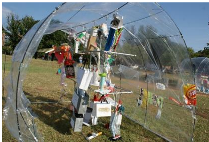
Figure 28: Artworks from workshops at Nomadic Objects exhibition, 2016. Household waste, galvanised pipes and fibre-glass tent poles. 300 x 200 x 200 cm. Rietondale Park, Pretoria, RSA.

The work of one particular learner influenced the way that I consider processes and how a series of actions account for one aim. The inspiration of this particular artwork (Figure 27) was based on a documentary television show that the learner watched on the Discovery channel. He used the process of art practice to consider how one would go about to genetically manipulate chickens. He was unsure of whether such a process intrigued or disgusted him. The learner created an imaginative circuit which could inject a chicken, cultivate new genes, heat chemicals, clean the product and display it as beautified and ready for consumption in a grocery store. I appreciated how this learner identified an issue and investigated it by physically creating different stages of the process. He added details such as flames to show heat and splash rings from the chemicals. My interpretation of this process of inquiry that the learner followed informed my perception of processes and led me to create Dancing Dustbin that is a process-oriented sculpture.