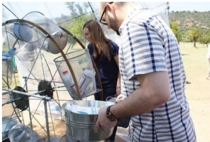
Figure 19: Josly van Wyk, Rietondale Eye , 2016. Household waste, galvanised pipes, metal, stainless steel waste bins and wood. 170 x 150 x 60 cm. Rietondale Park, Pretoria, RSA. (Photograph by Schalk van Wyk).

mounted in the same diagonal direction. The main wheel rotates on an axle attached to a stand. The metal wheel shows signs of rust, which contrasts with the untouched finish of the new waste bins. The lack of patina creates a varied metal palate of galvanised pipes, stainless steel bins and steel accents. Traces of rust also reflect the nature of Nomadic Objects as an outdoor exhibition. An interesting dynamic is found between the threat that natural elements pose to manmade industry, such as rust, and how industry in turn threatens the natural and urban environments by manufacturing packaging materials that become waste. I contrast this threatening aspect by allowing the participants to interact with the waste in an amusing way, where the performative nature of waste becomes entertaining. The works are playful and inviting. Participants would load Rietondale Eye on the one side, and then move to the middle to direct the movement forward, allowing the waste objects to fall as a result of their action. Therefore, the participants animate the waste as the sculpture moves, cascades and projects household waste in the air in such a way that a performative quality is instilled in the work.