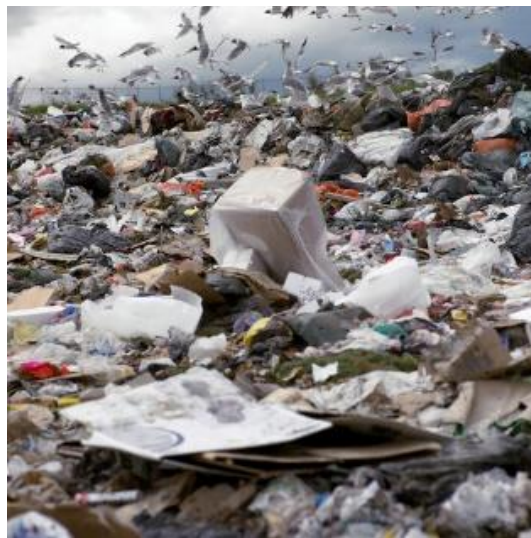
Figure 11: Ga-Rankuwa landfill, 2015. Dumping site for domestic and industrial waste. Pretoria, RSA. ( Rekord North 2015:[sp]).

2011:22). Apart from the manufacturing implications, paper and plastic packaging materials in South Africa measured by weight and volume account for six per cent of waste sent to landfills (Packaging Council 2011:22). This excludes waste sent to recycling plants (Packaging Council 2011:22). The packaging sector is constantly improving its environmental profile in an attempt to prevent food spoilage and product damage. However, in 2009 South Africa consumed 3,46 million tons of packaging and paper, which have been absorbed by landfills (Packaging Council 2011:22-23). Therefore, the landfills in South Africa need to absorb 3,46 million tons of plastic and paper packaging materials that encase consumer products (Packaging Council 2011:22). As waste materials, particularly packaging materials, present an overwhelming environmental threat, I investigated this problem through creative research. My aim is not to eradicate the production of packaging materials to eliminate household waste altogether. I consider this research study to be an imaginary inquiry that focusses my art practice on how I present the social agency of household waste to viewers.