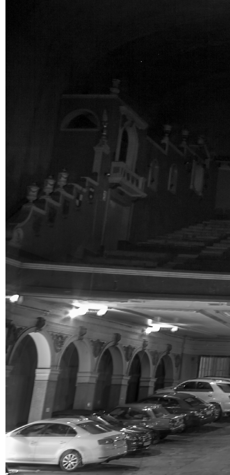
Fig. 5: (Right) The auditorium space is currently being used as parking garage since 1981 (Author, 2016). Refer to Context chapter.

Fig. 4: (Previous page) The Grand Foyer, as referred to by the proposal drawings, in its current condition (Author, 2016). This area as well as the adjacent spaces are relatively well maintained when compared to the auditorium space. (Pictured right) Events, private and restaurant hosted extent from the Entrance Foyer into the Grand Foyer and the adjacent spaces.