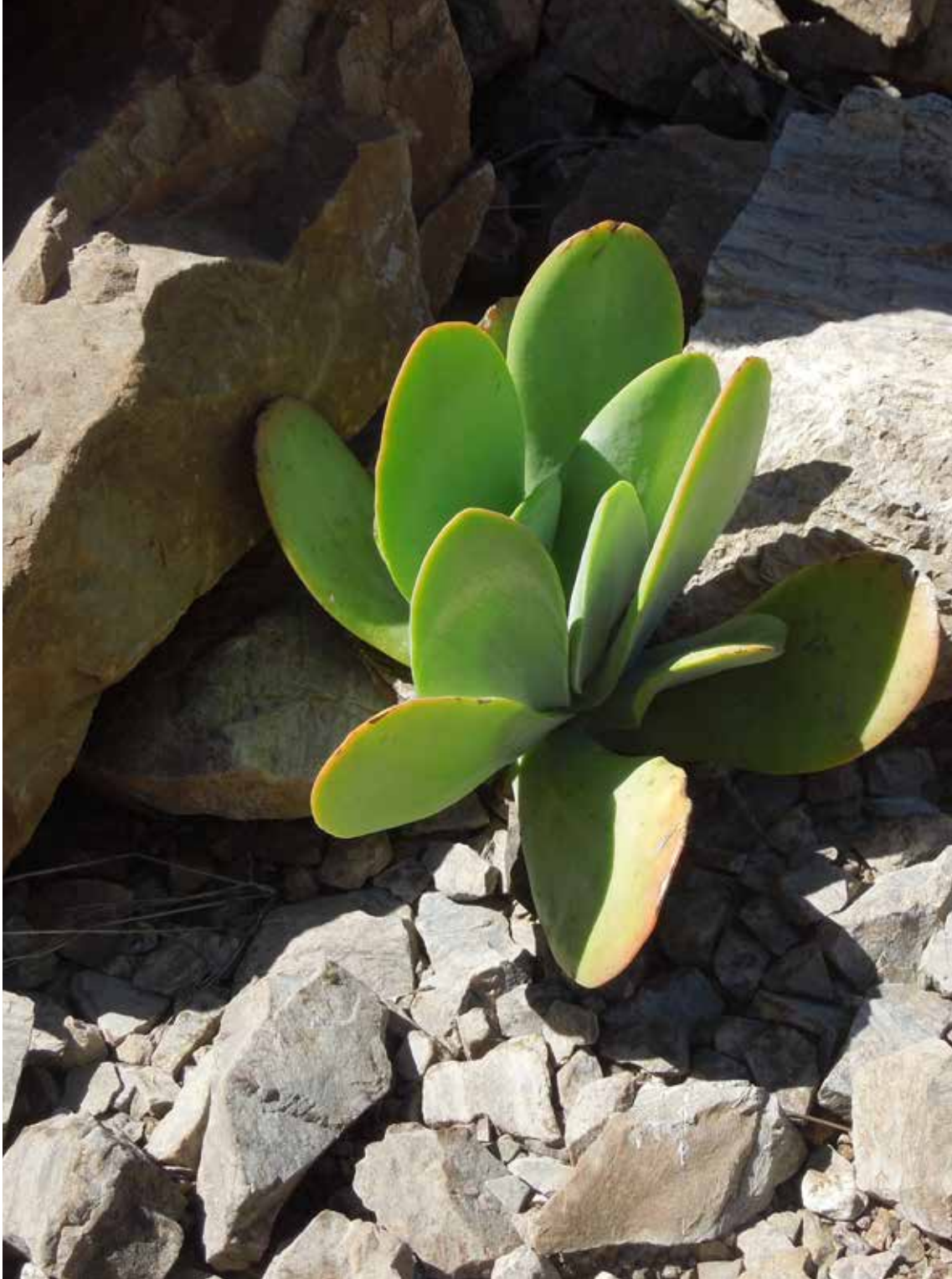
▲ FIGURE 4.8 SUCCULENTS IN QUARRY (Author, 2016)