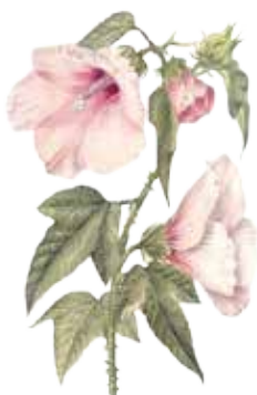
Fig 1.3 Hibiscus microcarpus