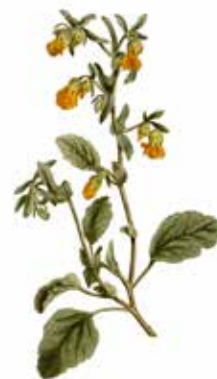
Fig 1.6 Hermannia depressa