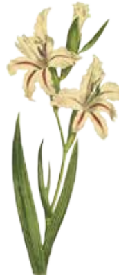
Fig 1.4 Gladeolus permeabilis