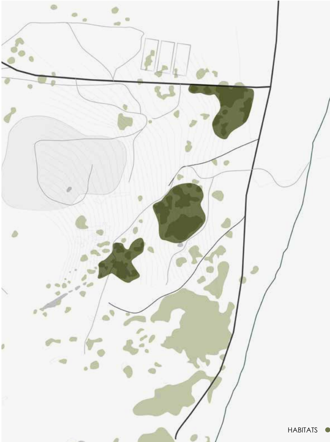
▲ FIGURE 4.3 HABITATS (Author , 2016)