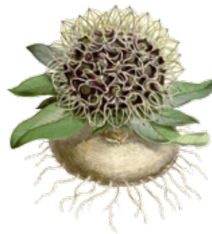
Fig 1.5 Brachystelma barberiae