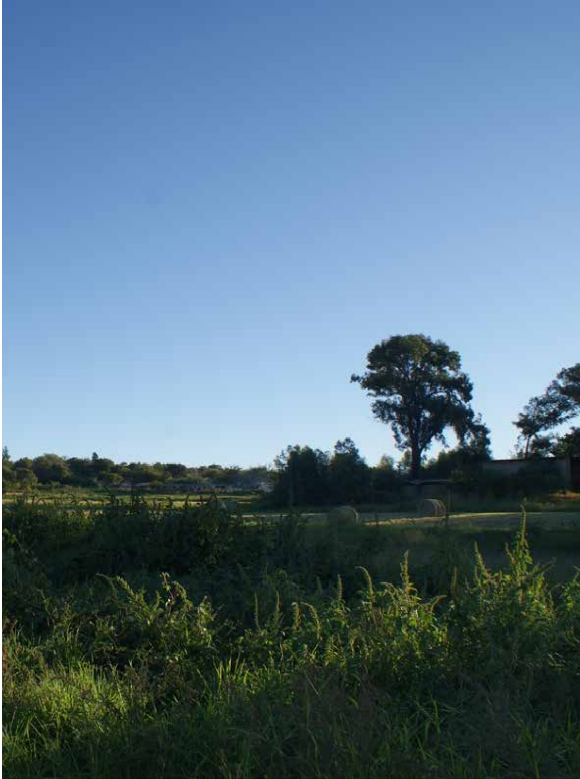
▲ FIGURE 4.4 STERKFONTein DIARY