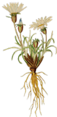
Fig 1.2 Eucomis autumnalis