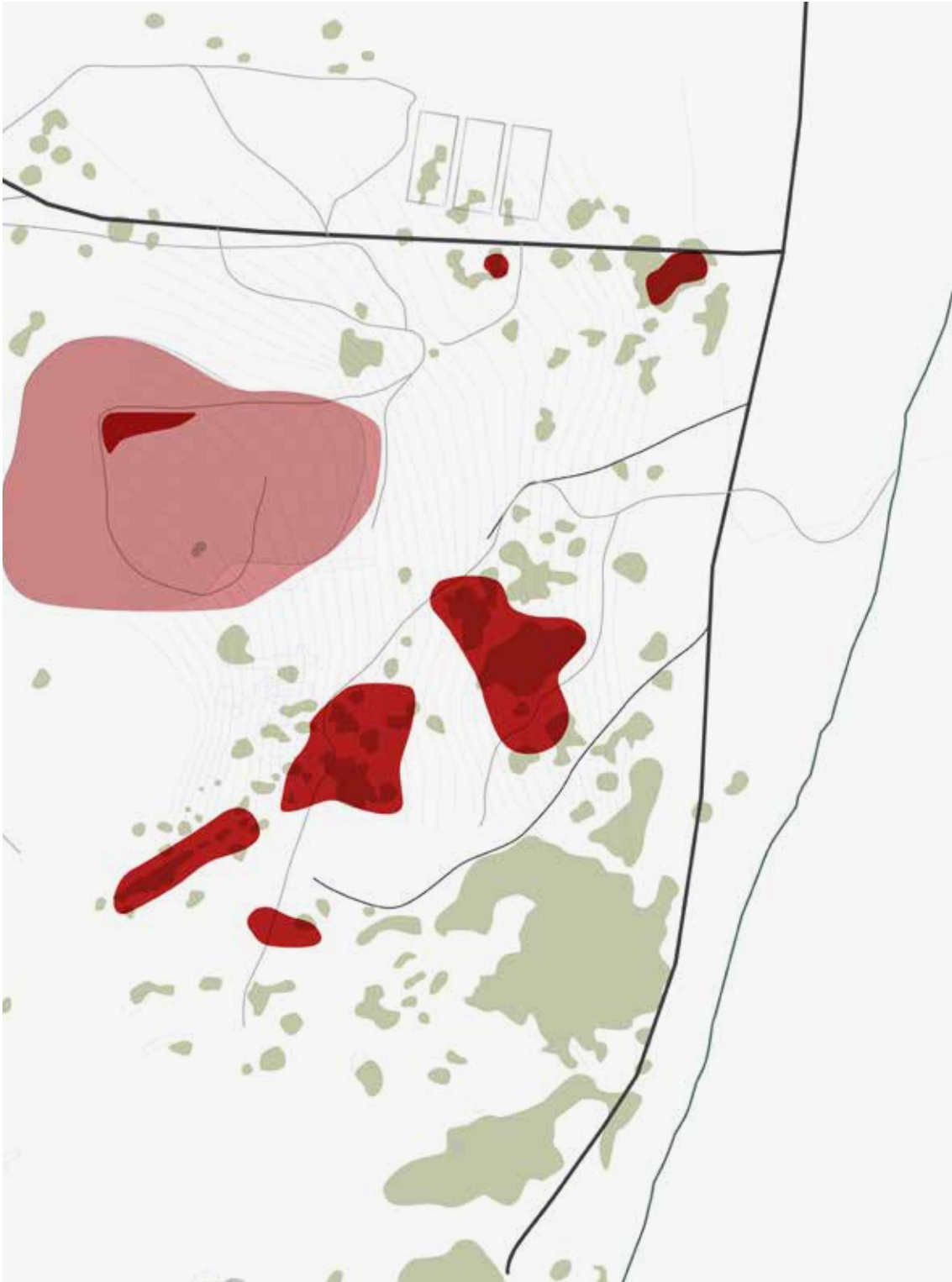
▲ FIGURE 4.7 HYDROLOGICAL VULNERABILITY (Author , 2016)