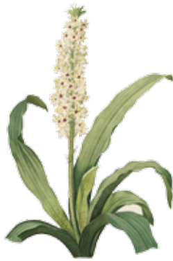
Fig 1.1 Eucomis autumnalis