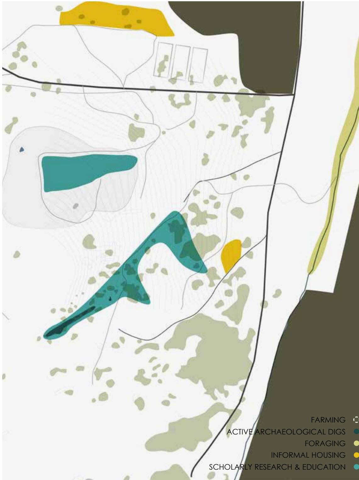
▲ FIGURE 4.5 ACTIVITIES (Author , 2016)