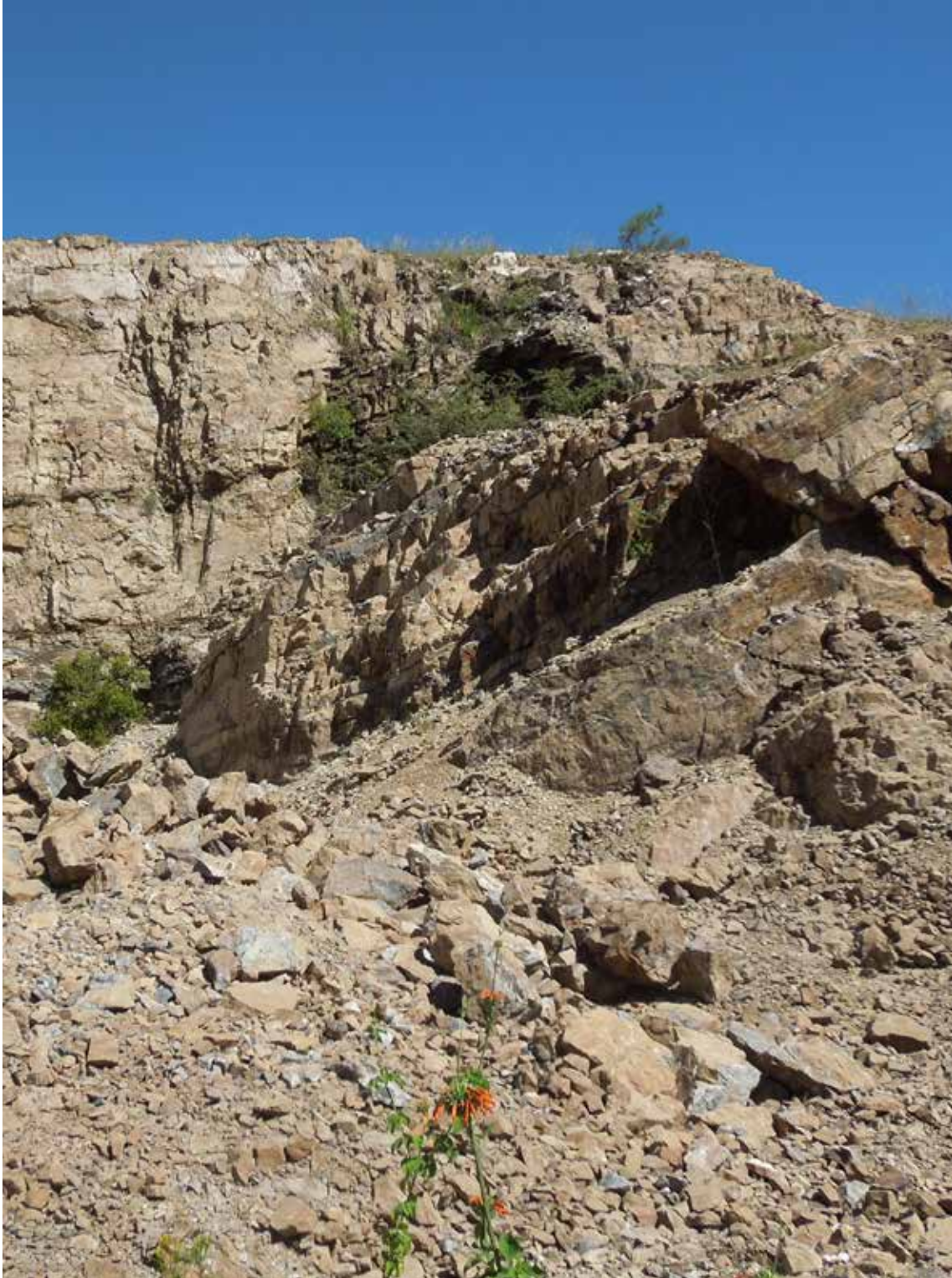
▲ FIGURE 4.6 CAVE OPENINGS IN THE QUARRY WALL (Author, 2016)