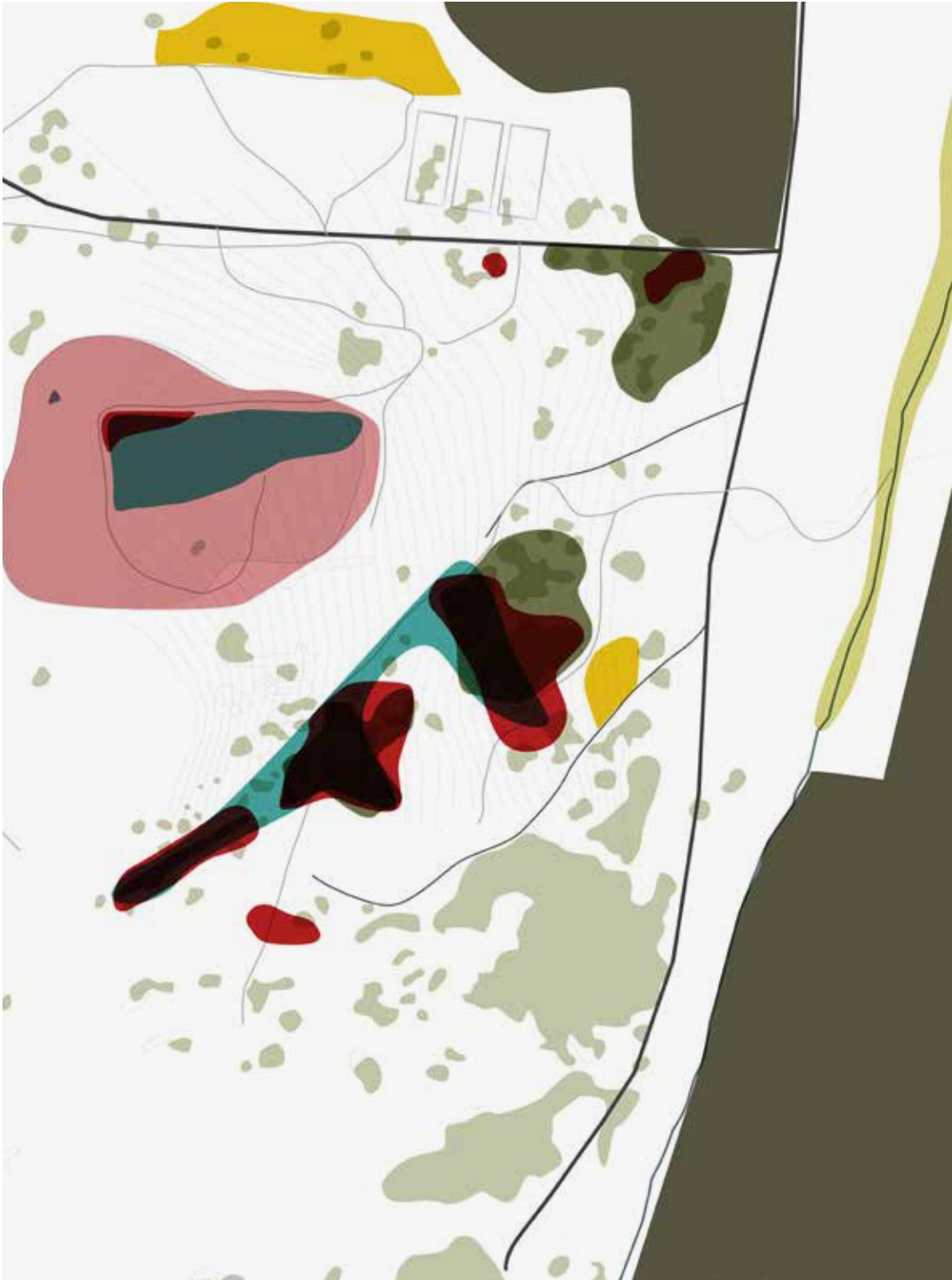
▲ FIGURE 4.9 ENERGY (Author , 2016)