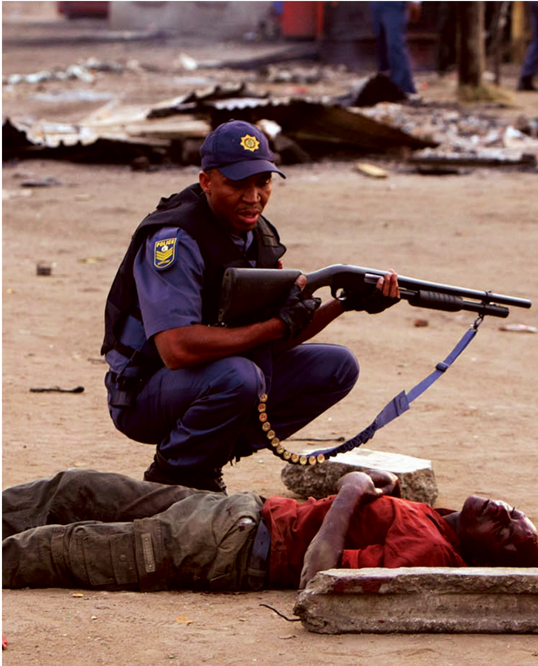
Figure 3. Xenophobic attacks in South Africa (Robinson 2015)

“Mozambican Emmanuel Sithole was walking down a street when four South Africans surrounded him. Sithole pleaded for mercy, but it was already too late. The attackers bludgeoned him with a wrench, stabbed him with knives, all in broad daylight” (Swails 2015).