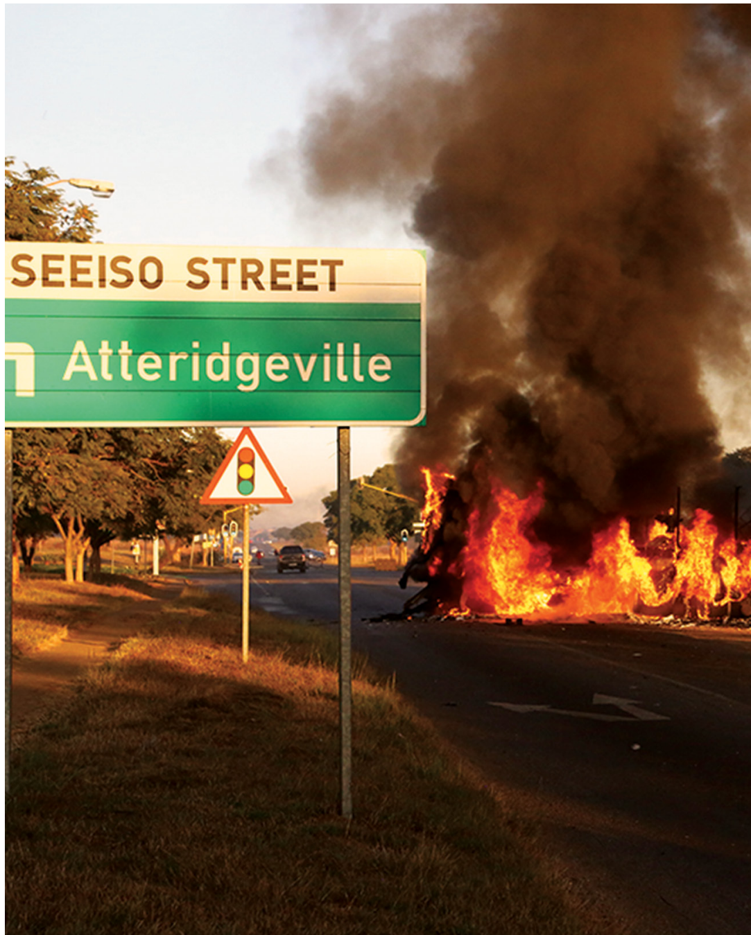
Figure 1: Protests against the appointment of Thoko Didiza as an ANC Tshwane mayoral candidate in the 2016 South Africa local government elections (Enca 2016)

“Highways blocked, motorists stoned, shops looted, the city centre evacuated and the police missing in action. This was the scene in South Africa’s capital on Tuesday” (Hosken 2016).