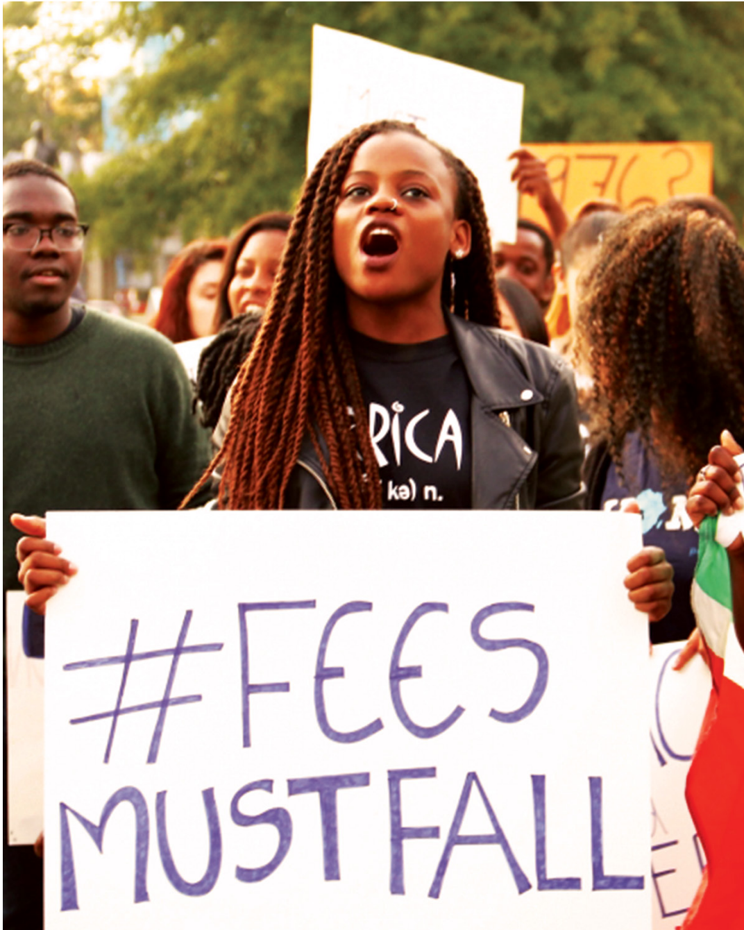
Figure 2. Fees must fall protests (Hidalgo 2015)

“Thousands of students demanding lower university fees gathered on Friday for a march to the Union Buildings in Pretoria... This after protests - some of them violent - broke out at universities across the country, taking the African National Congress (ANC) by surprise” (BusinessDay 2015).