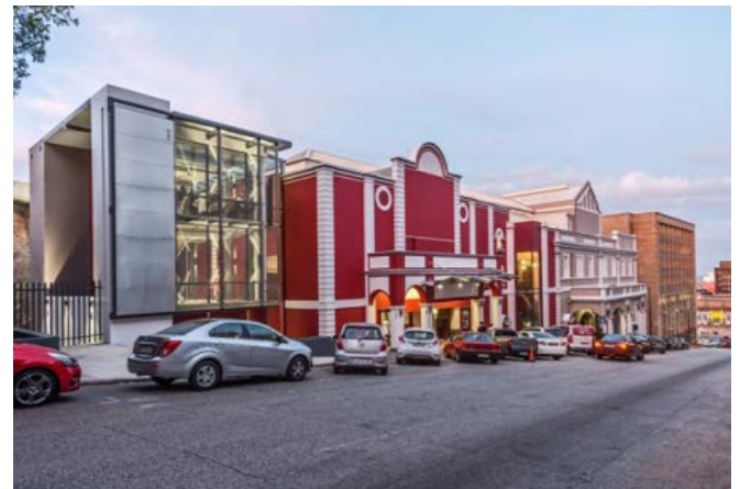
fig.2.3. PORT ELIZABETH OPERA HOUSE