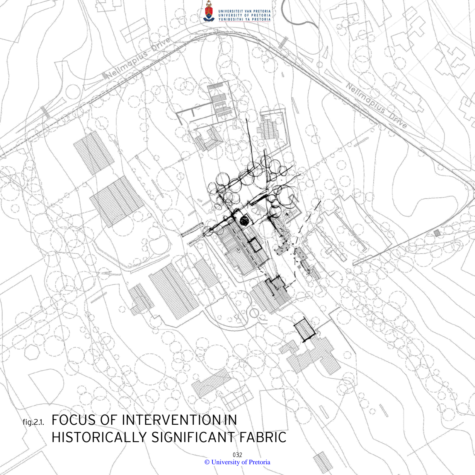
fig.21. FOCUS OF INTERVENTION IN HISTORICALLY SIGNIFICANT FABRIC