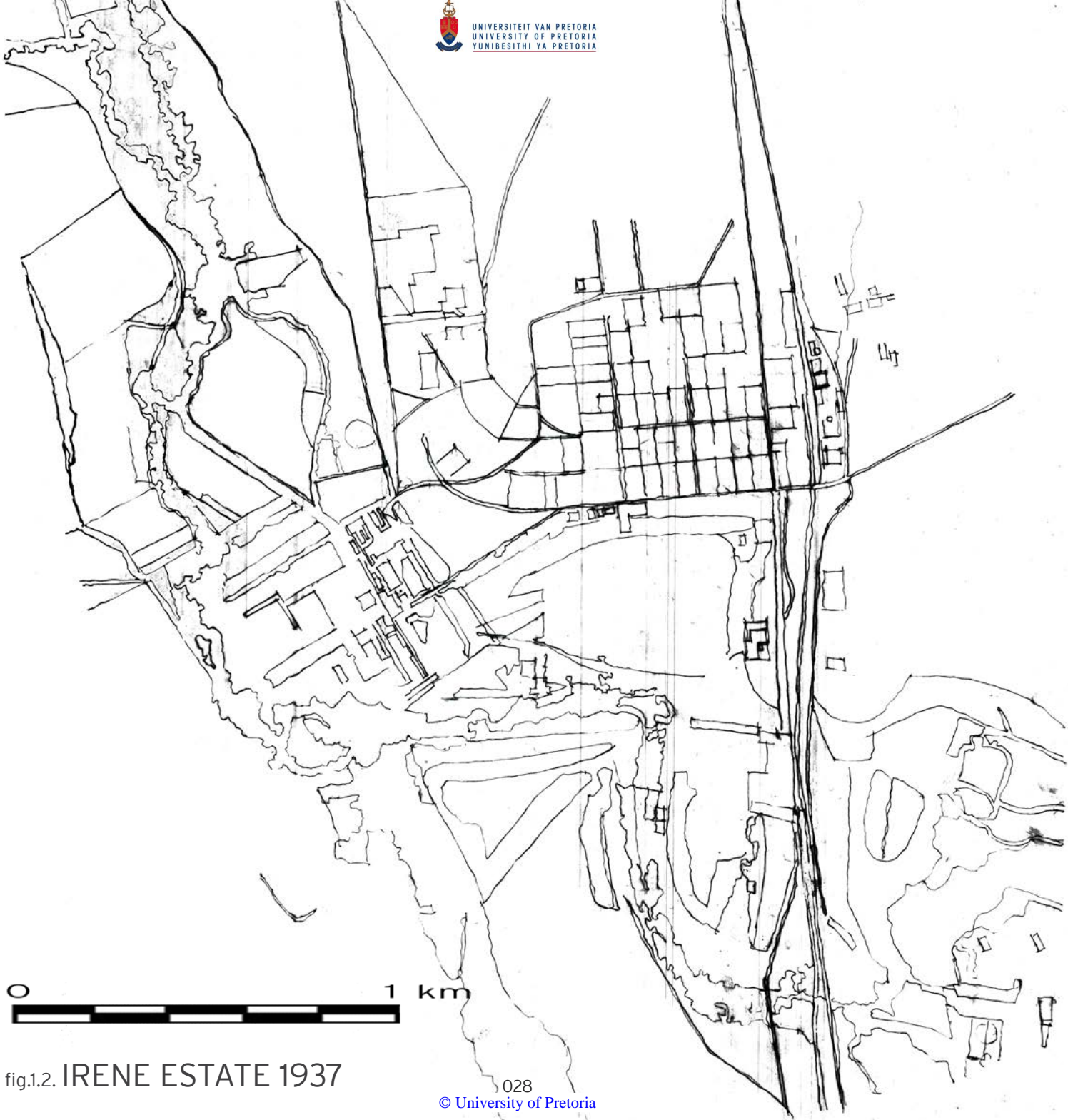
fig.1.2. IRENE ESTATE 1937