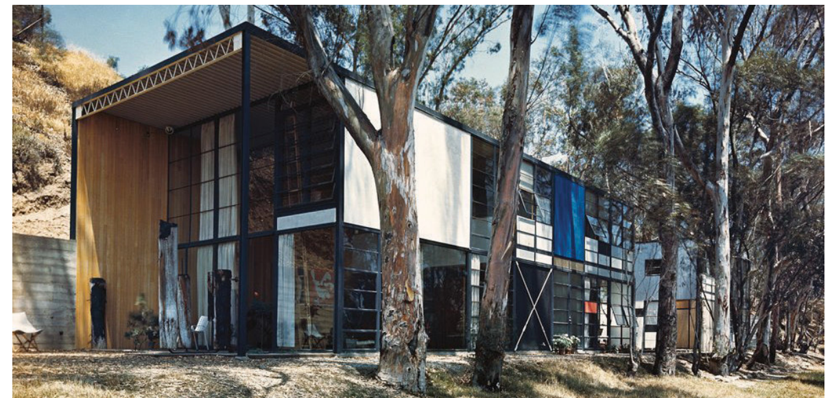
Left to right: 6.6 - Taliesin West, 6.7 Rolling Huts and Delta Shelter, 6.8 Tiny Diogene Hut, 6.9 Case Study Houses