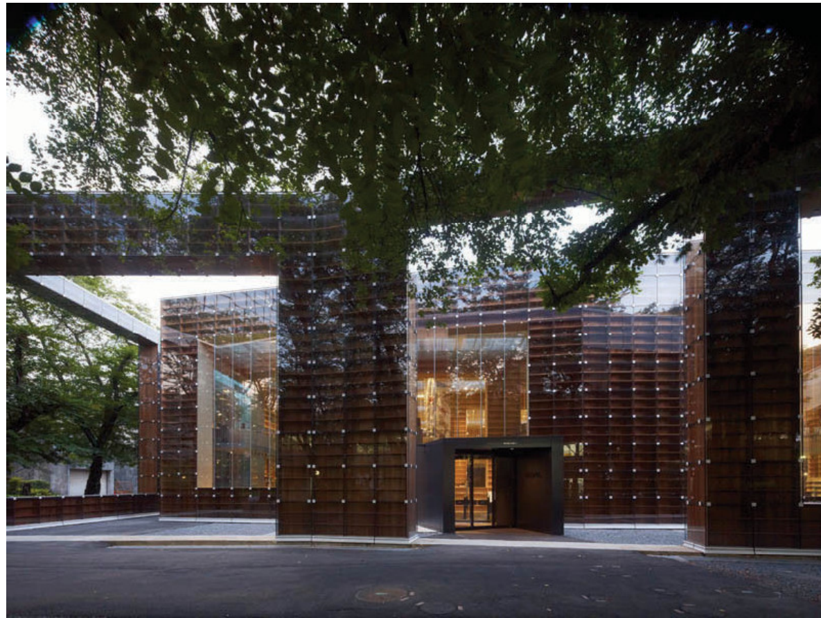
6.4 - Musashino Art University Museum & Library (Archdaily, www.archdaily.com).

The library, designed for the Japanese Musashino Art University, functions as an ark, with 100 000 open-archive shelf units with another 100 000 closed-archive units. The library is constructed out of shelf units, which become the books, light and place. The layered 9m high walls together with a spiral sequence of bookshelves wrap the periphery of the site as an external wall creating a relationship between the interior and exterior. Within the library exploration and investigation are opposing yet dependent entities, as investigation refers to the location of specific books, while exploration relates to the discovery of unexpected information. The space is therefore renewed and constantly reformed, while a logical system facilitates the existence of both systems (Divisare, 2012).