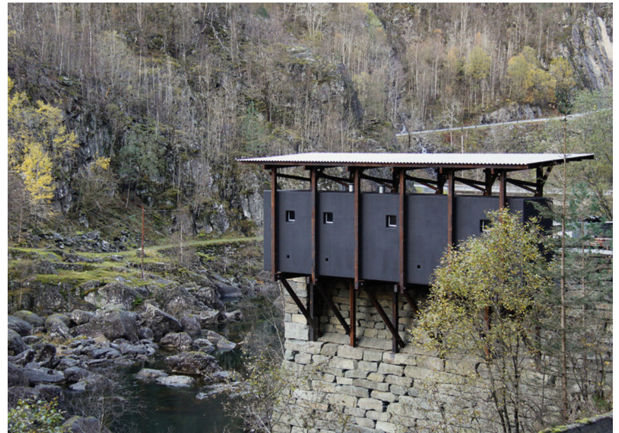
6.3 - Allmannajuvet Zinc Mine.

The Zinc Mine Museum was commissioned as an attempt to stimulate tourism in Sauda, Norway and celebrate a once-booming mining industry. Four buildings are clustered within a natural route upon Allmannajuvet gorge. The cluster includes a museum, café, shelter and service building. The buildings sit ghostlike above and away from the archaeological remains and are designed to look as though they have always been there (Meredith, 2014). The buildings are positioned in order to provide individual views of the landscape as birch and pine trees and the steep mountainside combine to form dramatic views. The buildings are supported by a timber grid in some instances perching along the side of a stone wall. The small and simplistic museum design is not poor, but modest, as it responds to the historic working conditions and circumstances of the mine workers. The timber framework and metal roofs become a dialogue referring to mining as well as the landscape (Hakanoglu, n.d.).