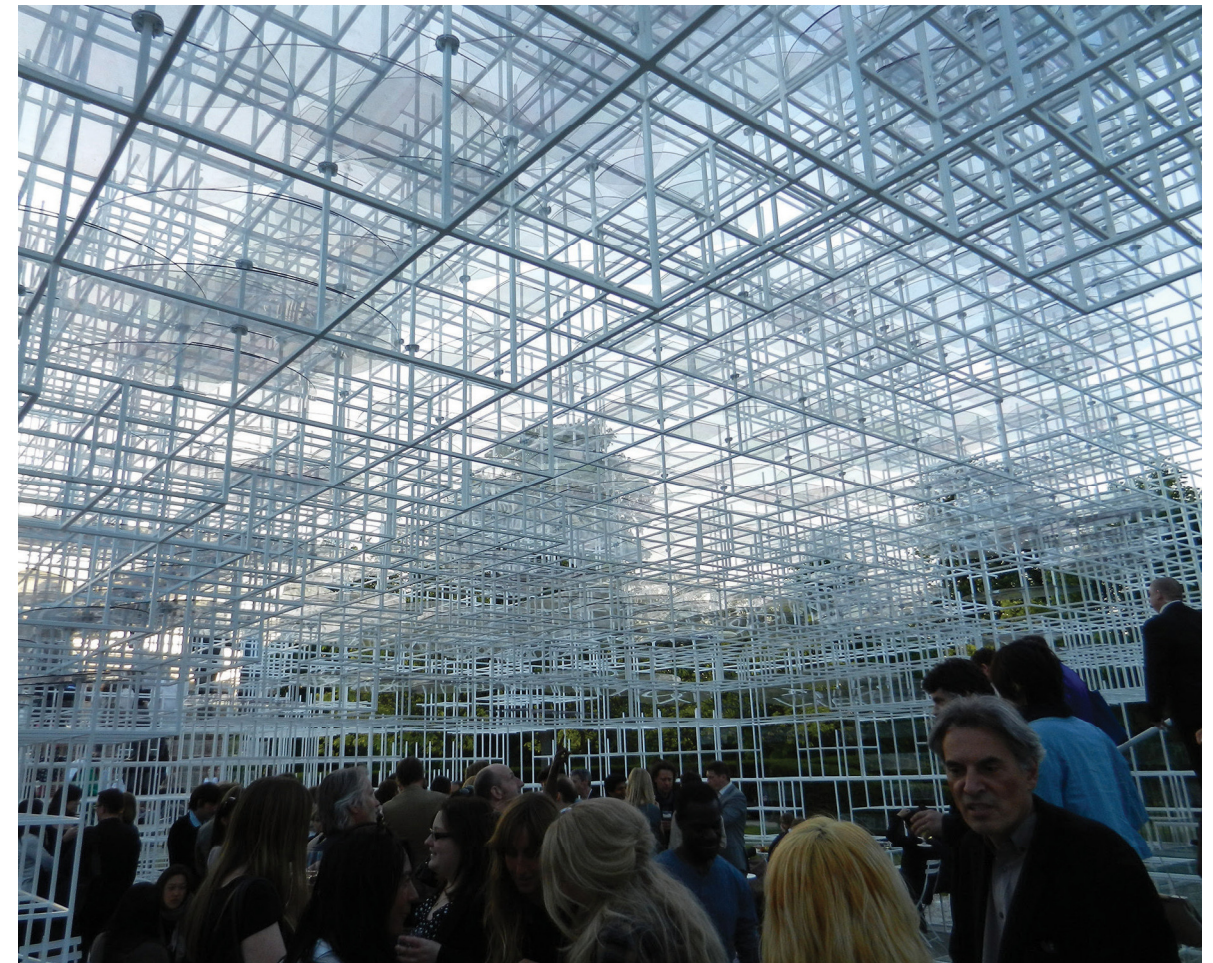
6.5 - Serpentine Pavilion (Archdaily, www.archdaily.com).

The pavilion by Sou Fujimoto became the first pavilion the public could interact with. The three-dimensional steel grid created from 400 mm steel bar modules create a light structure which is broken in certain areas to allow public access as well as different uses within. The structure becomes translucent to the landscape, encouraging exploration of the site. The concept of manmade geometry blends with the natural and human, the geometry and greenery are merged in order to create a new environment. The structure protects visitors from the landscape while allowing them to move through it (Portilla, 2013).