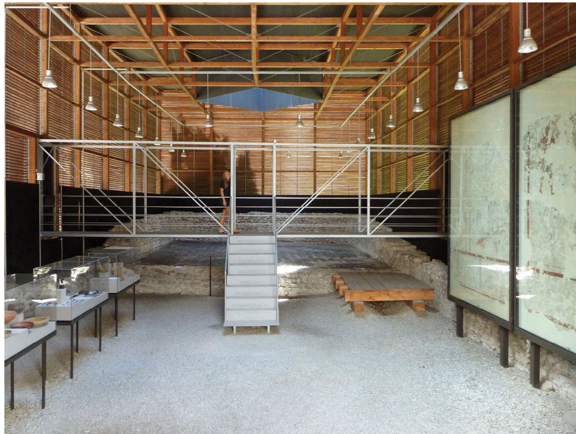
6.5 - Shelters for a Roman Archaeological Site.

Excavations in Chur, the oldest Swiss town, unearthed a complete Roman Quarter. Authorities decided to preserve the excavations and open it for public exhibition. Zumthor, through the use of a lightweight wooden enclosure designed a protective wooden pavilion, not only as a protective enclosure but also as a museum. The design consists of "cases", referring to a volumetric reconstruction of the original Roman buildings with the entrance placed on one of the side facades. The metal box entrance is suspended from one of the timber walls, avoiding contact with the ground where the entrance then extends to a modern metal Pratt type beam footbridge. The footbridge functions as a raised observation level (Martin, 2013).