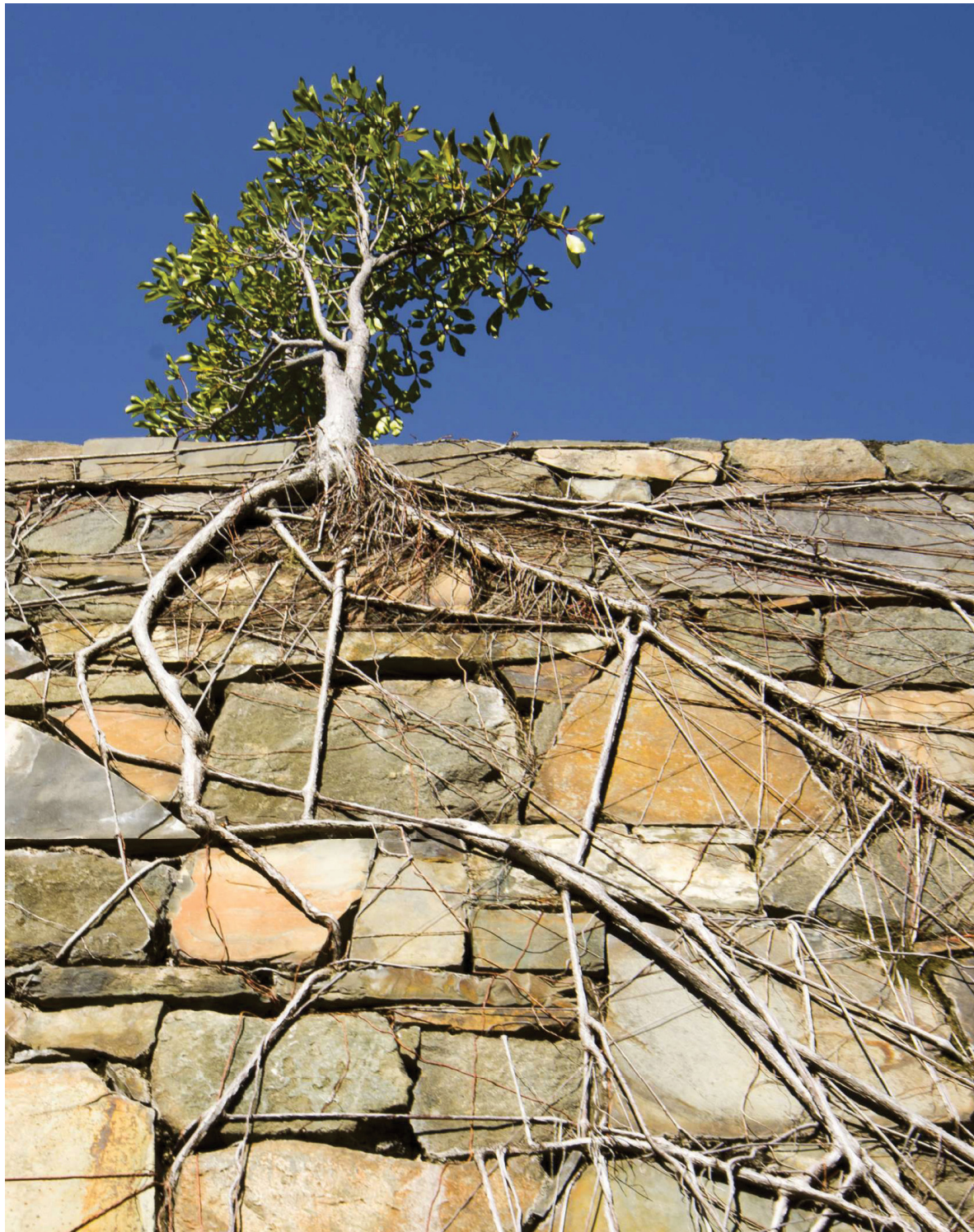
6.2 - Coromandel Estate Manor House.

Coromandel Estate is located in Lydenburg, South Africa, and has become an iconic ruin, overwhelmed with mystery and tragedy. The design has allowed the structure to adapt and fuse with the landscape as the approach was one of manipulation of the landscape, offering shelter within rational lines. The structure consists of a planted roof with indigenous and endemic plants. These plants have grown on the cavity walls and spread along stone cladding, creating an ecological landscape and habitat (Peres, 2013:34-35).