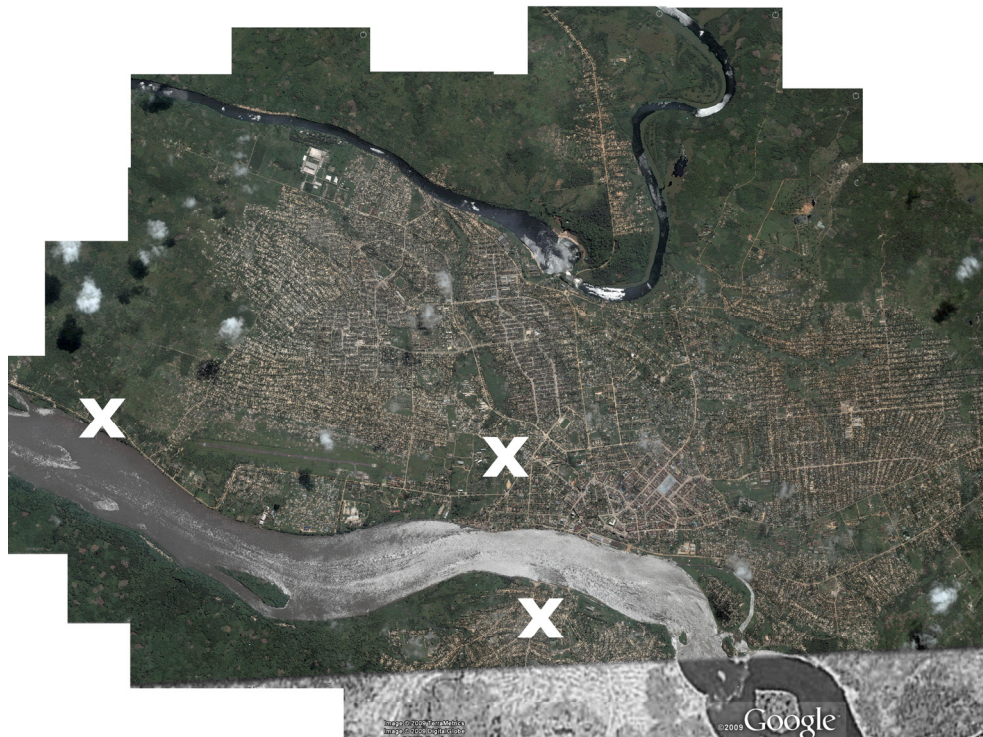
FIGURE 5: Kisangani map based on Google Earth, Image © 2009 TerraMetrics, Image © 2009 DigitalGlobe © 2009 Google, © 2009, and: acupuncture the city

The concept of decentralization is essential towards understanding how Studios Kabako operates on all levels – from its choreographic details in staged dance and theatre pieces, to its strategic plans for urban appropriations. Even the question of “why Kisangani, not Kinshasa?”, aside from personal reasons, is argued for with the strong conviction of contributing to the decentralization of cultural life and the Congolese art scene, which, until now, has been focused on Kinshasa (and towards Europe), in order to bring back the focus to one of the province cities of the Congo.