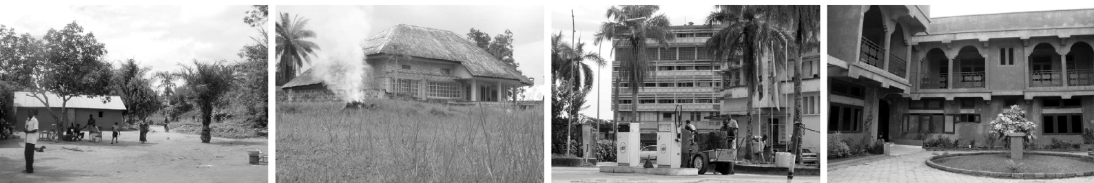
FIGURE 4: Kisangani: vernacular, Belgian-colonial, Modernistic and contemporary structures

What else characterizes the city at first glance? The movements of people - walking, cycling, carrying goods; the flow of the two rivers embracing the city, silent and powerful at the same time; the strong presence of history or a plurality of histories which define(s) the identity/ identities of the city: all have left their explicit physical and mental traces.