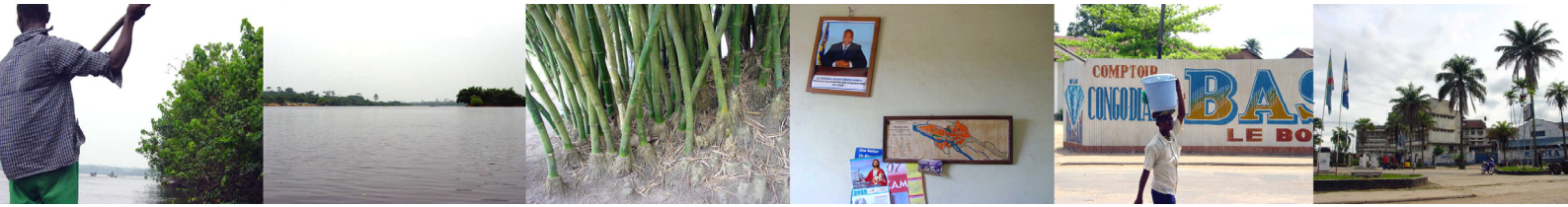
FIGURE 3: Kisangani: impressions, © Bärbel Müller

Kisangani is a village and a city at the same time, embedded into an endless forest, held by two rivers. It is a beauty, rich of green, which is greener than anywhere else; clean air, red earth, the presence of water. There is a pervasive silence which, on the one hand, seems peaceful, but on the other, feels like the aftermath of a traumatizing experience, which was a war. Characterized by scars and decay: the city is an aged beauty, but at the same time, seems very young and at the beginning of a new era.