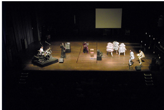
FIGURE 10: Studios Kabako: rehearsals and performance of the piece more more more... future in the KVS Theater in Brussels