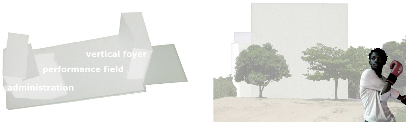
FIGURE 6: Studios Kabako Makiso: design for a small performance centre, architect: Bärbel Müller

In Makiso , the administrative and economic centre of Kisangani, the representational aspects of Studio Kabako will converge, both on a programmatic and on an architectonic level. It is the place for showing work, it is meant to be a stage that communicates with the city and the outer world, a space that is open to the city and allows the city to come in. Events, concerts, and projections shall take place. This centre is designed to become the landmark of Studios Kabako, the sign leading into the city, which is reflected in its architecture.