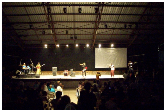
FIGURE 11: Studios Kabako: stage set-up in Bandal, Kinshasa, and a performance of the piece more more more... future in the French Cultural Centre in Kinshasa / © Studios Kabako