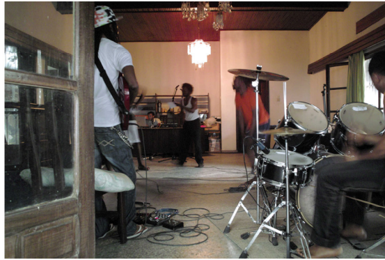
FIGURE 8: Studios Kabako film workshop 2008 in a rented space / rehearsal of the piece more more more... future in the living room of a rented house