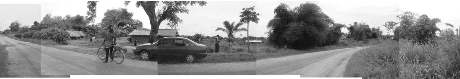
FIGURE 7: Studios Kabako Simi Simi: panorama view of the site, 2009

Studios Kabako is intending to work with selected groups of inhabitants in this community, privileging the idea that change and development should occur internally. The ambition is to foster socio-political, intellectual, and artistic production through a program of workshops, meetings, projections, and more. Art here is meant to serve as “a bridge to talk about other things that are there around us” (Linyekula 2009). The spatial scheme is meant to revitalize an abandoned colonial structure.