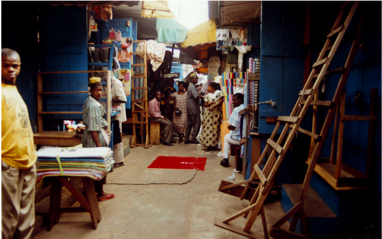
FIGURE 1: listening kumasi : Performative intervention Central Market Kumasi, 2002

period, one square metre of red fabric – as a space-generating tool, metric system, and ex-territorial architectonic space - was implemented at each point and field. In addition to spatial facts, cultural and social behaviour became perceivable, and short-term spaces of communication were revealed.