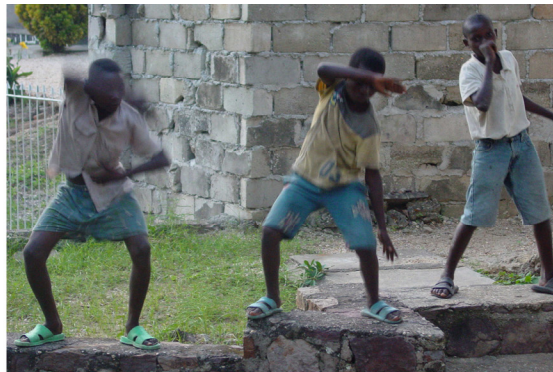
FIGURE 9: Studios Kabako: rehearsals of the piece more more more... future with audience participation