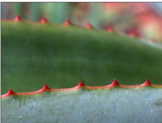
Figure 2. The channelled leaves of Aloe candelabrum have margins armed with reddish-brown teeth.