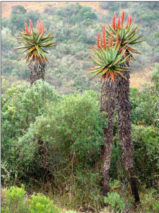
Figure 12. Tall specimens of Aloe candelabrum at Izingolweni, southern KwaZulu-Natal province. These plants share various characteristics with A. ferox , including erect to spreading leaf orientation.