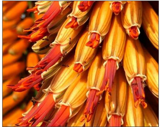
Figure 5. Another Ashburton flower form of Aloe candelabrum is orange, with scarlet and rose-pink forms also present. The flared white inner tepal apices are conspicuous.

The closest relative of Aloe candelabrum is Aloe ferox , both of which are included in Group 4B of A. sect. Pachydendron Haw. (Reynolds, 1950: 442). This has been confirmed by HPLC analyses of leaf exudates that reveal similar profiles for anthrone and chromone derivatives (Viljoen et al. , 1996). Aloe ferox is a species very widely distributed in the southern and east-central parts of South Africa, as well as southern Lesotho. It is similarly distinguished by a tall [2–3(–5)m] erect, unbranched stem with persistent dried leaves and a terminal rosette (Figure 7). The leaves of Aloe ferox are typically erect to erectly spreading (rarely up to 100cm), with marginal teeth of ca. 6mm long (Figure 8) and both surfaces either smooth or with irregularly scattered, pungent spines. The lower surface bears a few spines in the median line near