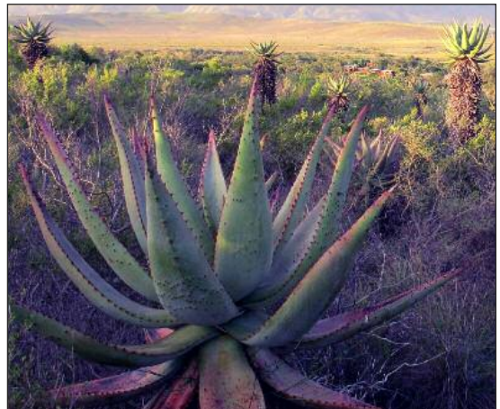
Figure 9. Population of Aloe ferox south of Swellendam, Western Cape province. Both leaf surfaces are either smooth or with irregularly scattered, pungent spines, and the lower surface has a few spines in the median line near the apex.