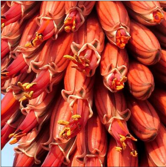
Figure 4. Orange-red flowers of Aloe candelabrum , with prominent white flared tepal apices, Ashburton, KwaZulu-Natal province.