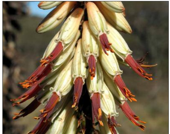
Figure 6. Rare white flowers of Aloe candelabrum , Ashburton, KwaZulu-Natal province.