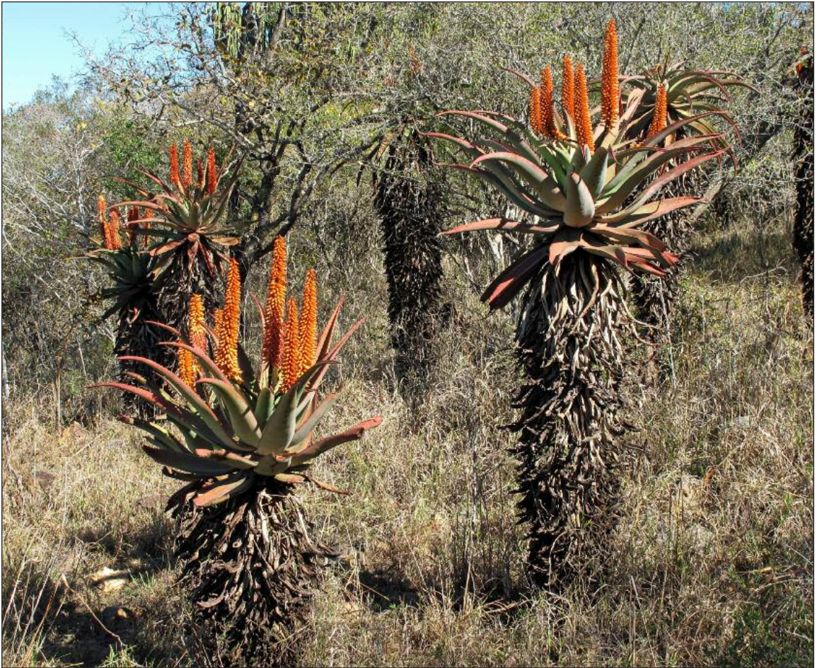
Figure 1. The large rosettes of Aloe candelabrum are carried atop robust stems that are clothed in the remains of dry leaves, Ashburton, KwaZulu-Natal province.