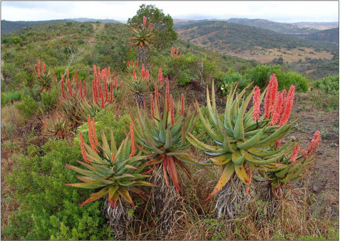
Figure 14. Some recurved leaves are shown in this group of Aloe candelabrum plants at Izingolweni, southern KwaZulu-Natal.

parable niche in the littoral zone. However, unlike A. thraskii , A. africana also occurs at locations in the interior (see maps in Van Wyk & Smith, 2014: 52 [ A. africana ] and 80 [ A. thraskii ]).