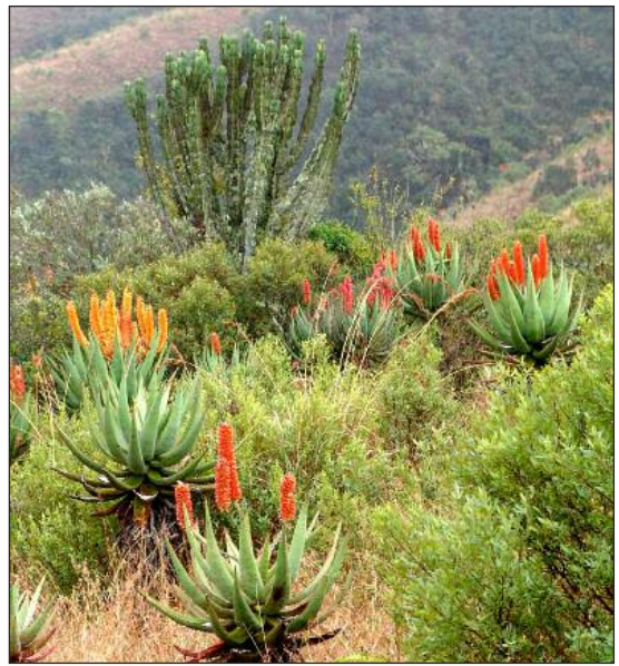
Figure 13. Colony of Aloe candelabrum , Izingolweni, southern KwaZulu-Natal. Flower colour variation is evident, as is the absence of recurved leaves.