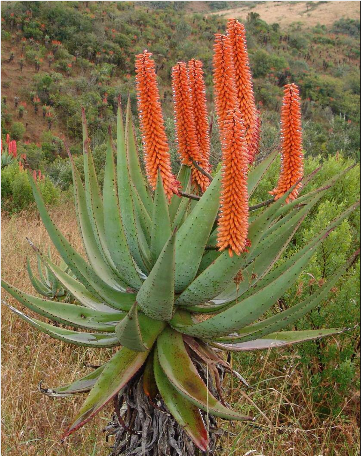
Figure 15. The arrangement of leaf prickles on this Aloe candelabrum plant at Izingolweni in southern KwaZulu-Natal is comparable to that observed in some Aloe ferox specimens from the Eastern Cape province.