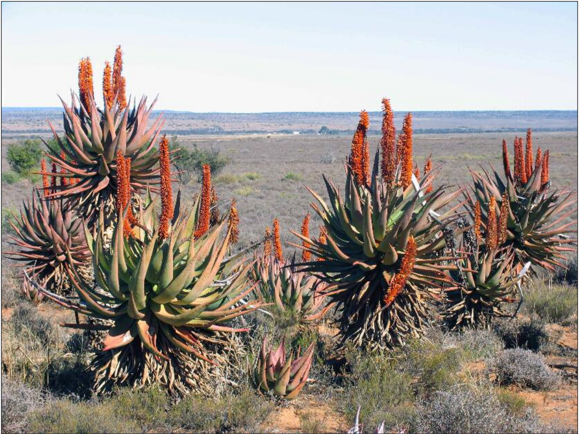
Figure 7. Colony of Aloe ferox plants, Jansenville, Eastern Cape province. Robust stems clothed in persistent, dried leaves present rosettes of erect to spreading leaves, rarely recurved.