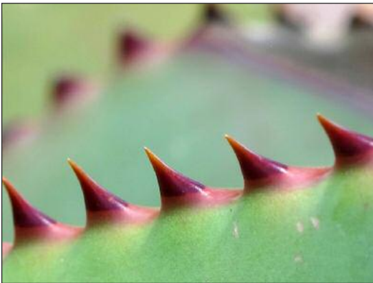
Figure 8. Pungent reddish-brown spines along the leaf margins of Aloe ferox , Nieu Bethesda, Eastern Cape province.