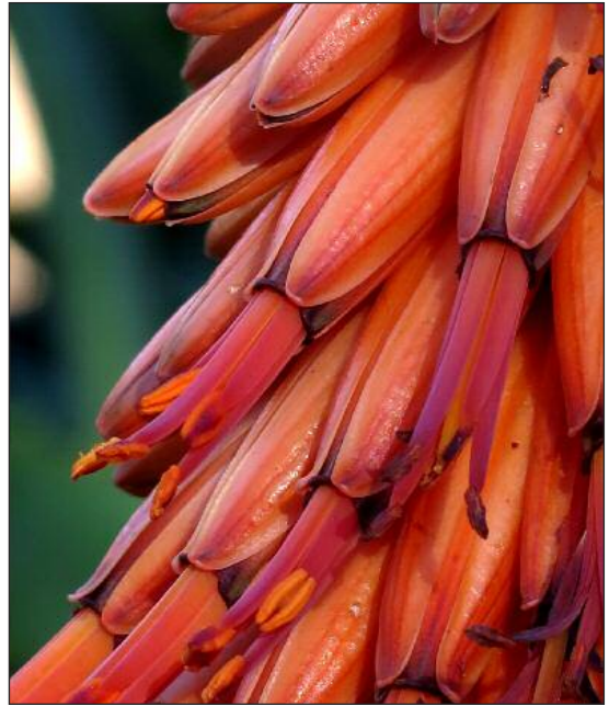
Figure 11. Reddish-orange flowers of Aloe ferox , with inner tepal apices that seemingly clasp the extended filaments, Queenstown, Eastern Cape province. The tips of the inner tepals of Aloe ferox are brown to deep brown, or at least more intensely coloured than the rest of the corolla.