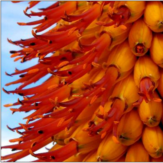
Figure 10. Bright orange flower form of Aloe ferox , also with prominent, dark inner tepal apices that typically do not flare, Jansenville, Eastern Cape province. Across its range, perianth colour varies from scarlet through orange and yellow to white.