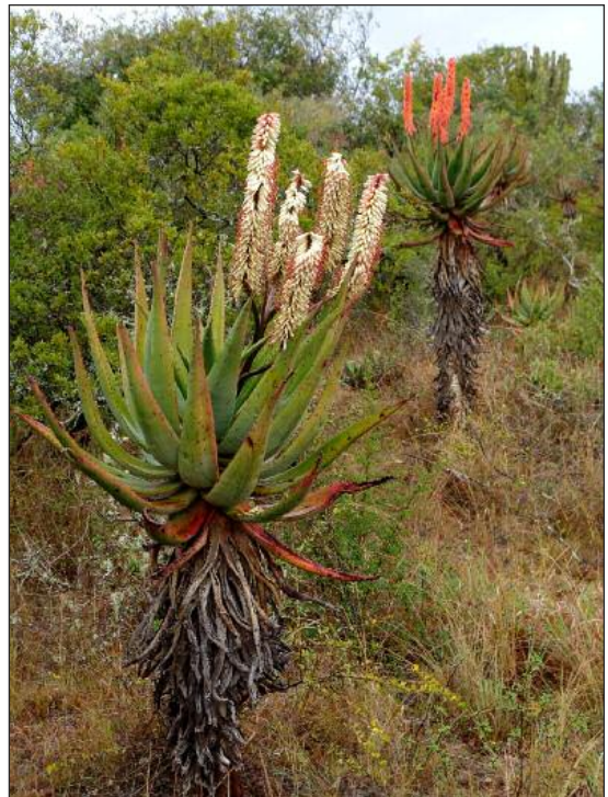
Figure 17. A white-flowering plant of Aloe candelabrum at Izingolweni in southern KwaZulu-Natal.

Aloe candelabrum A.Berger in Notizblatt des Königlichen Botanischen Gartens und Museums zu Berlin-Dahlem 4 (38): 246 (1906). A.Berger in Das Pflanzenreich IV. 38. III. II. Heft 33: 306 (1908); Dyer in The Flowering Plants of South Africa 24: t. 945 (1944); Groenewald, Die aalwyne van Suid-Afrika, Suidwes-Afrika, Portugees Oos-Afrika, Swaziland, Basoetoeland, en ’n spesiale ondersoek van die klassifikasie, chromosome en areale van die Aloe Maculatae : 66 (1941); Reynolds, The aloes of South Africa : 468–470 (1950); Jeppe, South African aloes : 39 and plate on following page (1969); Jacobsen, Lexicon of succulent plants. Short descriptions, habitats and synonymy of succulent plants other than Cactaceae : 74 (1970); Bornman & Hardy, Aloes of the South African veld : 260–261 (1971); Jacobsen, A handbook of succulent plants, vol. 1 : 149–150 (1986); Smith & Van Wyk, Aloes in southern Africa : 86 (2008); Grace et al. , The aloe names book : 30 (2011). Type: [South Africa] Flora of Natal, N [Natal] Botanic Gardens, July 1890, J. Medley Wood 4345 (B†, holo-; US US00680243!, iso-). Note: The holotype is not extant at B and was probably destroyed in 1943, during WWII (R. Vogt, pers. comm. on 28 July 2016).