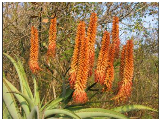
Figure 3. The inflorescences of Aloe candelabrum resemble chandeliers, and have up to 12 raceme branches. Although not obvious in this Ashburton plant, the terminal raceme is often longer than the laterals.