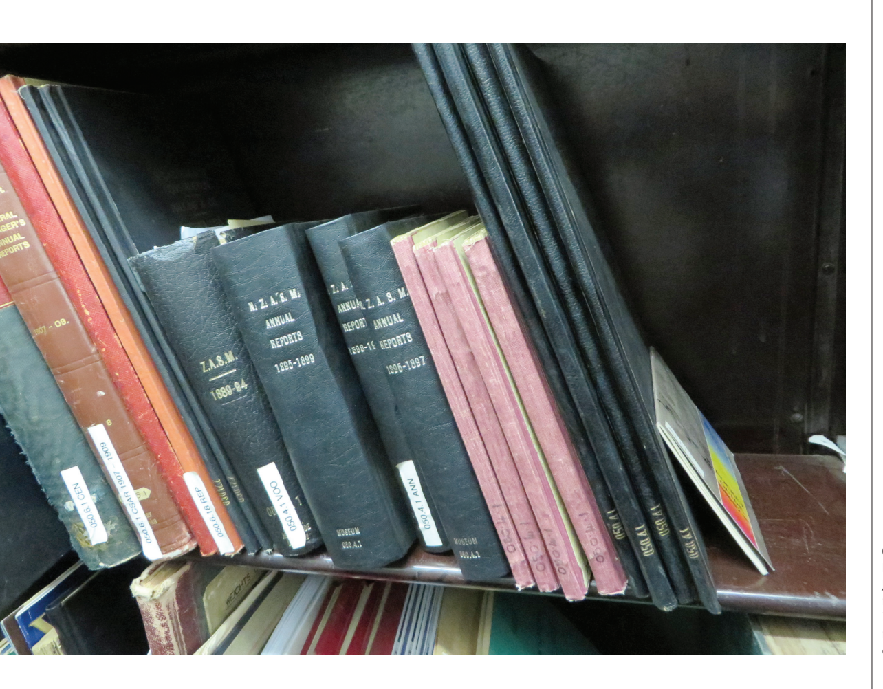
01.03 The Transnet Heritage Archive, Johannesburg, contains much information on the NZASM, a lot of which has never been accused and catalogued.

To synthesise the data, input it into a digital database and transfer this database to the SAHRIS platform. Additionally to select 15 sites or ensembles to add to the www.dutchfootsteps.co.za web-platform.