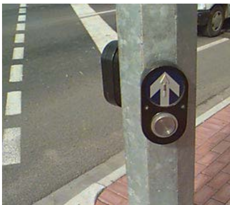
Figure 2: Pedestrian operated, audio signal (4)

People using mobility aids such as wheelchairs need a way to get from the sidewalk to the pedestrian crossing without going down a drop (2) . Dropped kerbs (Figure 3) are the most common method of installing wheelchair access when applying UA. The ramp needs to lead people directly onto the pedestrian crossing. This is a very cost effective design that allows more resources to be used for other UA design elements such as audible signals (Figure 2). This works in places with a low speed limit.