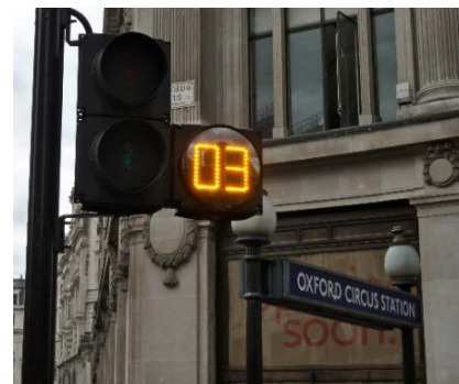
Figure 7: Countdown traffic signal

London has implemented a system called Pedestrian Split Cycle Offset Optimisation Technique (SCOOT) that is an adaptive traffic control system. It uses cameras to estimate how many people are waiting at a pedestrian crossing and adjusts the time required for people to cross accordingly which increases the safety of the crossing and can also benefit people with disabilities who may take longer to cross the road. The traffic signals display the amount of time left to cross the road (Figure 7).