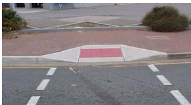
Figure 3: The design construction of a dropped kerb (4)

Raised pedestrian crossings (Figure 4) and raised intersections can be very effective for wheelchair access in that there is no change in gradient of the pathway. This type of