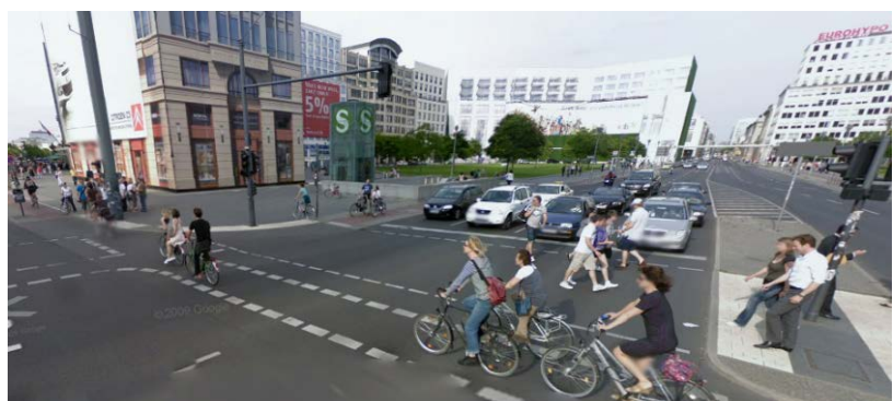
Figure 8: Pedestrian and bicycle facilities, Potsdamer Platz

In Berlin, Potsdamer Platz showcases (Figure 8) wide crossings on a dropped intersection. It makes use of tactile paving with contrasting colour to help visually impaired people and the gentle slope makes the crossing more pleasant for wheelchair users. The variety of signals provided