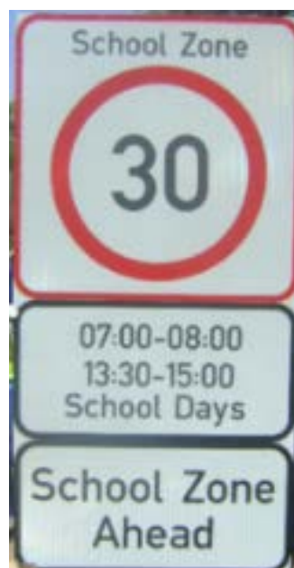
Figure 1- School Zone Sign

Figure 1 depicts the school zone sign which was designed and manufactured for the project.