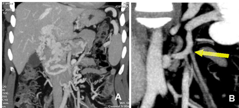
Figure 2 (A) Abdominal contrast enhanced computed tomography scan (coronal view), in the portal venous phase depicting the underlying portal-systemic shunt. Multiple collateral vessels are also present. (B) Coronal venous reconstruction demonstrating the left testicular vein (yellow arrow) draining via the retroperitoneal collateral system to the left renal vein.

Patients with underlying portal hypertension and a porto-systemic shunt rarely present with a right-sided or bilateral varicocele. A Pubmed search (with cross referencing) using the search terms; 'varicocele AND portal hypertension' and 'varicocele AND porto-systemic shunt' only revealed the following four previously reported cases (Table 1) [1-4].