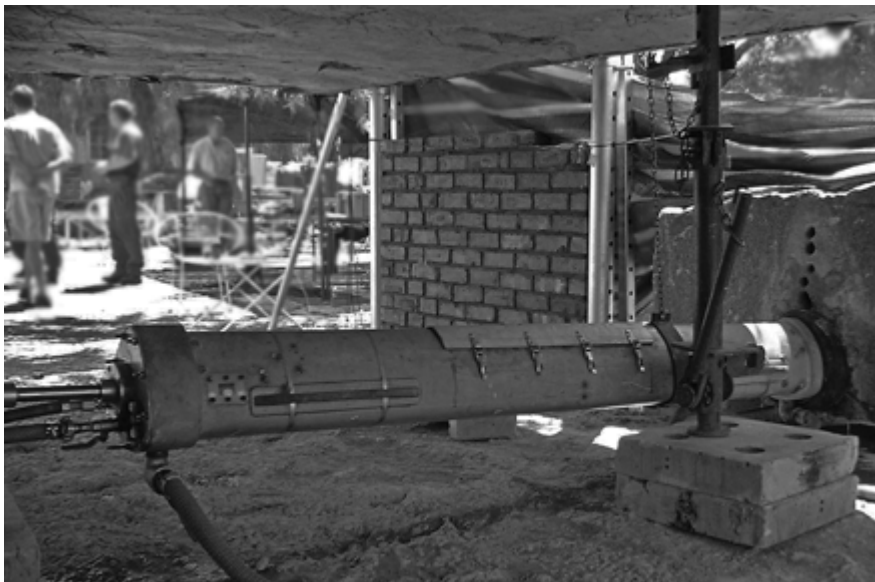
Fig. 1 Self-propelled drill in the above-ground artificial stope.

The testing was carried out during the course of one day in an above-ground artificial stope (Fig. 1) that was developed to simplify and standardise various aspects of testing. The stope comprises a cast concrete floor and adjustable height concrete slab roof, to simulate various stope heights. The floor and roof are both profiled to correspond to typical rock conditions in South African stopes. The artificial stope was developed to reduce the logistical burden for some categories of routine ‘underground’ testing.