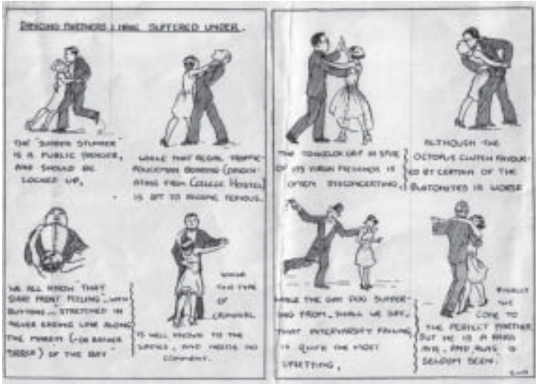
Figure 4. Students struggling to dance. ( Vocator , Transvaal University College, 1908-1928, opposite p. 8)