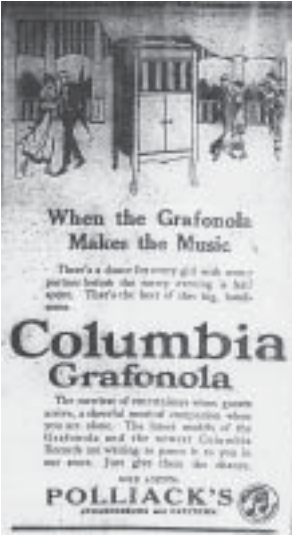
Figure 2. Advertisement in the Rand Daily Mail , 1921-01-15