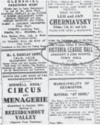
Figure 3. Advertisement in the Rand Daily Mail, 1921-01-06.

sent out in the press, such as the Rand Daily Mail and the Sunday Times [Figure 3]. 61 The detail that was required to arrange these balls was impressive. One could not simply decide to have a dance, these balls required a substantial amount of money, adequate space and a lot of pre-planning – all elements that were readily available to the office of the governor-general.