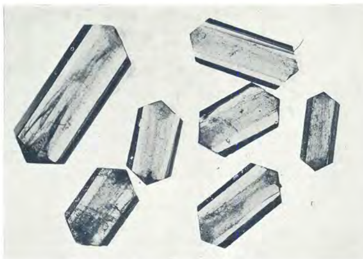
Fig. 1.—Isatidine \times 10 .

The crystals are tabular to prismatic in habit and show the following crystal forms: brachypinacoid, the unit prism, the macrodome, the brachydome and sometimes a very small development of the base.