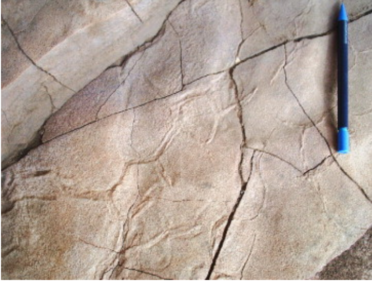
Fig. 1. Sand cracks preserved in c. 1.8 Ga sandstones of the Waterberg Group, South Africa. Note overlying sandstone bed succeeding that with the cracks, without the presence of an intervening mudrock bed. Cohesion can thus be inferred to have been provided to the lower sandy bed (to form cracks) by a microbial mat. Pen for scale. Photo: courtesy of Igor Tonzetic. (cracks) by a microbial mat. Pen for scale. Photo: courtesy of Igor Tonzetic.