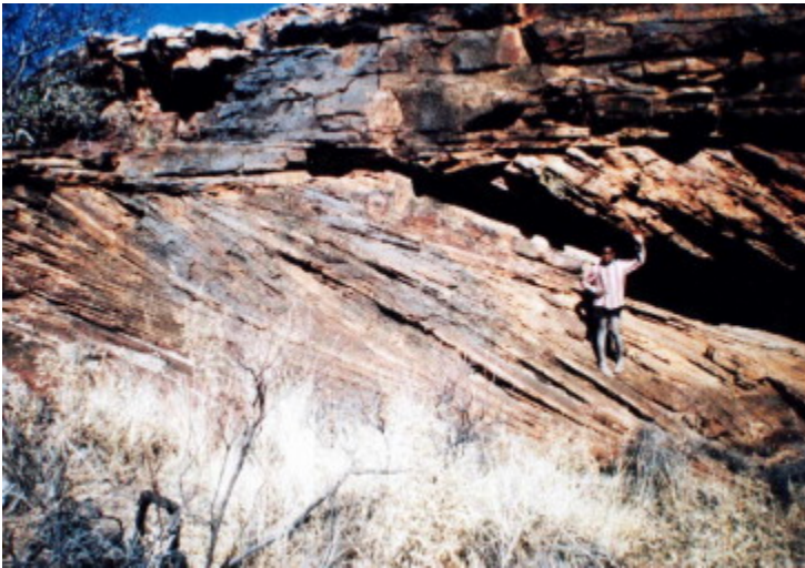
Fig. 3. Several sets of large scale aeolian cross-bedding within the c. 1.8 Ga Makgabeng Formation, Waterberg Group, South Africa. These occur within one of several ergs developed on Earth at this approximate time period in the earliest deserts. Child for scale.

Following formation of supercontinent “Laurentia” at c. 2.0–1.7 Ga and an approximately coeval “southern” (in modern reference frame) equivalent by c. 1.8 Ga, large land masses enabled erg formation (Fig. 3) for the first time, on many of the preserved cratons (e.g., [Eriksson and Simpson, 1998], [Eriksson et al., 2000], [Simpson et al., 2004a] and [Simpson et al., 2004b]). Concomitantly, red beds sensu stricto became common in many successions (e.g., Eriksson and Cheney, 1992), indicating the unequivocal presence of free oxygen in the atmosphere by that time. As the Palaeoproterozoic ended, the supercontinental cycle had become well developed, and with it the sedimentary systems that accompany the Wilson cycle (e.g., [Hoffman, 1989], [Barley and Groves, 1992] and [Windley, 1995]). With the addition of deserts from about c. 1.8 Ga globally, all the principle sedimentary systems and environments were present on Earth, with the apparent exception of glaciation, which remained strongly episodic (Eriksson et al., 2005).