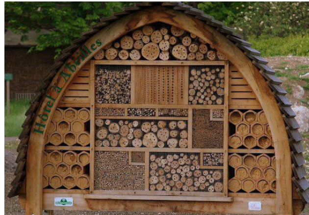
6.7_ Insect hotels created for insects to populate and create habitats