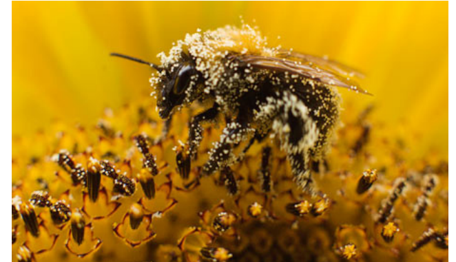
6.1_ Bee collecting pollen from a sunflower; Photograph by Michael Kooren ( http://www.theguardian.com/environment/2013/feb/28/wild-bees-pollinators-crop-yields )

Pollination is one of the most significant services provided by insects in nature. It is a requirement for the seed and fruit generation that produces more than 35% of our daily food for consumption (Holzschuh, et al, 2012: 101). It is the continuous flow of pollen grains from the anthers to the stigma (male to female) that occurs when insect or animals forage for food. In the process of foraging they are instrumental to this flow of pollen grains and therefore provide a free service on which we are dependent (Mayes, 2013: 5). The destruction of these organisms affects our health regarding nutrition and food security.