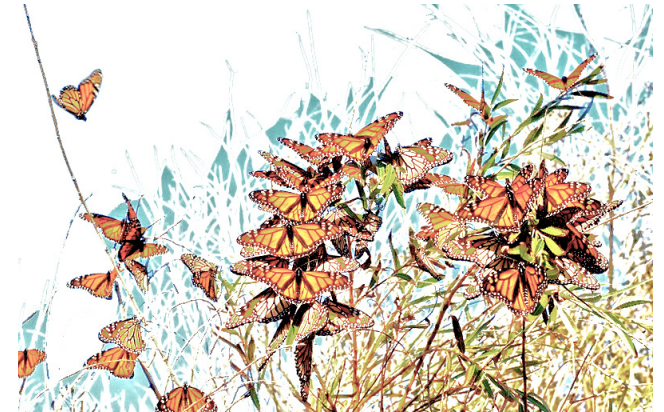
6.5_ Monarch butterflies gathering between branches ( https://goodmorninggloucester.files.wordpress.com/2013/09/monarch-butterflies-daybreak-willow-tree-c2a9kim-smith-2012.jpg ) edited by (Author, 2015)