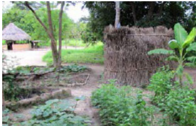
6.4_ Example of a diver's garden that serves as a food source, (Mayes, 2013: 13)