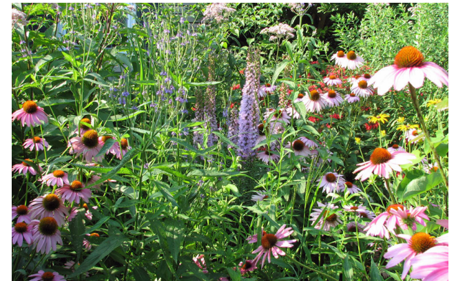
6.2_ Variety of colorful flowers is main source of pollinator nutrition ( http://www.ourhabitatgarden.org/creatures/c-images/nectar-plants-large.jpg )