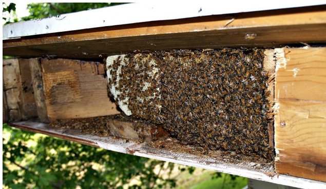
6.6_ Bees creating their hive inside a man made structure ( http://s3-wp.lyleprintingandp.netdna-cdn.com/wp-content/uploads/2014/11/14110005/bees1.jpg )

When trapping bees, create an elevated decoy hive that is safe from vermin and vandals. Corrugated plastic and wax treated cardboard can be used in hive construction.