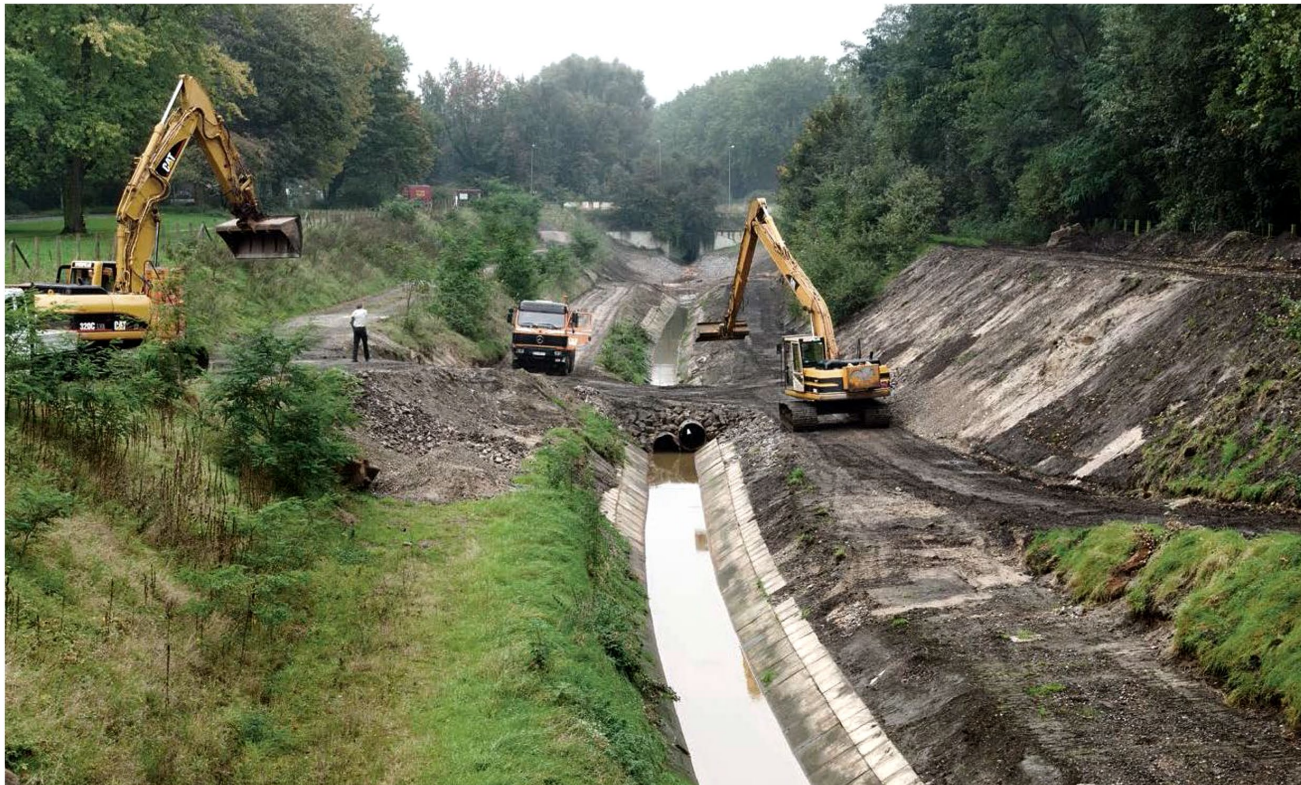
Figure 2.1: Water Infrastructure being implemented on the Kleine Emscher in Duisburg (Wuppertal 2013) Image edited by author