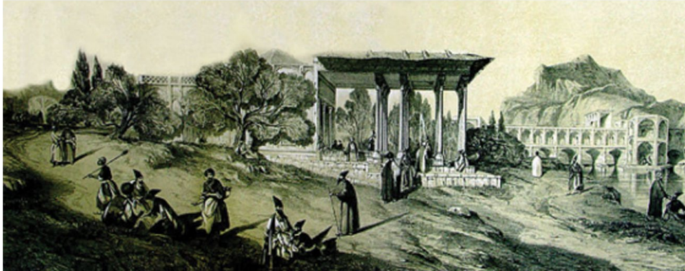
Figure 2.2 "Artist's interpretation of Safavid-era Isfahan, typically described as the pinnacle of garden cities interspersed with harmoniously-designed pavilions and spacious thoroughfares" (AJAM Media Collective 2012)