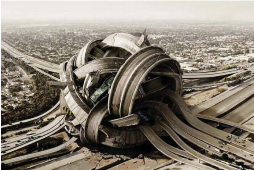
Figure 2.3 A graphic illustration for the invitation of the Winter 2011, University of Michigan Taubman College, The Raoul Wallenberg Competition Studios. The competition studio aimed to investigate "... ways of redefining the highway's relationship to the city, the studio will explore possibilities of transforming the often undifferentiated and mono-functional network into a performative and productive urban system, which utilizes their potentials as the "spatial" infrastructure beyond its original utilities of mobility and conveyance." (Hwang & Moon 2011)