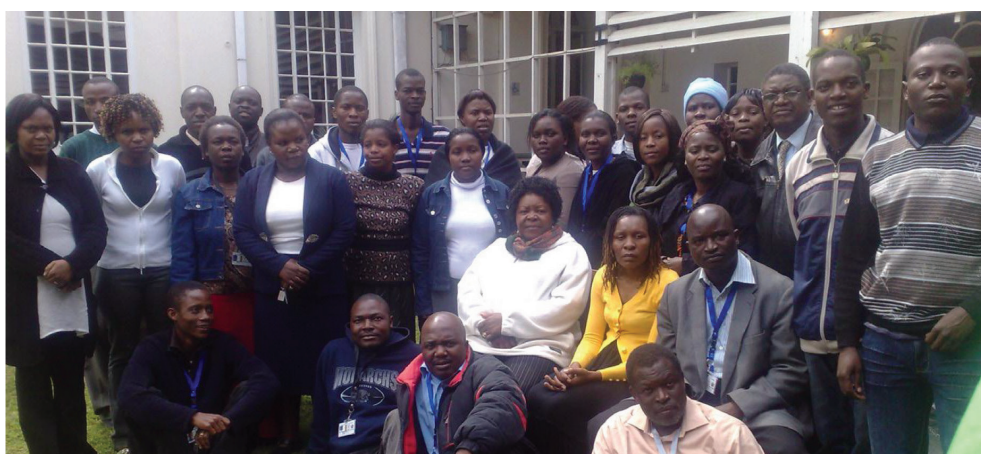
Figure 3: Participants at the Parliament of Zimbabwe IL training (2010)

parliamentary information. The study data showed that in 2010, INASP sponsored information literacy (IL) training workshops to improve access to and effective utilisation of the information resources in the PoZ. Seventy-eight officers of parliament (see Figure 3) participated in the training. The principal aim was to raise participants' awareness and to equip them with skills to locate, understand, evaluate, utilise and convey information. Participants obtained hands-on skills to effectively search for information, manipulate online tools and other associated applications to improve access to, and effective use of, the kinds of information needed to support evidence-based policy-making in Parliament. The training was expected to cascade to MPs, and INASP expressed a willingness to sponsor the training of MPs in future, with a focus on strengthening democracy.