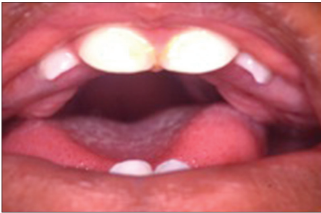
Figure 5: Posttransection mandibular catch-up growth