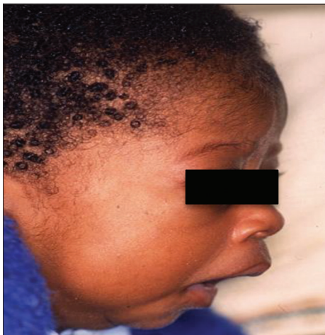
Figure 3: Preoperative lateral facial profile