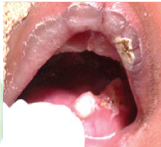
Figure 8: Immediate posttransection of the synechial band