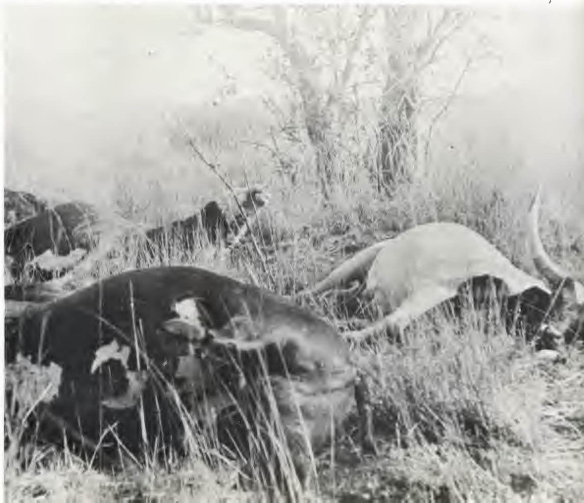
Corpses of oxen which lay in thousands on the roads to Rhodesia and elsewhere from 1896 onward photographed by Theiler on his epic journey to and from Buluwayo.