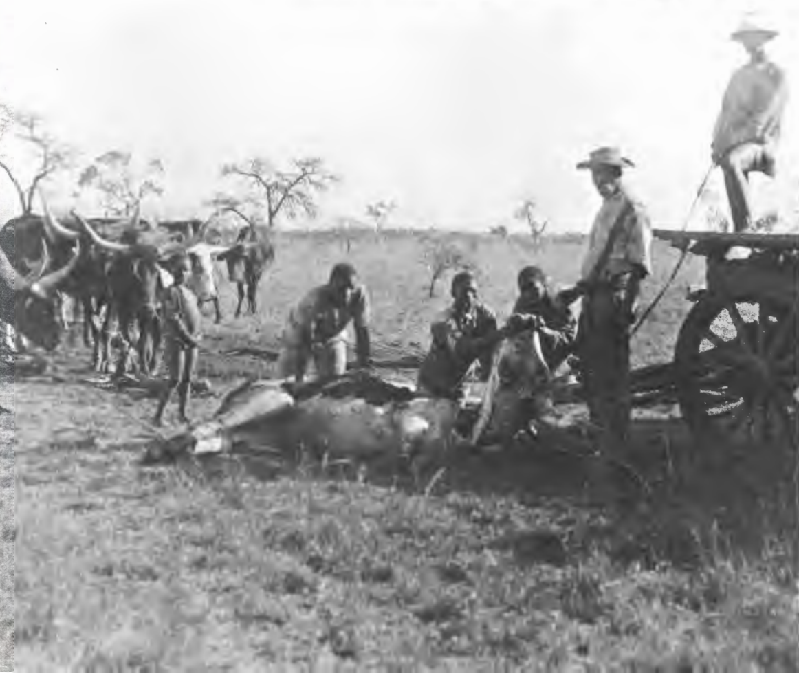
Oxen dead in their traces photographed by Theiler when studying supposed 'cures' for Rinderpest.