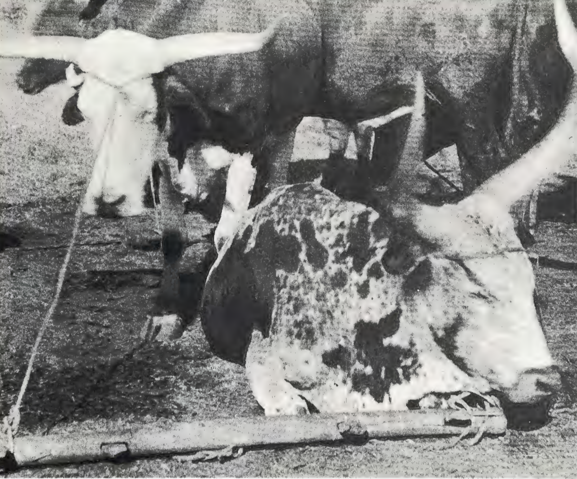
Dying oxen , rapidly struck down by Rinderpest, photographed by Theiler when investigating the disease.