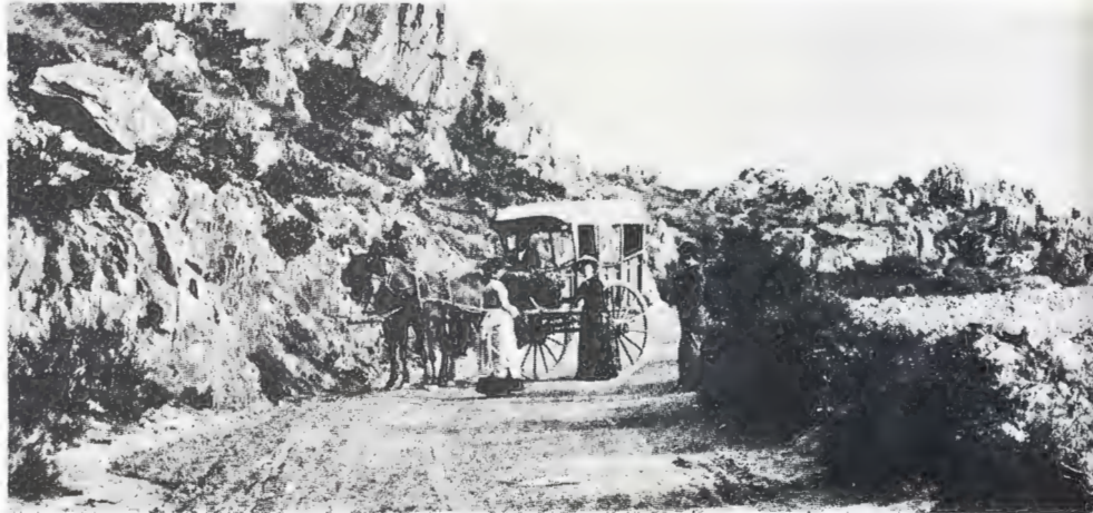
The importance of the ox as a draught animal and in other ways including postal delivery by 'post-cart' in Bechuanaland shown here.