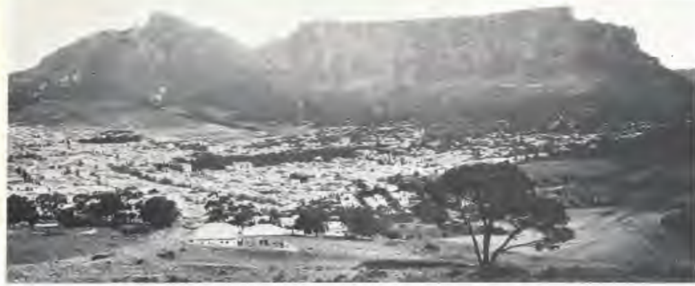
Cape Town and Table Mountain as Theiler first saw them when he landed in 1891.