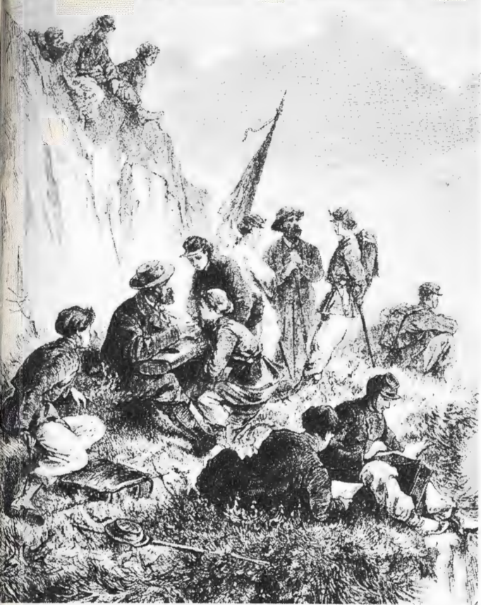
A botanical excursion in the Swiss Alps around 1880 of the kind that the young Arnold Theiler joined.