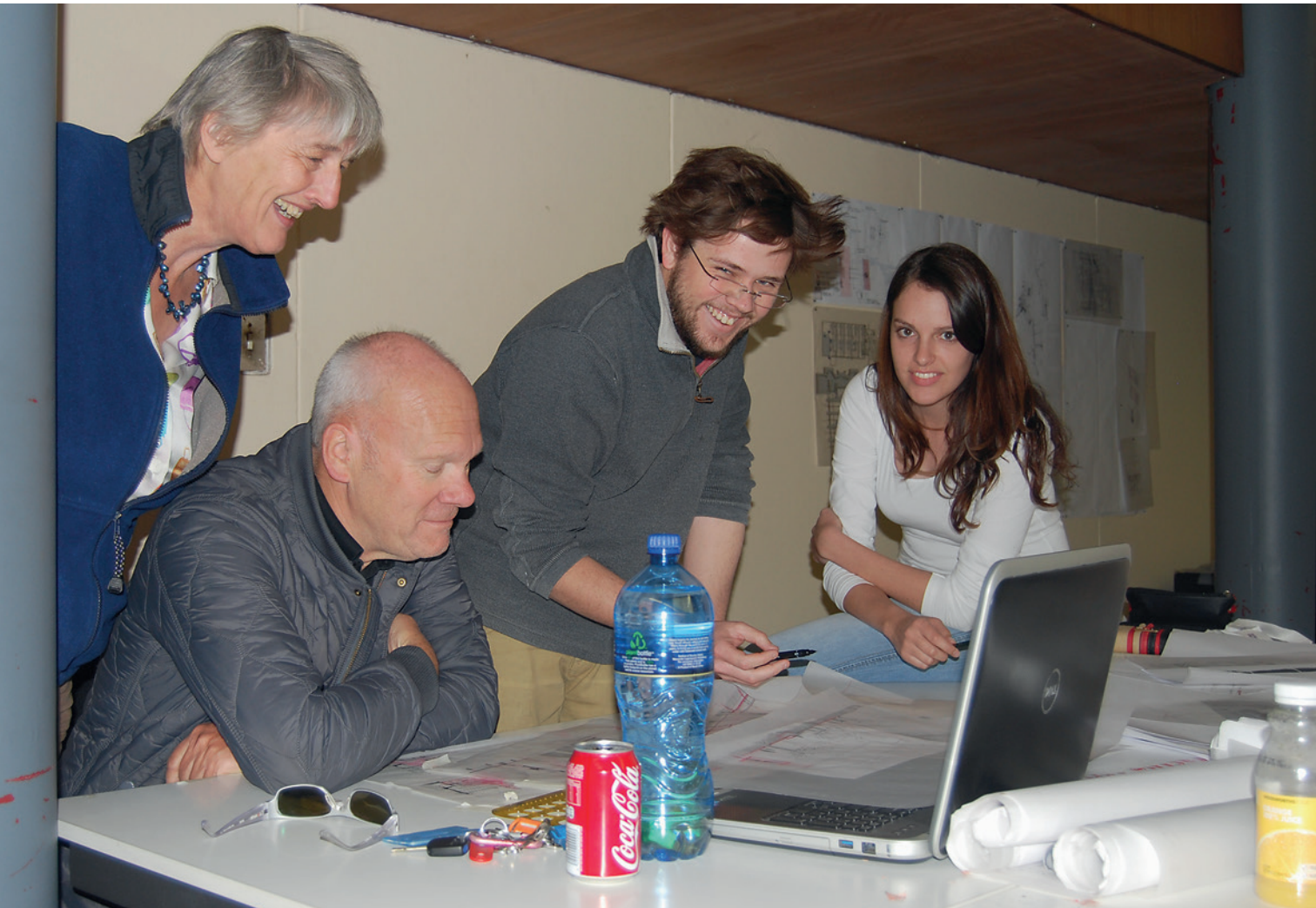
Learning from the experts. Studio engagement is not a one-way system but relies on listening and debate among equals. (Johan Swart)