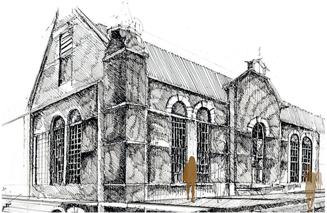
Sketch with proposed intervention. Old Government Printing Works. (Arthur Lehloeny)

of heritage places and make them accessible and valuable to all citizens. The second theme, that of ownership, is linked to the first with the assumption that inclusive development and healthy communities are not achieved by architecture alone. Successful interventions are created by developing strategies that consider ownership and management of spaces, and by proposing interventions that address the complicated network of stakeholders surrounding urban heritage places. Lastly, the fact that all of this will undoubtedly imply changes to fabric, necessitates an understanding of the tolerance for change of sites and buildings, an understanding that requires detailed architectural and historic investigation.