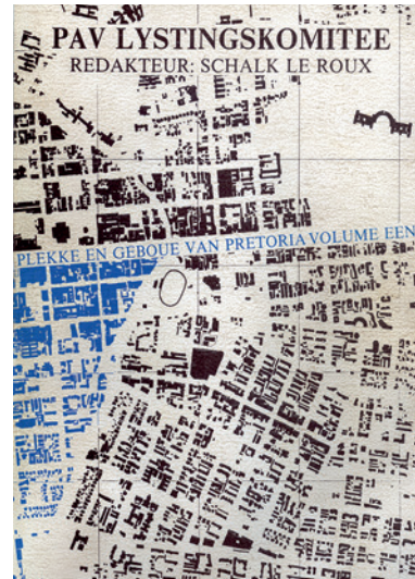
Plekke en Geboue van Pretoria published in three volumes between 1990 and 1993, remains the most comprehensive survey of Tshwane's built heritage.