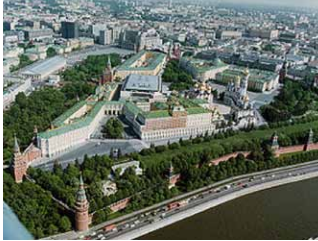
Figure 10 Areal view of the Kremlin, Moscow (source: public domain internet).

The Russian Orthodox cathedral erected on the Red Square in 1555-61 by order of Ivan IV to commemorate the capture of Kazan and Astrakhan, called St. Basil's Cathedral, or the Cathedral of the Protection of the Most Holy Theotokos on the Moat, is built over the grave of a venerated local saint, Vasily (Basil), and is considered to be the ultimate Russian architectural icon (figure 11). It marks the geometric centre of the city and was the tallest building in Moscow until the completion of Ivan the Great Bell Tower in 1600. St. Basil's design is flamelike and consists of a montage of coloured onion-shaped domes, cupolas, arches, towers and spires. Since it stands adjacent to the Kremlin, it was completely secularised during the Soviet Union, but has an ambivalent existence the present Russian Federation.