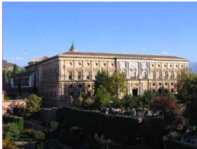
Figure 6 Pedro Machuca, exterior view of the palace of Emperor Charles V, Alhambra, Granada, Spain.