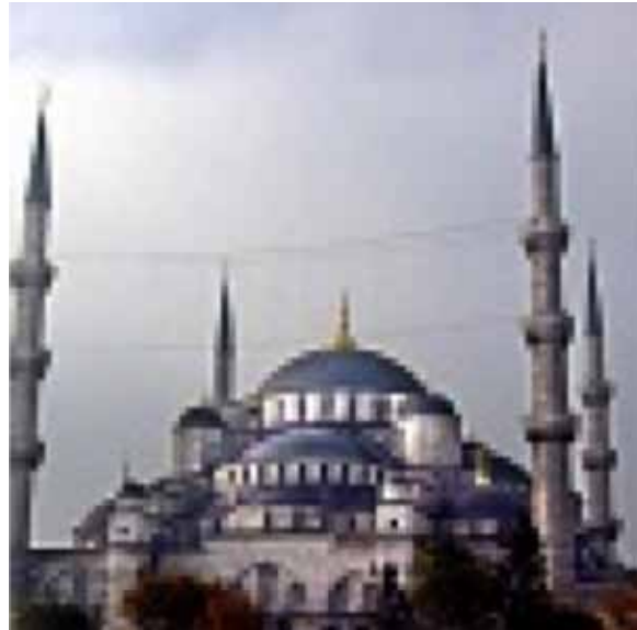
Figure 9 The Sultan Ahmed Mosque, Istanbul.

On the Sultanahmet Square the two monumental structures – the basilica and the mosque – face each other, albeit with some distance between them. Since the Hagia Sophia was turned into a hybrid with minarets added, the Blue Mosque appears to be the more imposing structure, but, notwithstanding the fact that both are single domed structures, their coexistence is that of a pair of rivals and unfortunate.