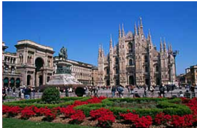
Figure 20 The Piazza del Duomo, Milan, showing the Galleria Emanuele II adjacent to the Cathedral Santa Maria Nascente.

The Duomo is the most venerable Gothic cathedral in Italy, dedicated to Santa Maria Nascente, and serving as the seat of the Archbishop of Milan. This edifice took five centuries to build: the groundbreaking took place in 1386 and the structure was completed in 1965. In front of it originated the most central and historical site in the city, the Piazza del Duomo, established in 1330 by Azzone Visconti for mercantile purposes. Its urban importance is revealed in Milan's layout, with streets either radiating from or circling the square. In 1936 another prominent structure on the square, adjacent to the cathedral, was inaugurated by Vittorio Emanuele II, who set the foundations of the Galleria, named after him, and later honoured with an equestrian statue placed in the centre of the square (figure 20).