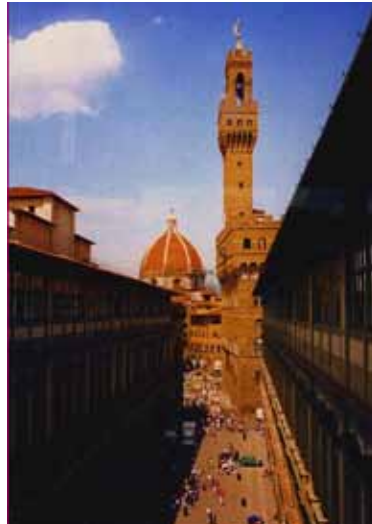
Figure 25 Giorgio Vasari, Galleria degli Uffizi, Florence.