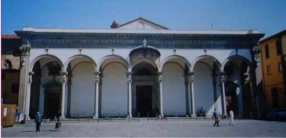
Figure 23 Antonio Sangallo and Baccio d'Agnolo, Loggia dei Servi di Maria, Piazza della Santissima Annunziata, Florence.