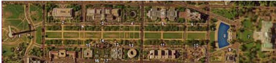
Figure 14 Pierre Charles L'Enfant, layout of the National Mall, Washington DC , USA.

The National Mall is an open-area national park in downtown Washington DC, comprising a unit of the national park service (figure 14). It connects the entire area between the Lincoln Memorial and the United States Capitol, with the Washington Monument providing a division slightly west of the centre. This remarkable urban open space receives about 24 million visitors annually.