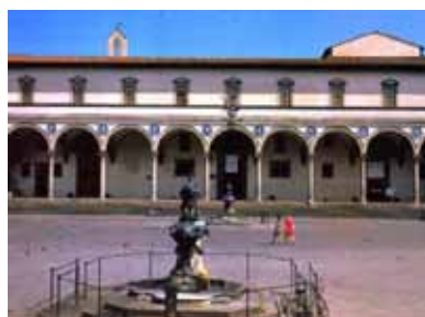
Figure 22 Filipo Brunelleschi, Spedale degli Innocenti, Piazza della Santissima Annunziata, Florence (source: public domain internet).

Antonio da Sangallo il Vecchio (1456-1534) and Baccio d’Agnolo (1462-1543) were the second architects on the site. They designed the Loggia dei Servi di Maria on the Piazza della Santissima Annunziata in 1518, following the model of the arcaded portico of the Spedale degli Innocenti by Filippo Brunelleschi (1377-1446) (figure 22). The portico of the new building was made consistent with that of the Spedale. The later development of the Piazza followed the arcaded motif, giving it its enduring perceptual unity as an architectural group design (figure 24).