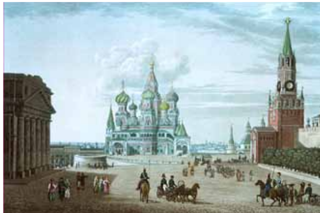
Figure 11 St. Basil's Cathedral, Red Square, Moscow, depicted in 1823.

The Russian Orthodox cathedral erected on the Red Square in 1555-61 by order of Ivan IV to commemorate the capture of Kazan and Astrakhan, called St. Basil's Cathedral, or the Cathedral of the Protection of the Most Holy Theotokos on the Moat, is built over the grave of a venerated local saint, Vasily (Basil), and is considered to be the ultimate Russian architectural icon (figure 11). It marks the geometric centre of the city and was the tallest building in Moscow until the completion of Ivan the Great Bell Tower in 1600. St. Basil's design is flamelike and consists of a montage of coloured onion-shaped domes, cupolas, arches, towers and spires. Since it stands adjacent to the Kremlin, it was completely secularised during the Soviet Union, but has an ambivalent existence the present Russian Federation.