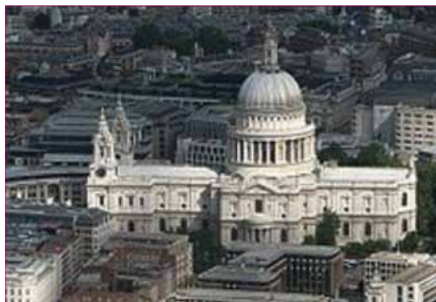
Figure 13 Sir Christopher Wren, St. Paul's Cathedral, London, in its present environment.

St. Paul's Cathedral retains the status of one of London's most impressive buildings. However, during the twentieth century London's architects and urban planners have not been kind to the magnificence of Wren's masterpiece by closely surrounding it with nondescript modern buildings. While real estate in London is at a premium, the grandeur of the cathedral is diminished by its present bland context (figure 13).