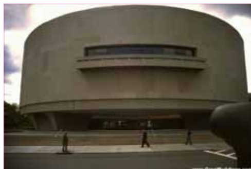
Figure 15 Gordon Bunshaft, Hirshhorn Museum, National Mall, Washington DC.

The history of the Mall is important. In 1791 Pierre Charles L'Enfant envisioned a garden-lined grand avenue, approximately 2,6 kilometres in length and 400 metres wide, in an area that would lie between the Capitol and an equestrian statue of George Washington to be placed directly south of the White House. It is designed as a showcase of the nation's history and culture, by including museums and historical memorials. The Vietnam Memorial is a recent addition. Unfortunately the art and history museums added adjacent to the Mall in the twentieth century do not enhance its prestige. Especially the Smithsonian Castle, the stark National Air and Space Museum and the Hirshhorn Museum by Gordon Bunshaft (1909-90) are unpleasing additions to the grand avenue with its stately focus on the Capitol (figure 15).