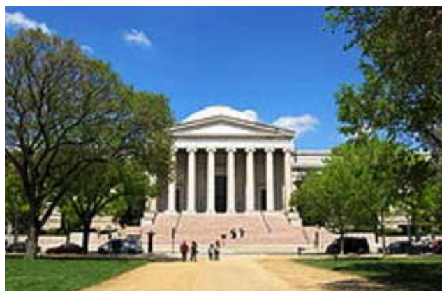
Figure 30 John Russel Pope, National Gallery of Art, Washington DC.

Financier Andrew W. Mellon began gathering a private collection of old master paintings and sculptures during the First World War, but by the late 1920s he decided to direct his collecting efforts, secretly, towards the establishment of a new national gallery for the United States. Designed by architect John Russel Pope (1874-1937) in a neo-Classical style, the new gallery in Washington DC was accepted by President Franklin D. Roosevelt on behalf of the American people (figure 30).