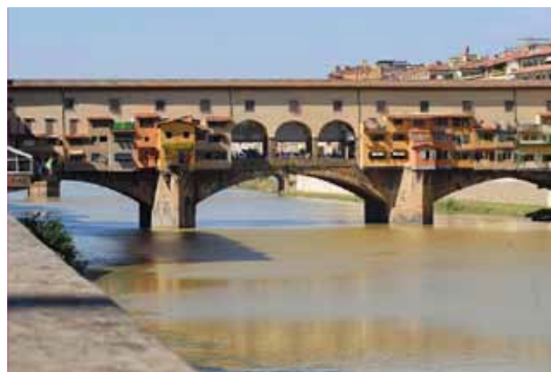
Figure 26 Giorgio Vasari, Corridoro Vasariano, Florence.

The tall, high-level corridor was added to the elevation of the bridge in a remarkably harmonious way, simply demarcated with evenly spaced rectangular openings, in a plastered wall that forms an extension of that of the covered bridge.