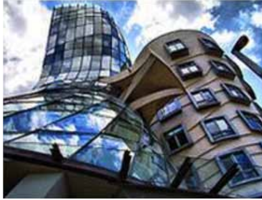
Figure 34 Ginger Milunić and Frank Gehry, Dancing House, Prague.