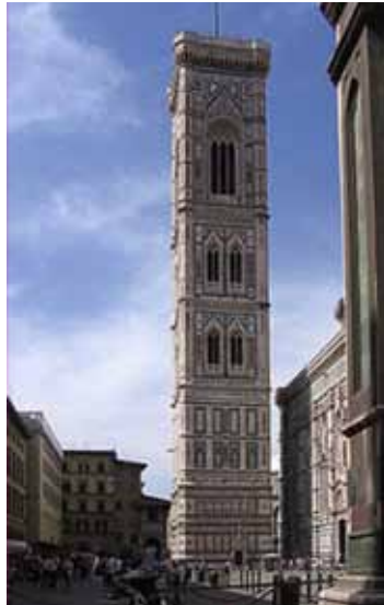
Figure 21 Giotto di Bondone, campanile of Florence Cathedral.

As a later addition to the Piazza del Duomo the geometrical exactitude of the campanile design gives no offence to the Basilica of Santa Maria del Fiore and the Baptistry of St. John, but establishes itself as a complementary entity blending with its historical counterparts.