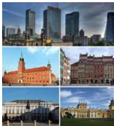
Figure 32 Cityscapes of Warsaw.

Warsaw, the capital city of Poland, faces the same dilemma as Graz. (endnote: 4) Established at the turn of the thirteenth century Warsaw is presently the ninth most populous city in the European Union. It is widely known as the “phoenix city”, as it recovered from extensive damage during the Second World War during which eighty percent of its buildings were destroyed. Its present mixture of architectural styles reflects the turbulent history of the city and country. After the war most of the historical buildings were reconstructed, while some more or less intact nineteenth century buildings, for example the Leopold Kronenberg Palace were demolished in the 1950s to erect communist style residential blocks. Warsaw’s current urban landscape is one of modern and contemporary architecture (figure 32).