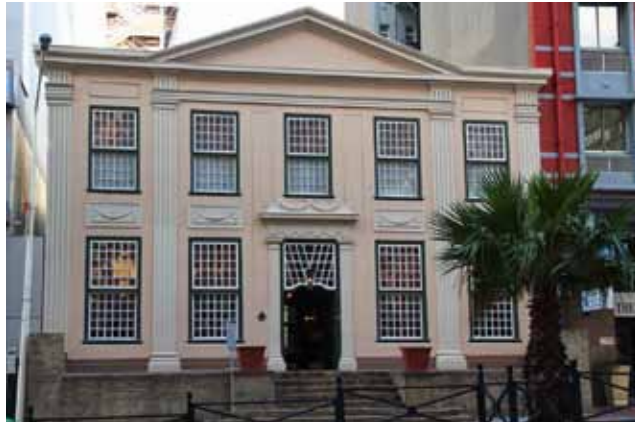
Figure 17 Louis Thibault, Koopmans de Wet House, Cape Town.