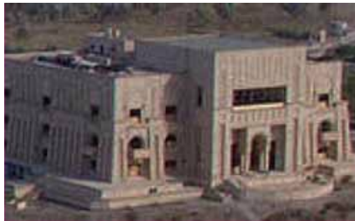
Figure 1 Saddam Hussein's palace built on the ruins of King Nebuchadnezzar II's Palace, Irak.

In 1982 Saddam began reconstructing Babylon's most imposing historical building, the 600-room palace of the Babylonian king. Adjacent to the ruins of Nebuchadnezzar's palace that overlooked the Euphrates River, Saddam built his own palace, shaped like a ziggurat, surrounded by palm trees and rose gardens (figure 1). By building on top of ancient artefacts Saddam disfigured history. The four story palace extends across an area of five football fields that disrupted the dwellings of some thousand people. Saddam's workers laid more than 60 million sand-coloured bricks inscribed with the words, "In the era of Saddam Hussein, protector of Iraq, who rebuilt civilization and rebuilt Babylon", which began to crack after only ten years. This edifice was not merely mere conceived on a large scale, but as ostentatious. Consequently, it was enormously wasteful and costly in a poverty-stricken country.