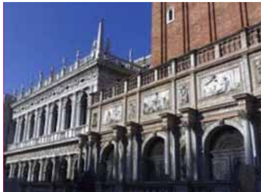
Figure 27 Jacopo Sansovino, Logetta and Biblioteca Marciana, Venice.

While Sansovino undertook large projects around the piazzetta of St Mark's Square he created a need for improvements in the surrounding structures. By adjusting the angle of the stalls around the campanile to construct the library he freed the campanile from the wall and joined the piazza and piazzetta together, and by making the tower stand individually Sansovino placed considerable more emphasis on the bell tower and its small loggia. Not only drawing attention to it spatially, the marked improvements of the surrounding structures made the existing loggia seem drab. Acknowledging the new grandeur surrounding it, the Procurata de Supra commissioned a replacement sometime before 1537, Sansovino as the chief architect led the project for the new loggia to its completion in the mid 1540s. A relatively small structure the new loggia's exterior not only enhances the piazzetta, but also the grandeur of the campanile (figure 27).