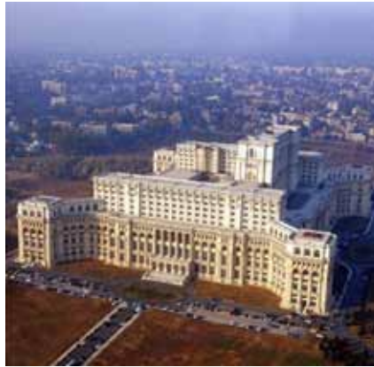
Figure 33 Anca Petrescu, Palace of the Parliament, Bucharest, Republic of Romania.

European city with a venerable architectural history, (endnote: 5) one of the ugliest buildings in Europe, if not on the planet, took shape after June 1980 (figure 33). According to the Guinness Book of Records the twelve story high palace with 1,100 rooms, is the largest, most expensive civilian administrative building on the planet, and also the heaviest. Its ground plan measures 270m x 240m; it is 86m high and its basement is sunk 92m underground.