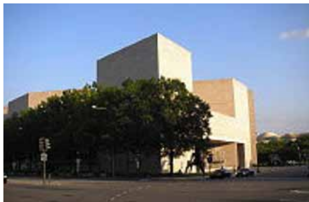
Figure 31 I.M. Pei, East Building of the National Gallery of Art, Washington DC.

In 1978 the gallery was extended by the addition of the East Building, designed by architect I.M. Pei, which received a National Honour Award from the American Institute of Architects in 1981 (figure 31). The modern extension, linked by means of a passageway to the existing gallery, allows it to retain its individuality. Thus the West and East buildings co-exist as architectural exemplars of their times.