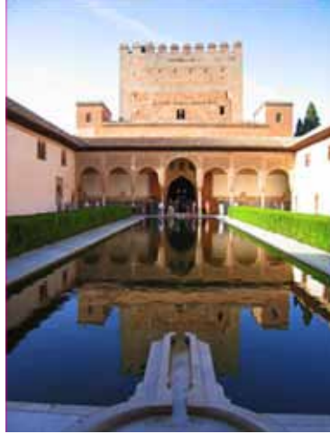
Figure 5 Detail of an Alhambra courtyard, Granada.

Italian Renaissance palace combination of rustication at the lower level and ashlar on the upper. Mashuca's design is reminiscent of the Italian Mannerist style that became popular in Italy at the time, but without following any prototype he created an avant-garde building, unique in sixteenth-century architecture (figures 6 and 7).