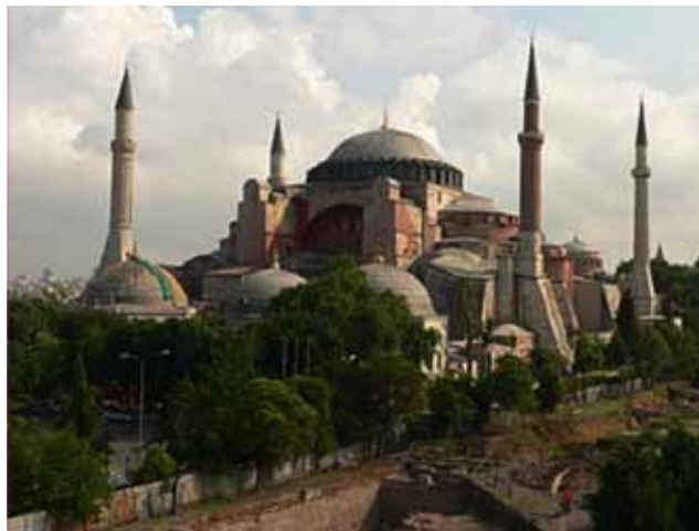
Figure 8 The Hagia Sophia, Istanbul.

The Hagia Sophia (From the Greek meaning “Holy Wisdom”) is a former Orthodox patriarchal basilica in Constantinople. At the orders of the Byzantine Emperor Justinian it was designed by Isodore of Miletus (a physicist) and Anthemius of Tralles (a mathematician), and built in about six years from 532-37. As an architectural construction it is famous for its massive dome that epitomises Byzantine architecture, and was the largest cathedral in the world for nearly a thousand years (figure 8). After Constantinople was conquered by Muslims the city was renamed Istanbul and the basilica was converted into a mosque. Later President Atatürk converted it into a museum.