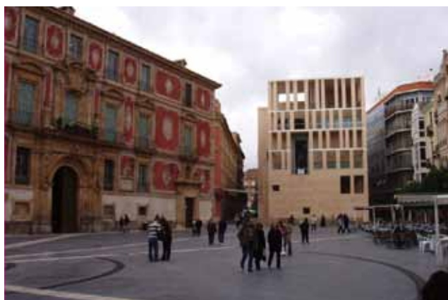
Figure 18 Rafael Moneo, Town Hall, Cathedral Square, Murcia, Spain.

Rafael Moneo (born 1937), the Spanish architect who won the Pritzker Architecture Prize in 1966, made the following statement in 1978: “The architectural object can no longer be considered as a single, isolated event because it is bounded by the world that surrounds it as well as by history. It extends its life to other objects by virtue of its specific architectural condition” (Moneo 1978: 44). It therefore came as a shock to the citizens of Murcia in Spain when he designed their new town hall in 1998, in the form a stark, rectangular concrete box with an irregular gridlike facade, but without an alluring entrance, centrally on the Cathedral Square, adjacent to the Baroque cathedral (figure 18). Also in Ávila, the ancient Medieval city, Moneo aroused the anger of the citizens by designing a bland, modern building on the Plaza de Santa Teresa, in close proximity to the Iglesia románica de San Pedro (dating from the twelfth century), and the city’s medieval walls that are classified as UNESCO Patrimonio de la Humanidad.