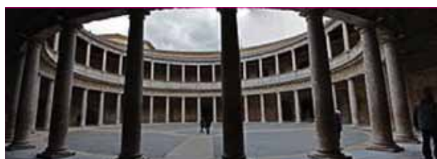
Figure 7 Pedro Machuca, courtyard of the palace of Emperor Charles V, Alhambra, Granada, Spain (source: public domain internet).