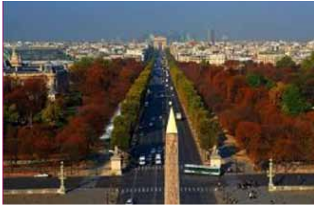
Figure 28 The Avenue des Champs-Élysées, Paris, showing the length of the street from the obelisk of Luxor to the Arc de Triomphe.