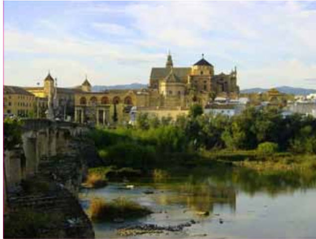
Figure 4 The Great Mosque of Córdoba and the plateresque cathedral inserted into its centre.

After the Spanish Reconquista, when Córdoba was captured by King Ferdinand III of Castile in 1236, spaces in the mosque were converted into chapels without much damage, but later a large plateresque cathedral was inserted into the centre of the Moorish building, causing major damage to the mosque (figure 3). The insertion of the cathedral into the mosque was done by permission of Charles V, king of Castile and Aragon – a gesture he regretted when he saw the destruction it had caused to the mosque.