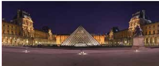
Figure 16 I.M. Pei, Louvre Pyramid, Paris (source: public domain internet).

In the late twentieth century the Louvre required a new entrance above an underground lobby. Commissioned by the then President of France, François Mitterrand, in 1984, the contract was given to architect I.M. Pei (born 1917) who designed what became known as the Pyramide du Louvre (Louvre Pyramid). Situated in the main courtyard (Cour Napoléon) of the Louvre Palace this large glass pyramid, supported by a metal frame, is surrounded by three smaller pyramids. It reaches a height of 20,6 metres, its square base has sides of 35 metres and consists of 603 rhombus-shaped and 70 triangular glass segments (figure 16).