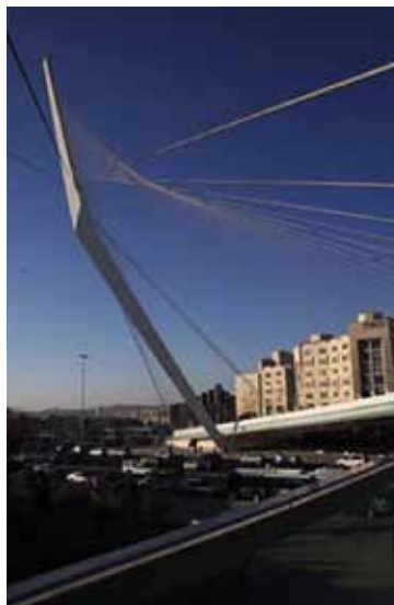
Figure 35 Santiago Calatrava, Chords Bridge, Jerusalem.

The Gesher Hameitarim Bridge in Jerusalem, commonly called the Chords Bridge, was designed by the Spanish engineer, Santiago Calatrava (born 1951) and completed in 2008 (figure 35). It is a cable-stayed light rail bridge at the entrance to Jerusalem, situated at the traffic intersection of Shazar Street and Herzl Boulevard, and used by trams running to and from outlying Jerusalem neighbourhoods and by pedestrians who cross from Kiryat Moshe to the Jerusalem Central Bus Station. The bridge which spans a total length of 360 metres is constructed of reinforced concrete, Mitzpe yellowish limestone for the abutments, with basalt cobblestone paving, and glass and stainless steel for the walkway. It is 14,82 metres wide, the pylon is 118 metres high, and the longest suspended span of 160 metres has a clearance of 5,5 metres.