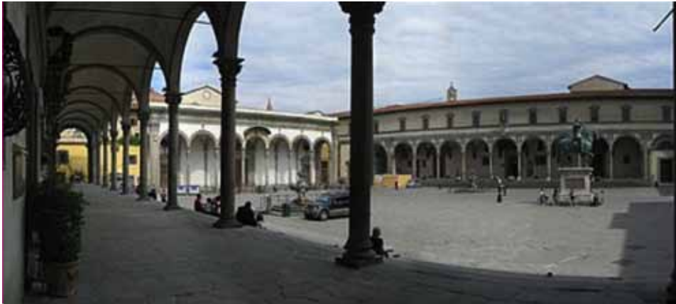
Figure 24 View of the Piazza della Santissima Annunziata, Florence.