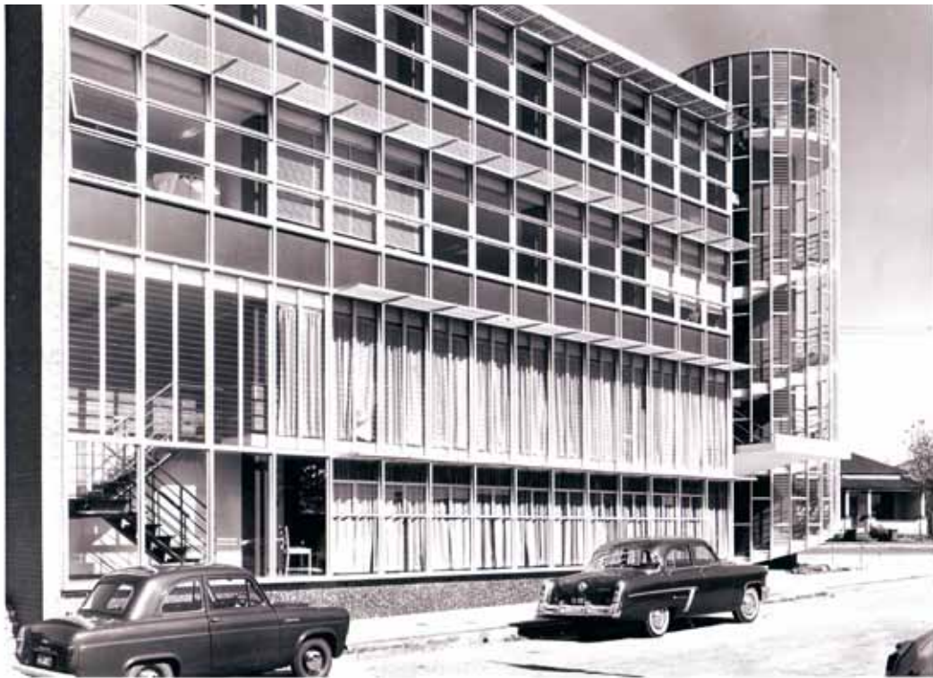
Figure 11 Roodepoort Branch