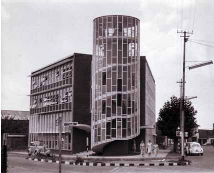
Figure 8 Roodepoort Branch, courtesy of Absa Bank Archives.

whole pieces of the city and whose function now is no longer the original one. When one visits a monument of this type...one is struck by multiplicity of different functions that a building of this type can contain over time and how these functions are completely independent of form” (in Hollis 2010: 9).