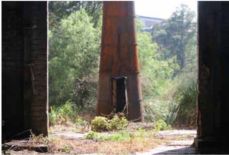
Figure 3 Gasworks Interior, 2011.