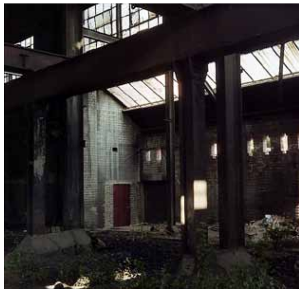
Figure 4 Interior, Gas Works 2011.