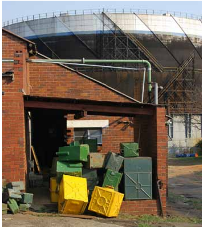
Figure 7 Gas Tank with old gas meters 2011.