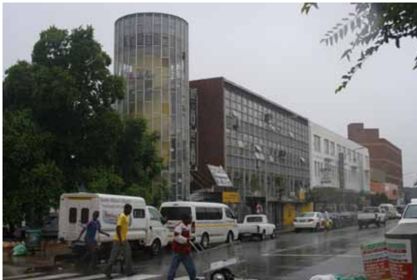
Figure 9 Roodepoort Bank, December 2010.