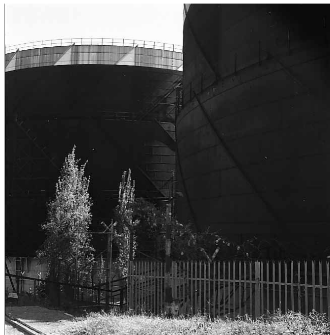
Figure 6 Gas Tanks 2011.

Although mindful of the Becher's pictures of gas tanks, alternatives to their approach had to be sought. The scale of the gas tanks makes them, along with the buildings themselves, a landmark in the area. As JM Richards (1958: 20) remarks, "one of the most important effects aesthetically of the industrial revolution was the introduction into the landscape of structures which had nothing to do with the human scale, but reflected rather, the superhuman nature of the new industrial activities". Consequently, the scale of the structures and the sublime quality of surfaces were a key component of the photography. By placing the camera within relative proximity of the tanks and having it fill the frame, the scale of these structures could be emphasized (see for example, figure 6). In addition, the green and yellow boxes in the foreground of figure 7 are old gas meters, themselves part of a now obsolete technology and economy, whose inclusion in the image was an attempt to make visible this issue. Photography was used, not simply as a tool to illustrate the buildings, but to offer musings on the interplay between architecture and time.