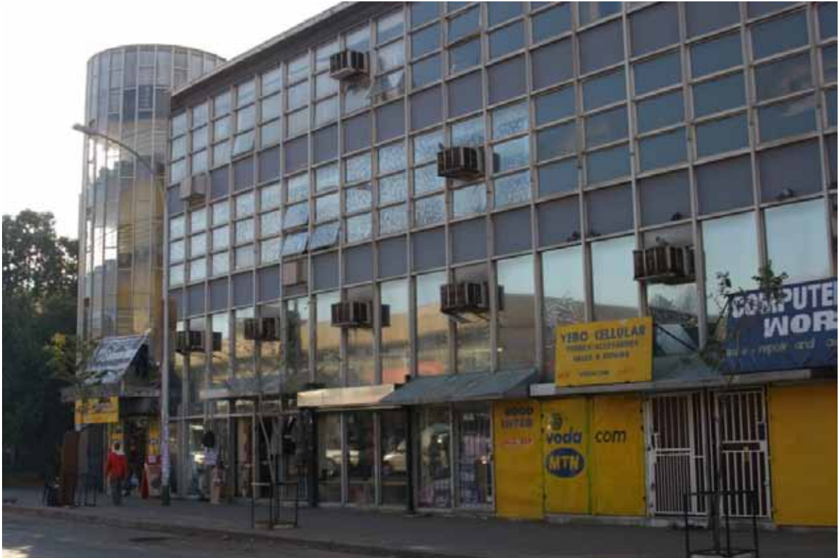
Figure 10 Roodepoort Bank, South Façade, 2011.