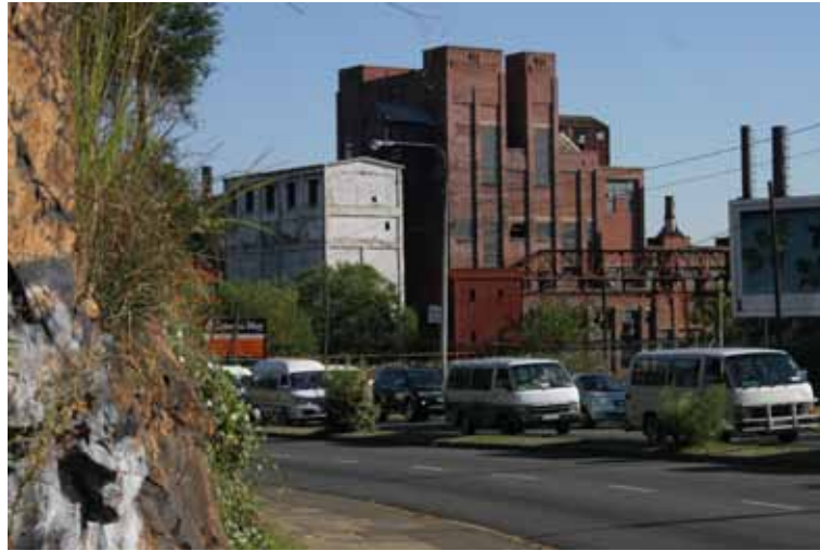
Figure 5 Gas Works from Solomon Street 2011.

Although mindful of the Becher's pictures of gas tanks, alternatives to their approach had to be sought. The scale of the gas tanks makes them, along with the buildings themselves, a landmark in the area. As JM Richards (1958: 20) remarks, "one of the most important effects aesthetically of the industrial revolution was the introduction into the landscape of structures which had nothing to do with the human scale, but reflected rather, the superhuman nature of the new industrial activities". Consequently, the scale of the structures and the sublime quality of surfaces were a key component of the photography. By placing the camera within relative proximity of the tanks and having it fill the frame, the scale of these structures could be emphasized (see for example, figure 6). In addition, the green and yellow boxes in the foreground of figure 7 are old gas meters, themselves part of a now obsolete technology and economy, whose inclusion in the image was an attempt to make visible this issue. Photography was used, not simply as a tool to illustrate the buildings, but to offer musings on the interplay between architecture and time.