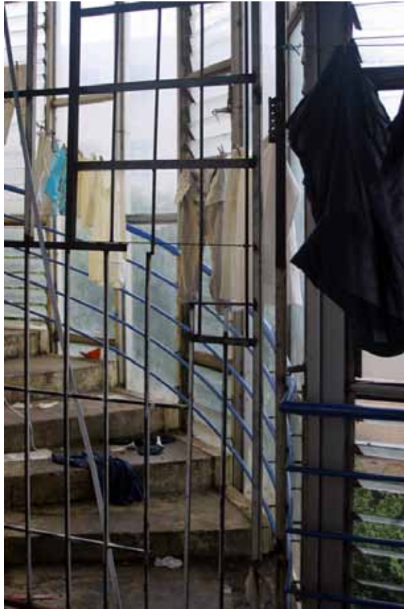
Figure 14 Roodepoort Bank, December 2010.

Even though the Volkskas building is no longer in pristine condition, and may not be valued as an architectural masterpiece by its inhabitants, what is noteworthy is how it has lent itself to being adapted to present circumstances. Although its materials may not have been maintained in the way that the architect envisaged, the design has endured, lending itself to adaptations that bear testimony to the changing needs of its users. Despite the renovations that have taken place, some of the building's original use and function are still evident. The columns in the banking hall permeate the space of the general dealer, a walk-in safe is used to secure valuables, and above all, its modernist aesthetic is a marker of time. In contemporary photographs the opportunity exists to depict an expanded temporal field. The building's past is still clearly visible in the present not as a time capsule, but rather as duration. The photograph is not timeless, but rather 'timefilled' 13 .