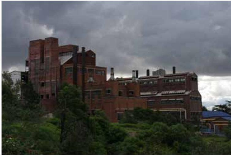
Figure 2 Gas Works 2011.