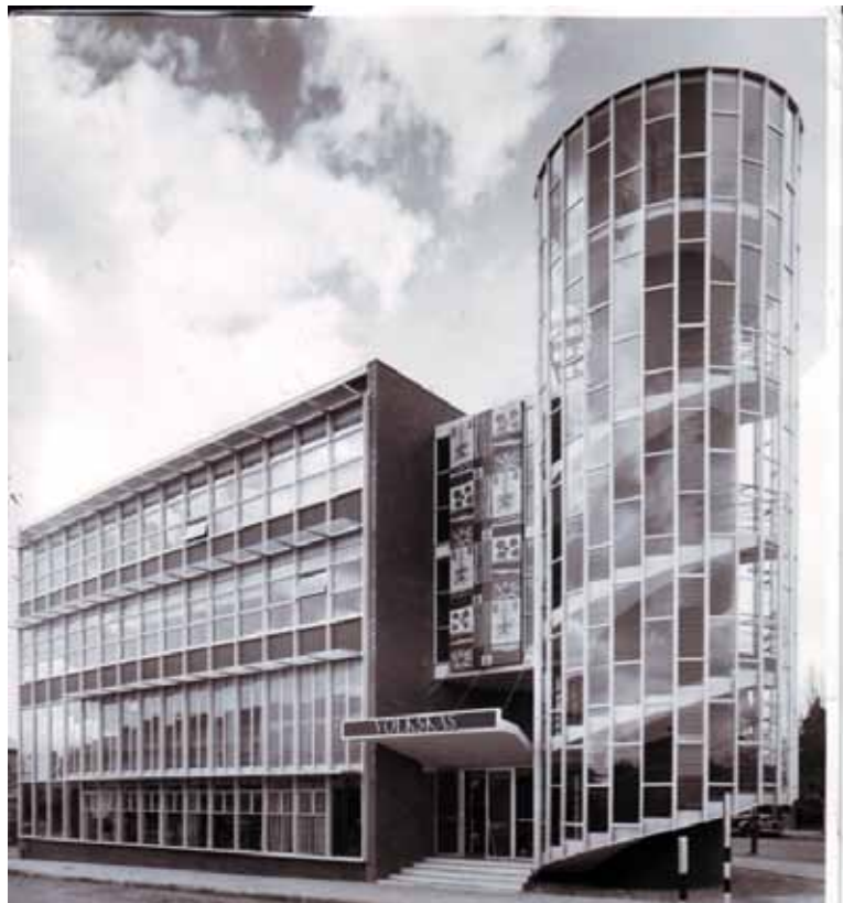
Figure 13 Branch Roodepoort, reproduced with kind permission of Absa Archives.