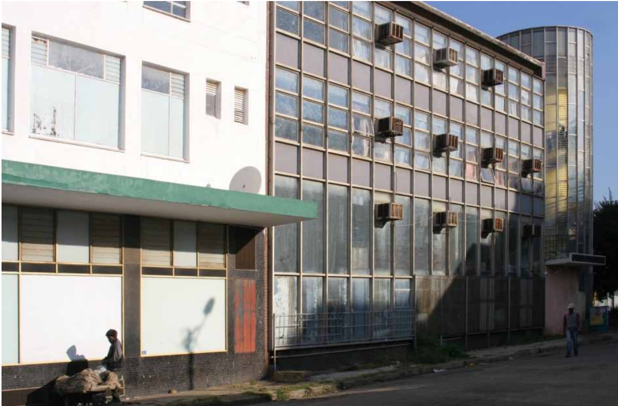
Figure 12 Roodepoort Bank, North Façade, 2011.