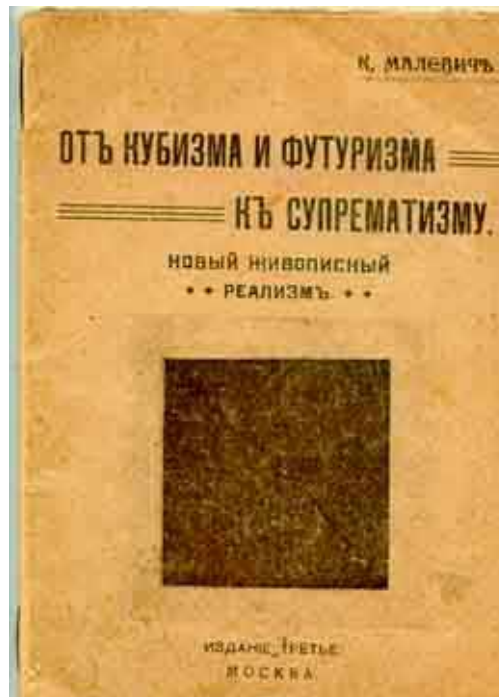
Cover of Malevich's pamphlet-manifesto From Cubism and Futurism to Suprematism: The New Painterly Realism published in Moscow, 1916