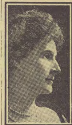
DUCHESS OF DEVONSHIRE.

No celebrations will take place until after the war. Lord Hartington was a page to King George at the Coronation, is an officer in the Derbyshire Yeomanry, and A.D.C. to the General Commanding the Midland Mounted Brigade at the front. He is a very popular member of Society, has one brother and a bunch of pretty sisters, of whom two are already out.