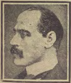
Sir Matthew Nathan, Permanent Under-Secretary for Ireland.