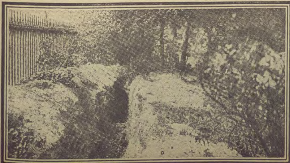
The rebel trenches in St. Stephen's Green had been constructed with soldierly skill.