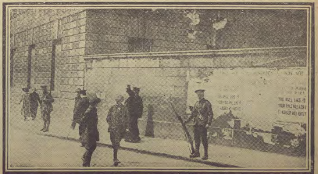
The shell-pocked walls of the historic Four Courts testify to the fierce fighting.