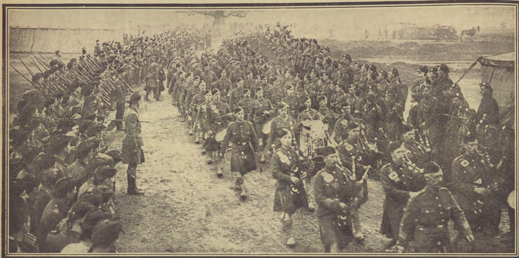
A draft of the London Scottish leaving their quarters for another sphere of active service. Headed by their pipers, playing inspiring airs, the lads of the hoddie grey marched off amid regretful farewells of hosts of pals in camp and friends in billets.

OFF TO HELP THEIR COMRADES AT THE FRONT.