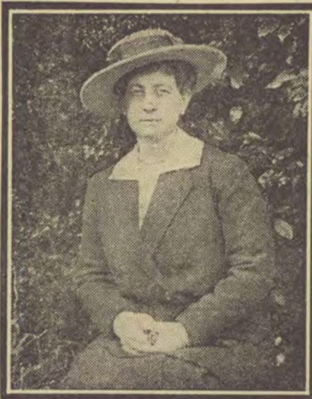
The Grand Duchess George of Russia in the grounds of one of her Harrogate hospitals for our wounded.