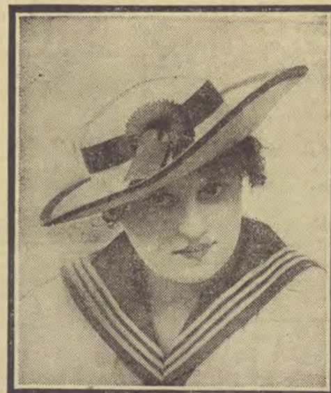
This Parisienne has evidently adapted her little brother's sailor rig-out to her own purposes.