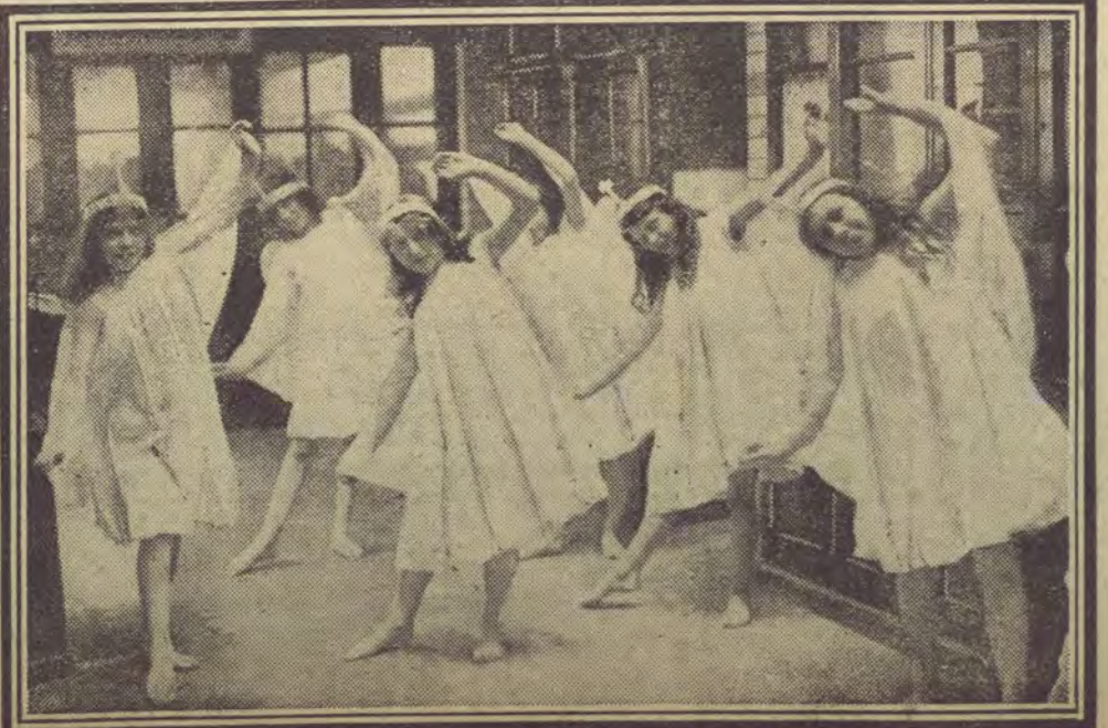
English schoolchildren are everywhere joining in the Shakespeare Tercentenary celebrations. Here is a group of Oberon's fairies at the Hugh Myddelton schools in Clerkenwell.