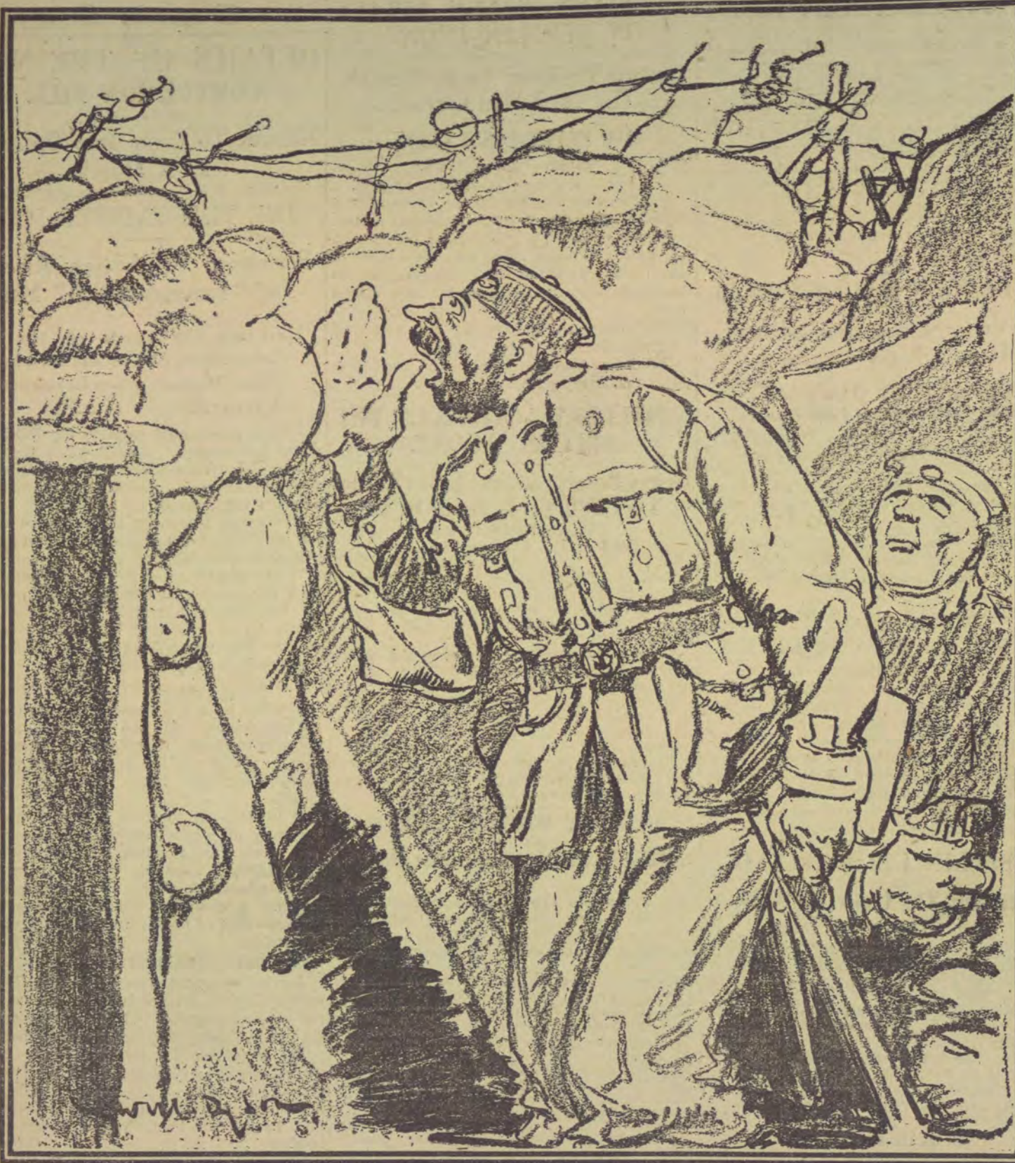
A TRENCH ANSWER TO SINN FEIN.

HUN (to opposite trench): "Vas you de Irish—der English vas our enemies—der Irish vas our frients!" RICH BROGUE FROM OPPOSITE (with feeling): "Friends are we? Then Heaven save you from your friends—we're coming!"