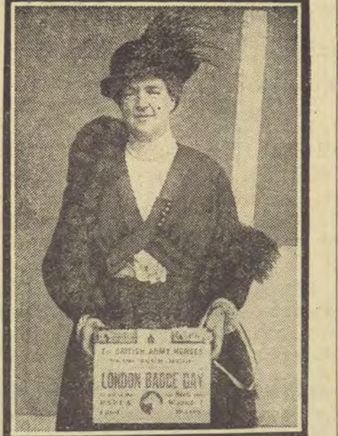
Queen Amelie of Portugal selling flags in London yesterday for the R.S.P.C.A. fund for Army horses.