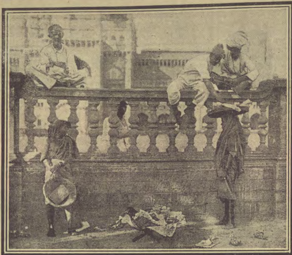
Wounded Indian soldiers, home in India once more, as convalescent inmates of the Lady Hardinge military hospital at Bombay, buy fruit from the women hawkers.