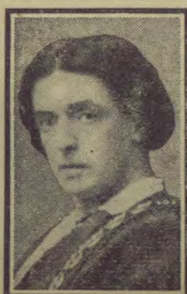
Martin Harvey is appearing as Hamlet next week at His Majesty's.—