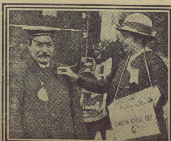
Yesterday was the Horse's Flag Day in London.