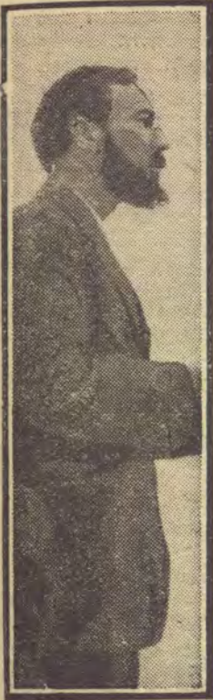
Mr. Sheehy Skeffington, a Dublin rebel, who has been shot.