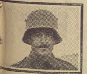
...sh steel helmet now in use ...right is worn by the Huns.