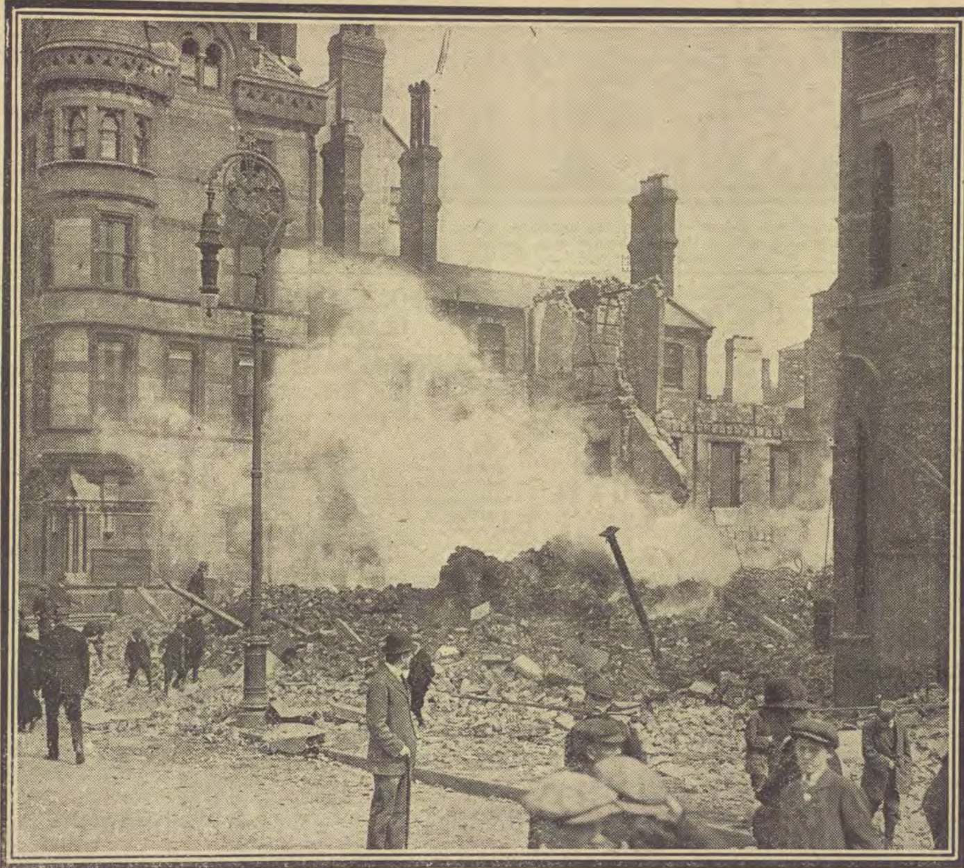
These smouldering ruins typify the tragedy of Sackville-street. The famous thoroughfare, of which Dublin has for generations been justly proud, shared with Princes-street, Edinburgh, the distinction of being the finest street in all Europe in its stately spaciousness and dignity of appearance. Now it is wrecked as hopelessly as any street in Ypres or Louvain.