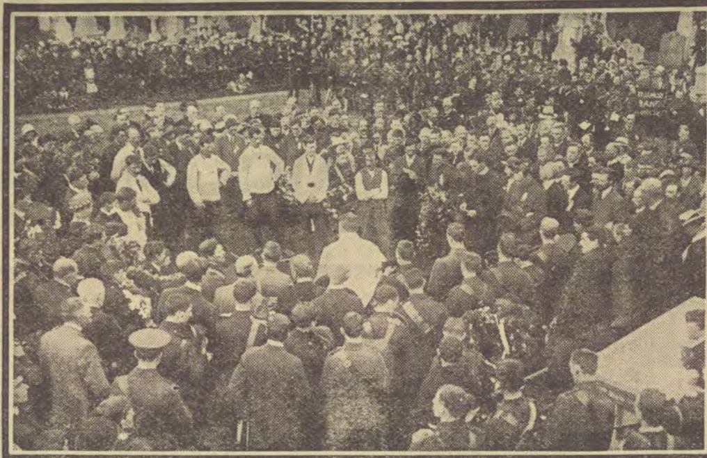
The scene at the funeral of O'Donovan Rossa, the great Fenian, in August last year, which was attended by most of the Sinn Fein leaders, including H. B. Pearse, the president of the Irish Republic, who was shot yesterday.

THE PRESIDENT OF THE IRISH REPUBLIC WAS THERE.