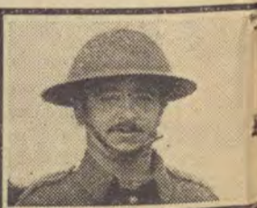
On the left is seen the British soldier at the front. The one on the right is the Hun.