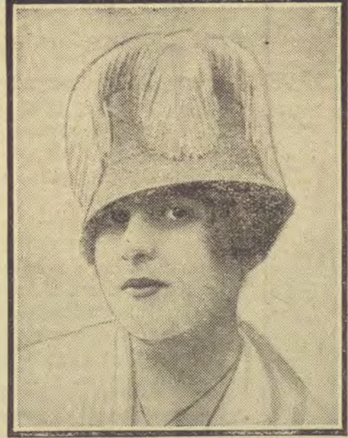
The ostrich feathers on this straw helmet are arranged to give a waterfall effect.—(Nipper.)