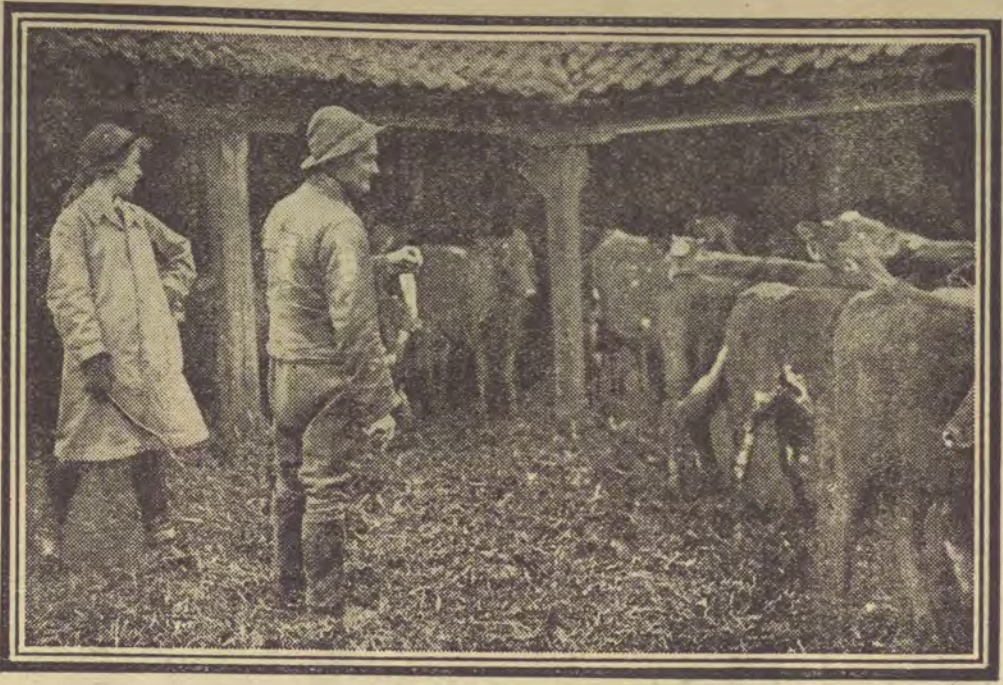
At the Manor House, Wessenham, Norfolk, women students are engaged in farmwork. Our photograph shows the old cowman and the new hand.