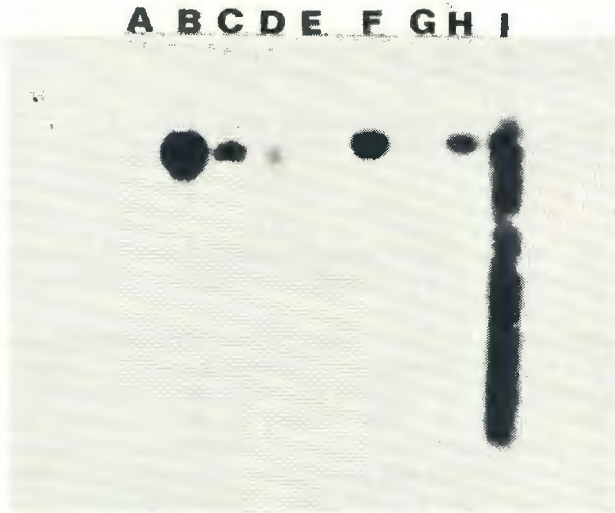
FIG. 2 Autoradiogram of a Southern blot of 1 \mu g amounts of DNA isolated from infected and uninfected blood hybridized with 50 ng ( 10^6 dpm) of bovine leucocyte DNA. Lane A: B. bigemina -infected blood, method B Lane B: B. bigemina -infected blood, method A Lane C: B. bovis -infected blood, method A Lane D: B. bovis -infected blood, method B Lane E: red blood cell extraction, uninfected blood, method B Lane F: red blood cell extraction, uninfected blood, method A Lane G: A. centrale -infected blood, method B Lane H: A. centrale -infected blood, method A Lane I: Bovine leucocyte DNA DNA hybridization. DNA was transferred to nitrocellulose and hybridized with a bovine DNA probe labelled with ^{32} P by nick translation (Southern, 1975). Hybridization was for 24 h at 68 °C in a solution containing 6X SSC, Denhardt's solution (5X), 0.05 % SDS and 100 \mu g/ml denatured herring sperm DNA. Bovine DNA, used as the probe, was isolated from leucocytes obtained from an uninfected animal. Post-hybridization washes were performed in 2 changes of 2X SSC containing 0.5 % and 0.1 % SDS respectively. Autoradiography was on Cronex MRF-31 X-ray film at -70 °C for 24 h with a tungstate intensifying screen.

DNA, B. bovis , B. bigemina and A. centrale DNA, extracted by methods A & B. No hybridization of the bovine probe was obtained with DNA extracted from B. bigemina , A. centrale and uninfected blood using method B (Fig. 2A, G and E). Some hybridization was obtained with the B. bovis DNA sample (Fig. 2D) indicating that it was not entirely free of white blood cell DNA.