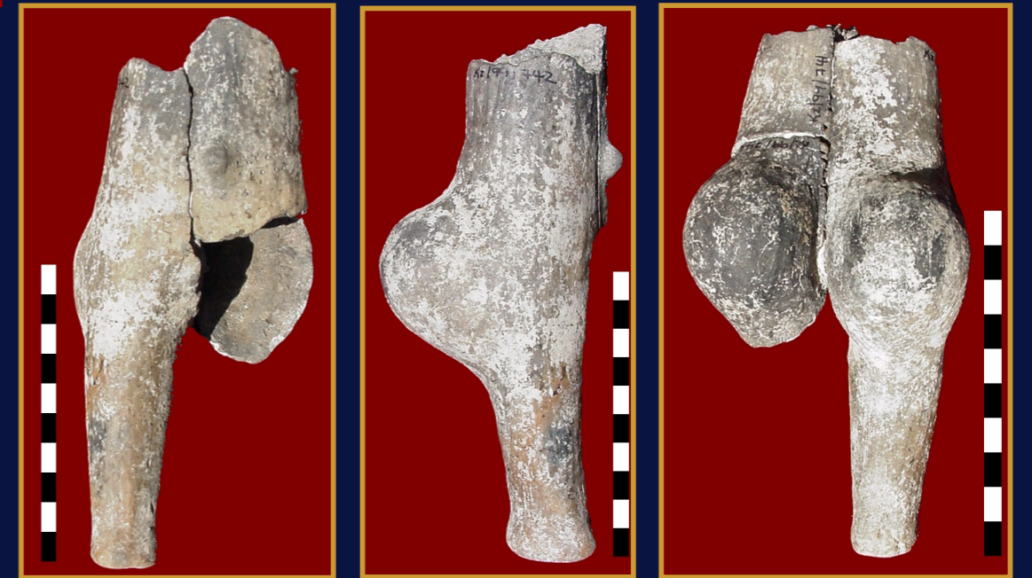
Large human clay figurine

During the 1999 excavations three fragments of a large human clay figurine were found. One fragment consists of the right leg, buttock and part of the abdomen. The second fragment is the left buttock, while the third fragment consists of the abdomen with protruding navel. The three fragments form the lower body of a human female, excluding the left leg. From toe to top the figurine fragments measure 15,5cm while the width of the buttocks is 7,2cm and the width of the abdomen 5,9cm. The foot is 2,7cm long and 1,9cm wide. The right leg is 5,1cm long. Decoration on the clay figure consists of incisions around the abdomen on the level of the navel, and incisions down the centre of the back onto the buttocks.