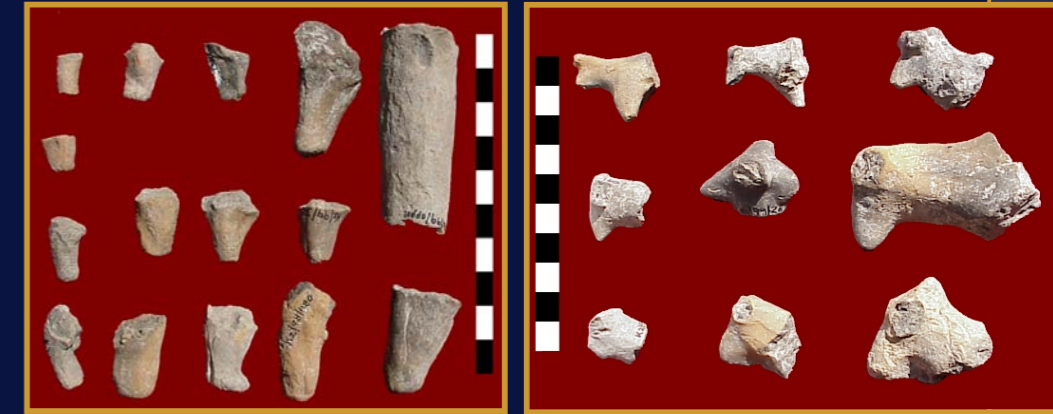
Examples of animal clay figurines