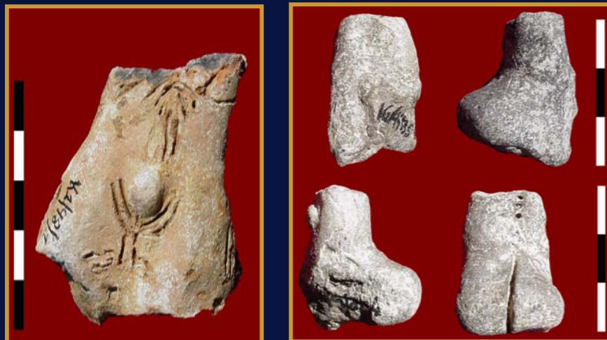
Human clay figurines