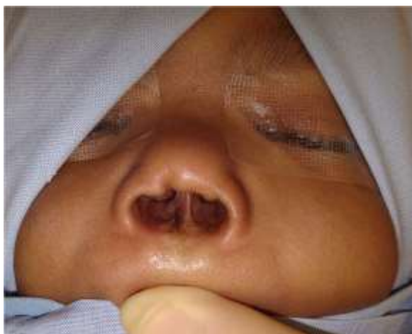
Figure 1 The appearance of the columella defect at the time of surgery.