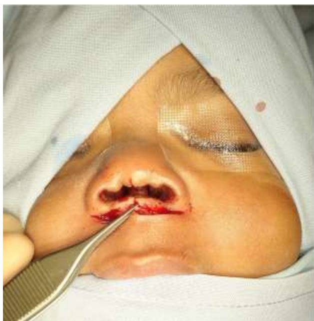
Figure 3 The first incision along the nasolabial fold.