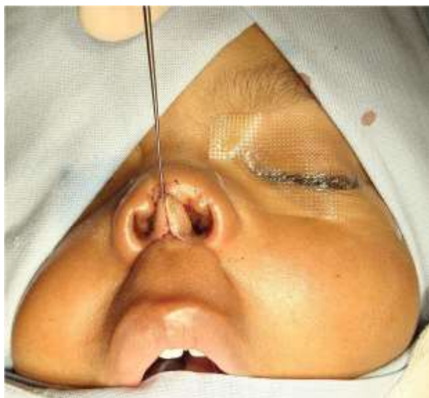
Figure 4 Mobilisation of the neocolumella under gentle, steady upward pull.

was finally sutured to the nasal tip at the previously trimmed margin (figure 5).