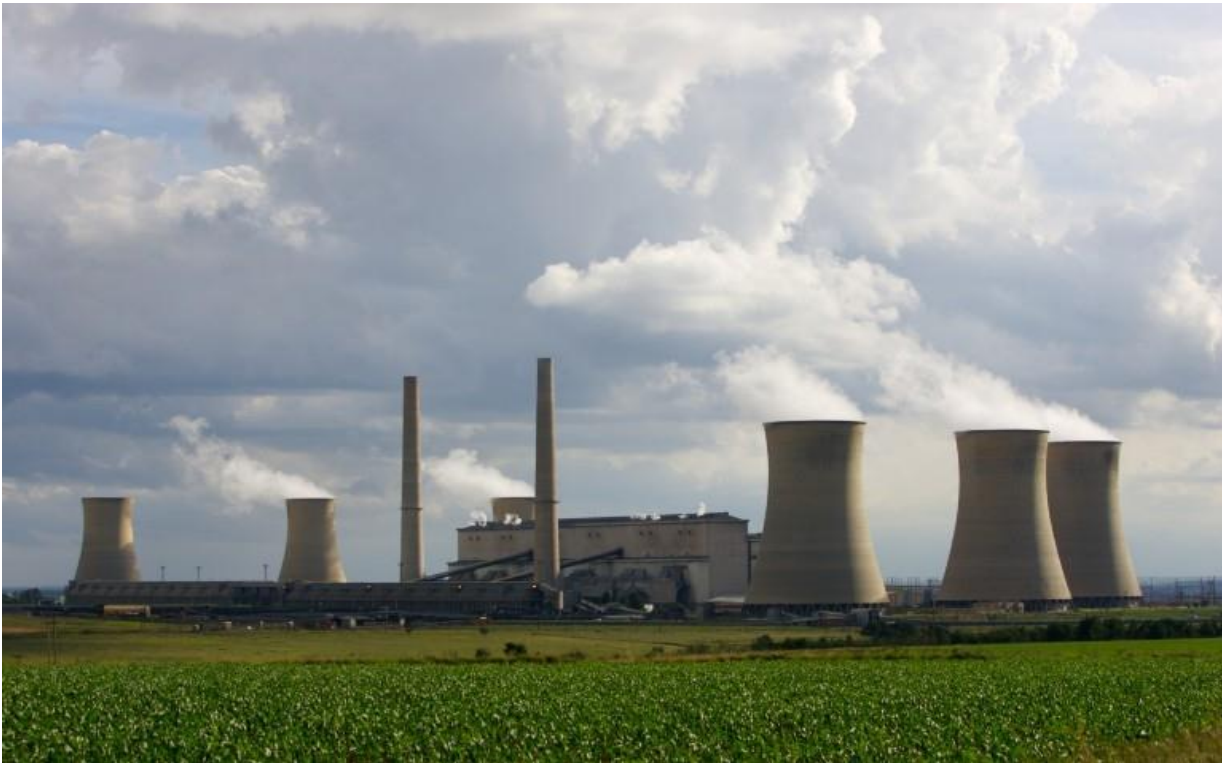
Figure 1: Coal Power Generating Plant

economies as well as international economies with robust economic frameworks. Figure 1 represents a pictorial overview of a coal power generating plant: