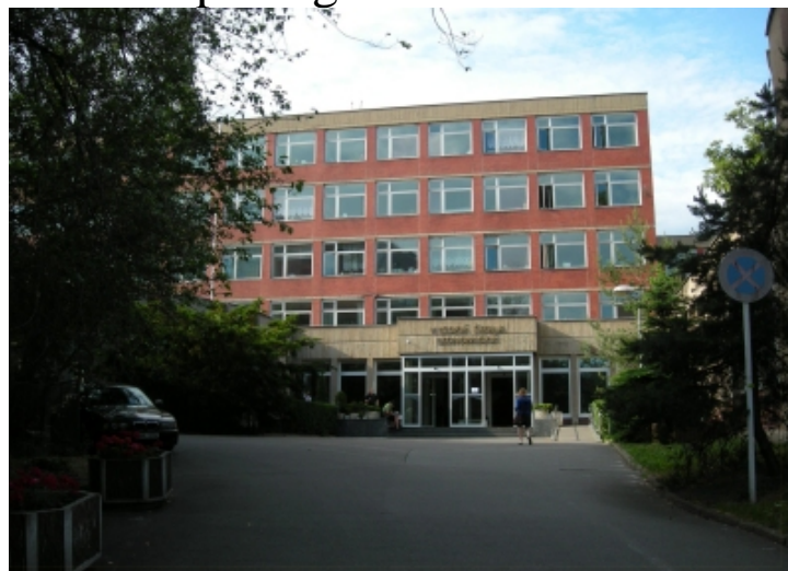
University of Economics, Prague