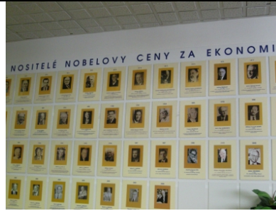
Library: University of Economics, Prague – Famous Economists Gallery