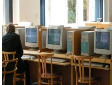
Workstations : University of Economics, Prague, Library