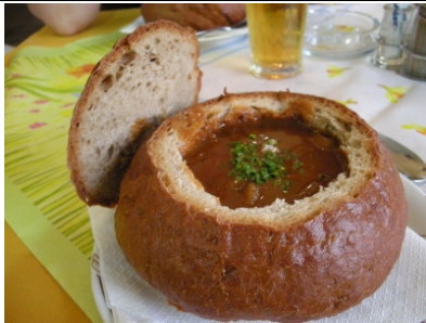
Typical Hungarian Goulash served in bread