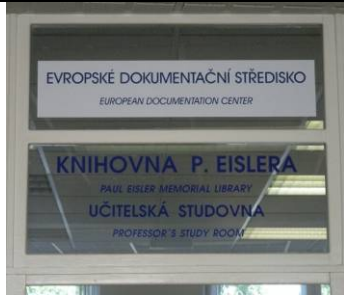
Library: University of Economics, Prague – Quiet Study Rooms