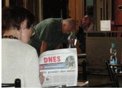
Before the Jasco Workshop