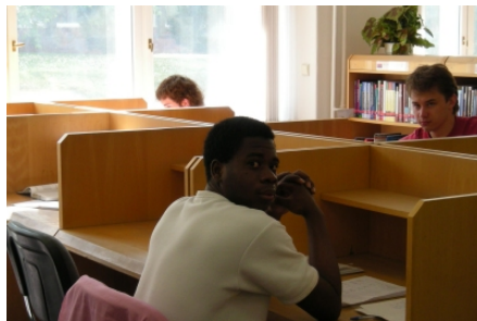
Library: University of Economics, Prague – Students at study cubicles The library has a VERY QUIET atmosphere