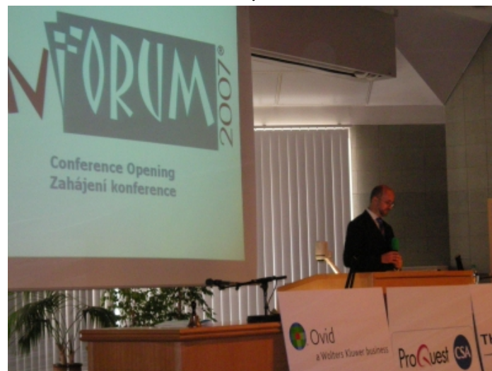
Opening of Conference