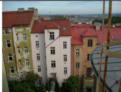
View from our hotel room: typical Prague apartments