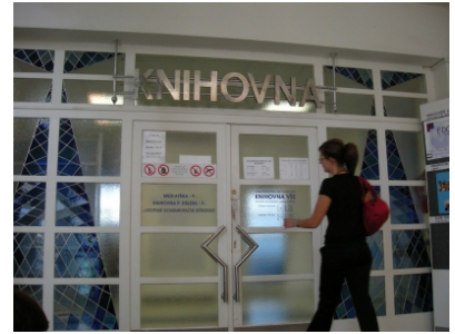
Entrance: University of Economics, Prague, Library