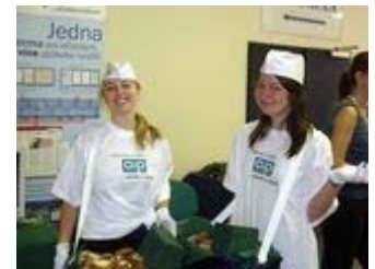
The food at the conference was very interesting ... lunch was served in the student canteen