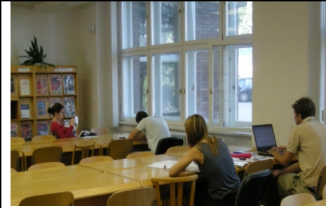
Library: University of Economics, Prague Researchers in the Quiet Study Rooms