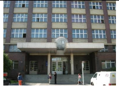
Another picture of the University of Economics, Prague. The years of Russian government is still present in the buildings.