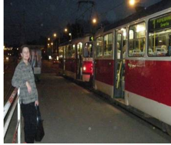
Many wrong trams ... 22h00, but we always arrived home safe!