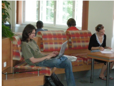
In the corridors of the University of Economics, Prague, Library. Wireless areas