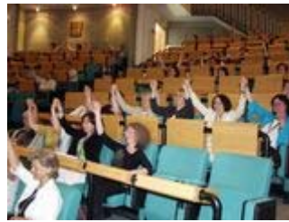
Closing address of the Conference – after 3 days a few less delegates...