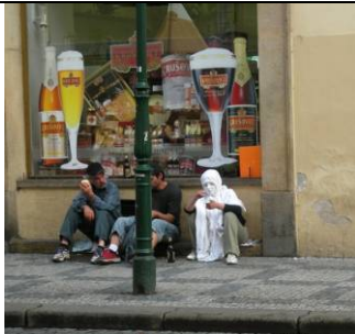
Homeless people on the streets, Prague