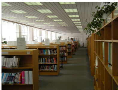
Library: University of Economics, Prague (Our Level 2)