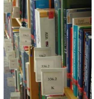
Library: University of Economics, Prague – Shelf markers