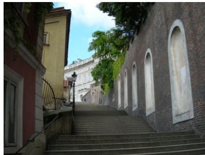
OLD CITY, Prague