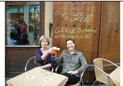
After the conference sessions: time for fun