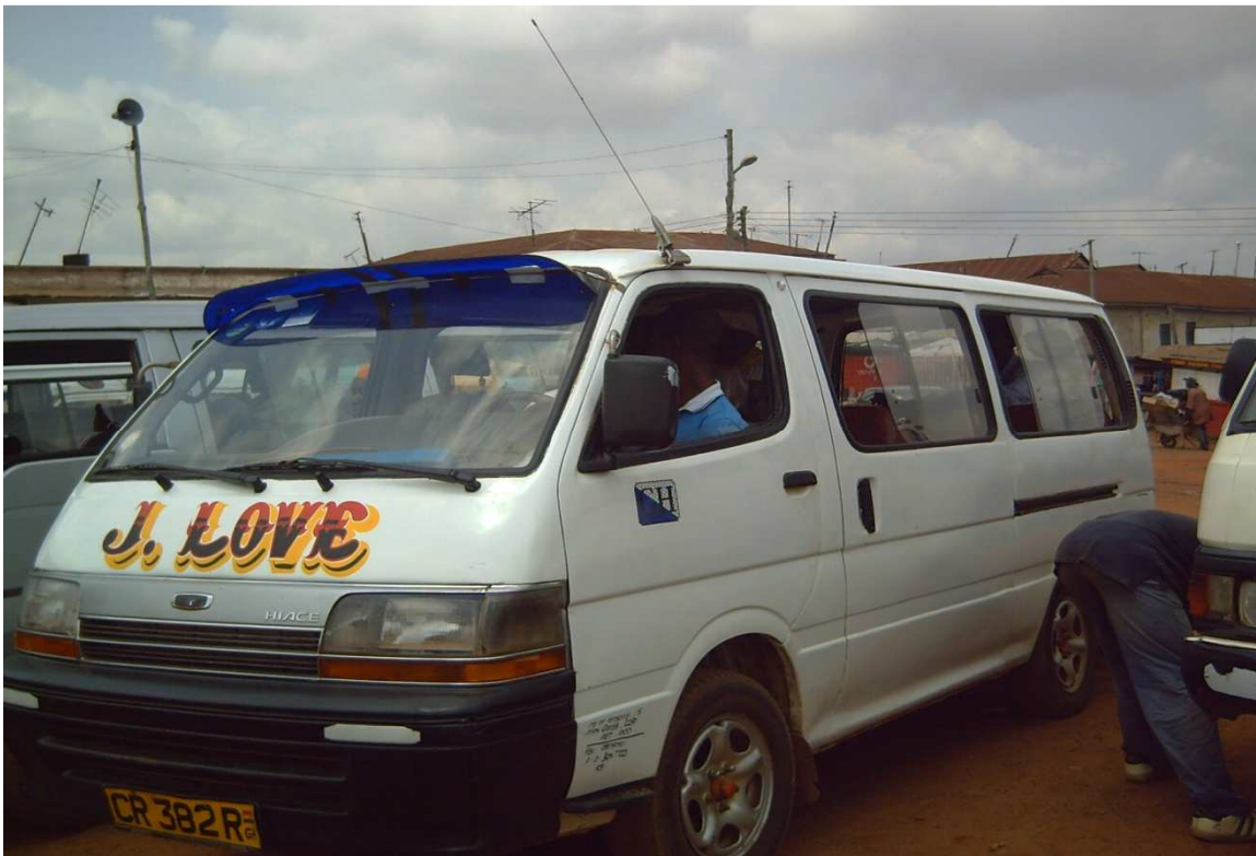
Fig 1: Typical trotro as public transport mode in the city of Kumasi