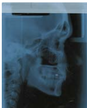
Figure 6a: Lateral Cephalogram radiograph.