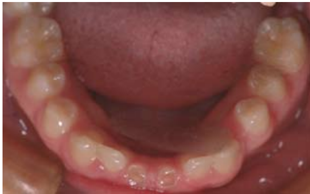
Figure 4: Pre-Orthodontic Treatment: Mandibular arch

The patient suffered severe oligodontia. In the maxillary arch the following teeth had failed to develop: Permanent third molars, permanent first and second premolars, permanent canines and permanent lateral incisors.