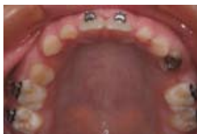
Figure 8: Post-Orthodontic treatment: Maxillary arch.