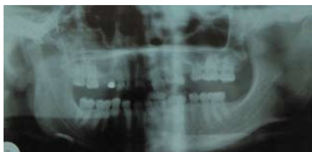
Figure 5: Panoramic radiograph