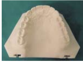
Figure 11b: Diagnostic set-up: Maxillary arch.