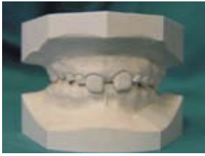
Figure 10a: Pre-treatment study cast: frontal in occlusion