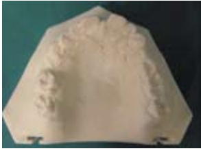
Figure 11a: Pre-treatment study cast: Maxillary arch.