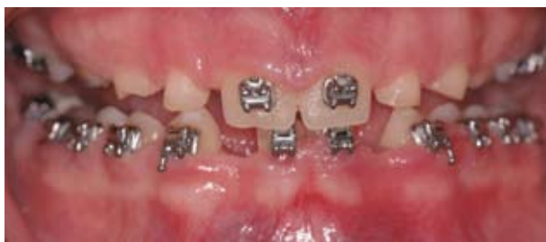
Figure 7: Post-Orthodontic treatment: frontal.

Periodontically, it was decided that in order to maintain the alveolar bone, the maxillary deciduous teeth should be