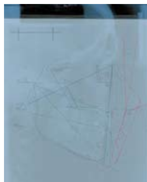
Figure 6b: Analysis of lateral Cephalogram radiograph.