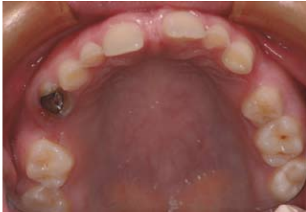
Figure 3: Pre-Orthodontic Treatment: Maxillary arch