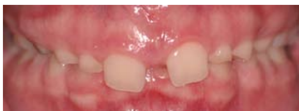
Figure 2: Pre-Orthodontic treatment: frontal