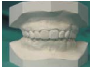
Figure 10b: Diagnostic set-up: frontal in occlusion.