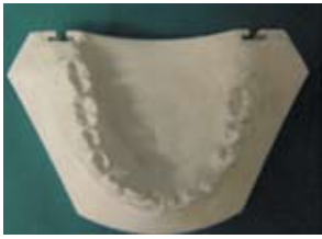
Figure 12a: Pre-treatment study cast: Mandibular arch.