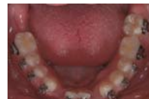
Figure 9: Post-Orthodontic treatment: Mandibular arch.

retained as far as possible. It was also decided that after the orthodontic treatment and prior to beginning prosthodontic treatment, the patient will be examined again in order to assess the sites for implant placement, and to discuss the need for possible gingivoplasty and crown lengthening.