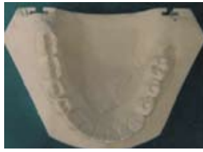
Figure 12b: Diagnostic set-up: Mandibular arch.

plex for both the patient and the clinician. Whilst current treatment modalities can offer acceptable outcomes for patients with oligodontia, the need for input from a multidisciplinary team is essential to ensure the appropriate treatment and the correct timing of interventions to achieve maximum benefit. Whatever options are considered, careful planning is essential with collaboration between the restorative team, periodontist, orthodontist and the patient.