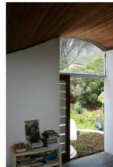
9. North facing window to main bedroom