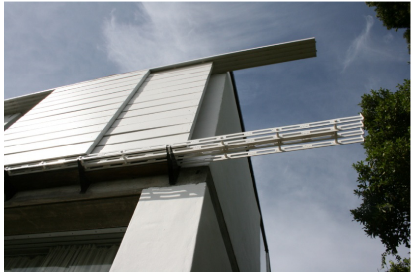
4. View from the south-west corner