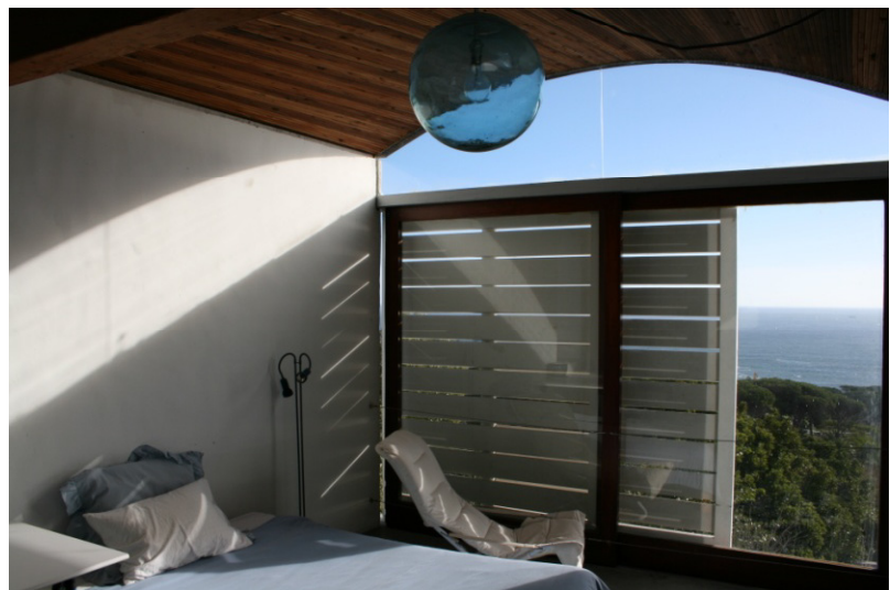
7. View from southern most bedroom looking west