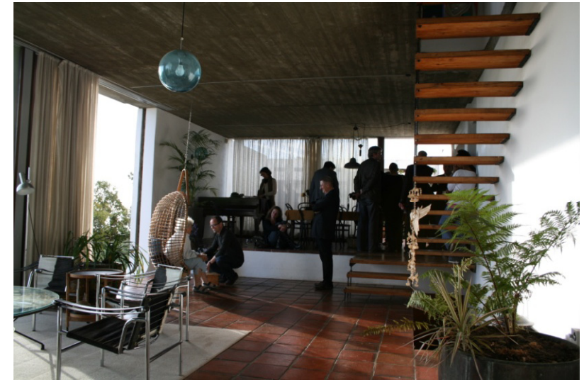
6. View of the living and dining room