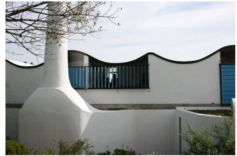
3. View from the front garden looking west