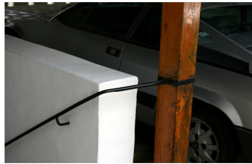
10. Detail of continuous steel handrail at carport and entrance stair