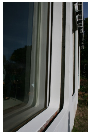
8. Sliding door reveal to living room