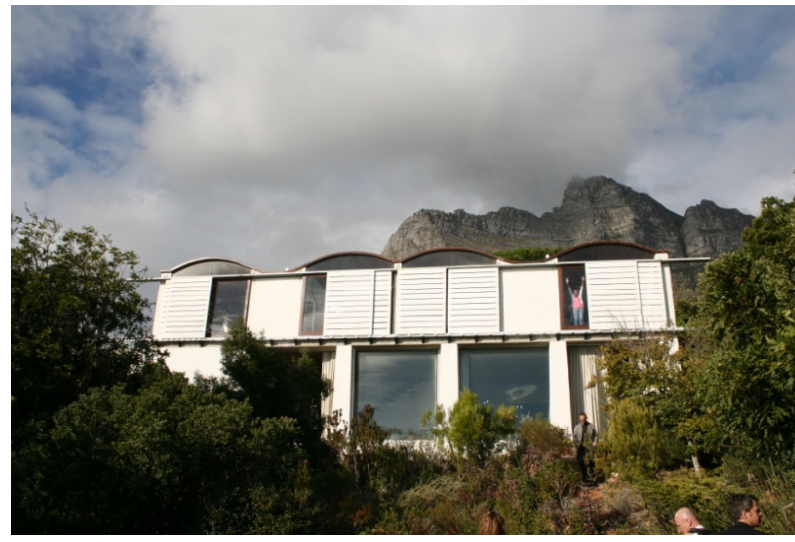
2. View from the sea-facing garden looking east