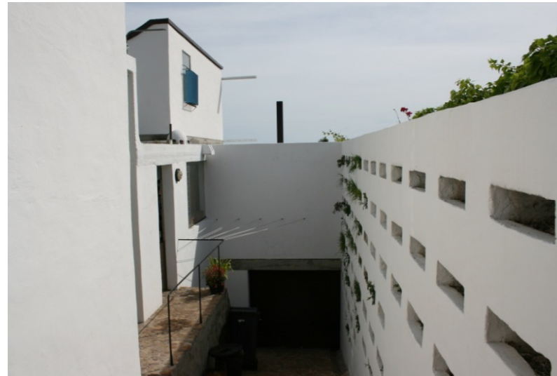
5. View from the driveway looking west