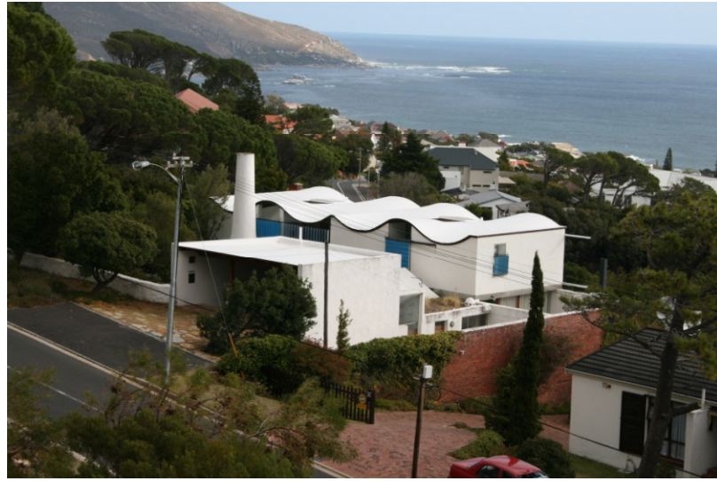
1. View from the north-east