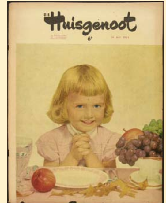
Figure 12. Huisgenoot , 16 May 1955

This static designation of femininity to the visual is all the more evident when imbued with a sublime inference. The photograph on the 7 August 1953 cover (figure 11) contains no explicit reference to religion, but Nooi met die serp (Woman with scarf) as the image is called, seems iconic in its allusion to pensive depictions of the Virgin Mary, not least because of the otherworldly light from an unknown source reflecting off the subject’s face. Umberto Eco (1986: 57) explains the relation between beauty and the sublime in the context of the Medieval understanding of Neo-Platonic beauty as ethereal rather than material. The most apparent and persistent symbolic representation of the kinship between godliness and beauty was thus light. The perception of light as the quintessence of ‘theophanic harmony, primordial causes, [and] of the Divine Persons’ (Eco 1986:57) is complemented by the archetypal reading of evil and subversion as dark. The dramatic chiaroscuro of Nooi met die serp may accordingly be indicative of the gulf between ‘good’ and ‘evil’, rather than merely being an aesthetic gimmick.