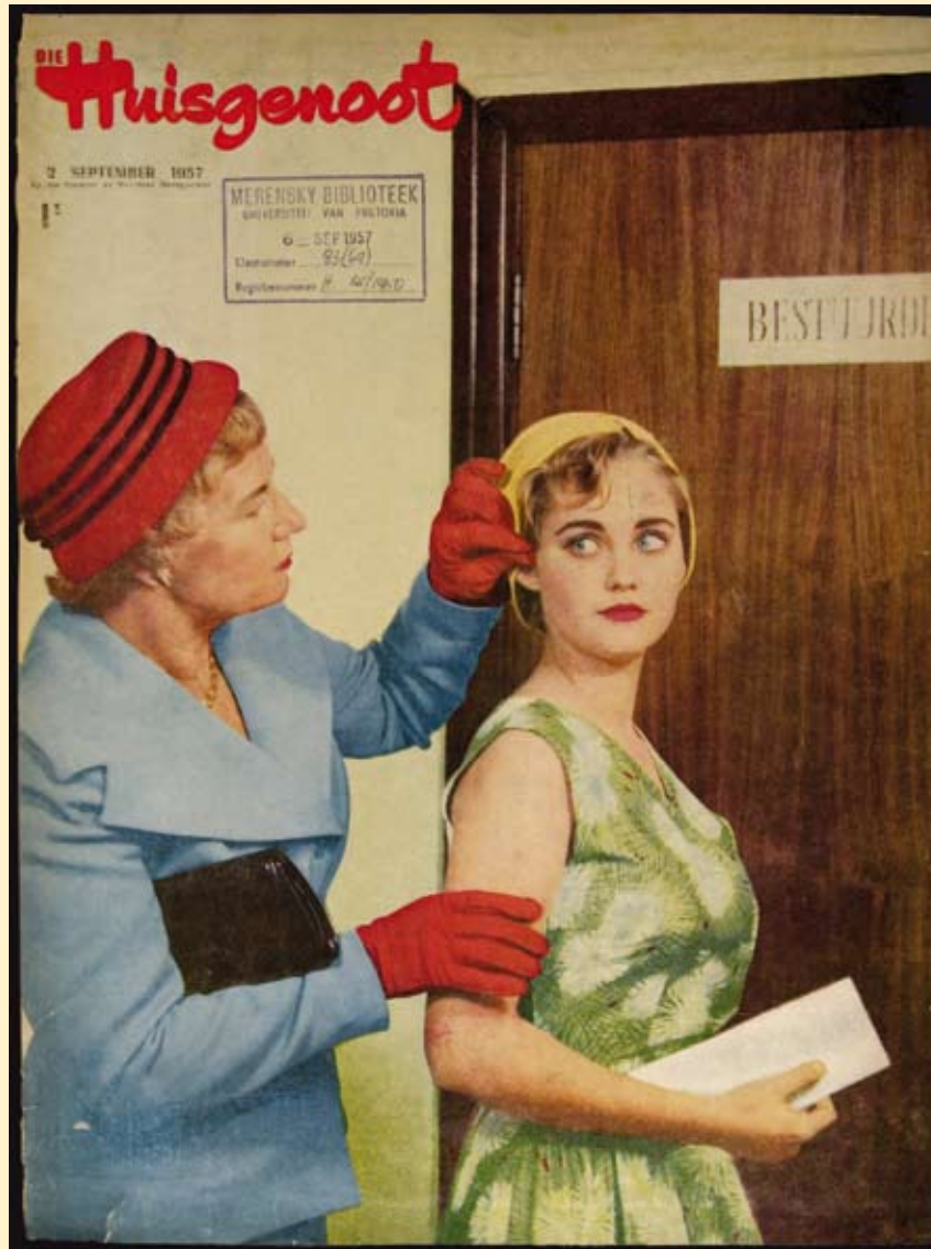
Figure 13. Huisgenoot , 2 September 1957

on the theme of local productivity and the abundance of natural resources in South Africa. The notion of the fruitfulness of the South African land is thus coupled with the feminine. Even here, the woman is portrayed in relation to her masculine other; she is the thankful, supplicating daughter to her physical, political and heavenly father.