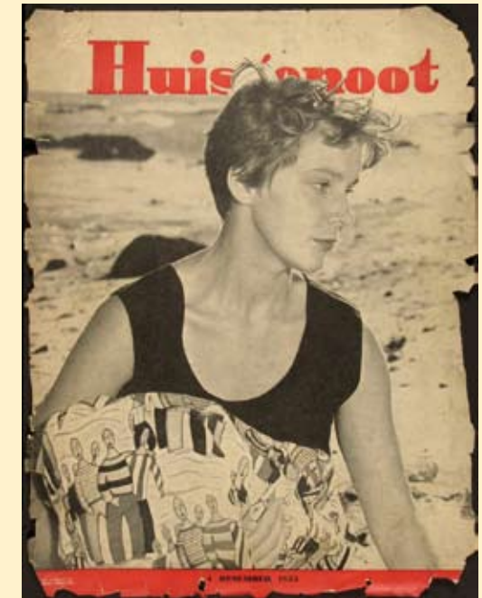
Figure 10. Huisgenoot , 4 December 1953

The cover for the Huisgenoot of 4 December 1953 (figure 10) is the most sombre of that year and in its sobriety seems to hint at transcendence. The photographer, Ronald