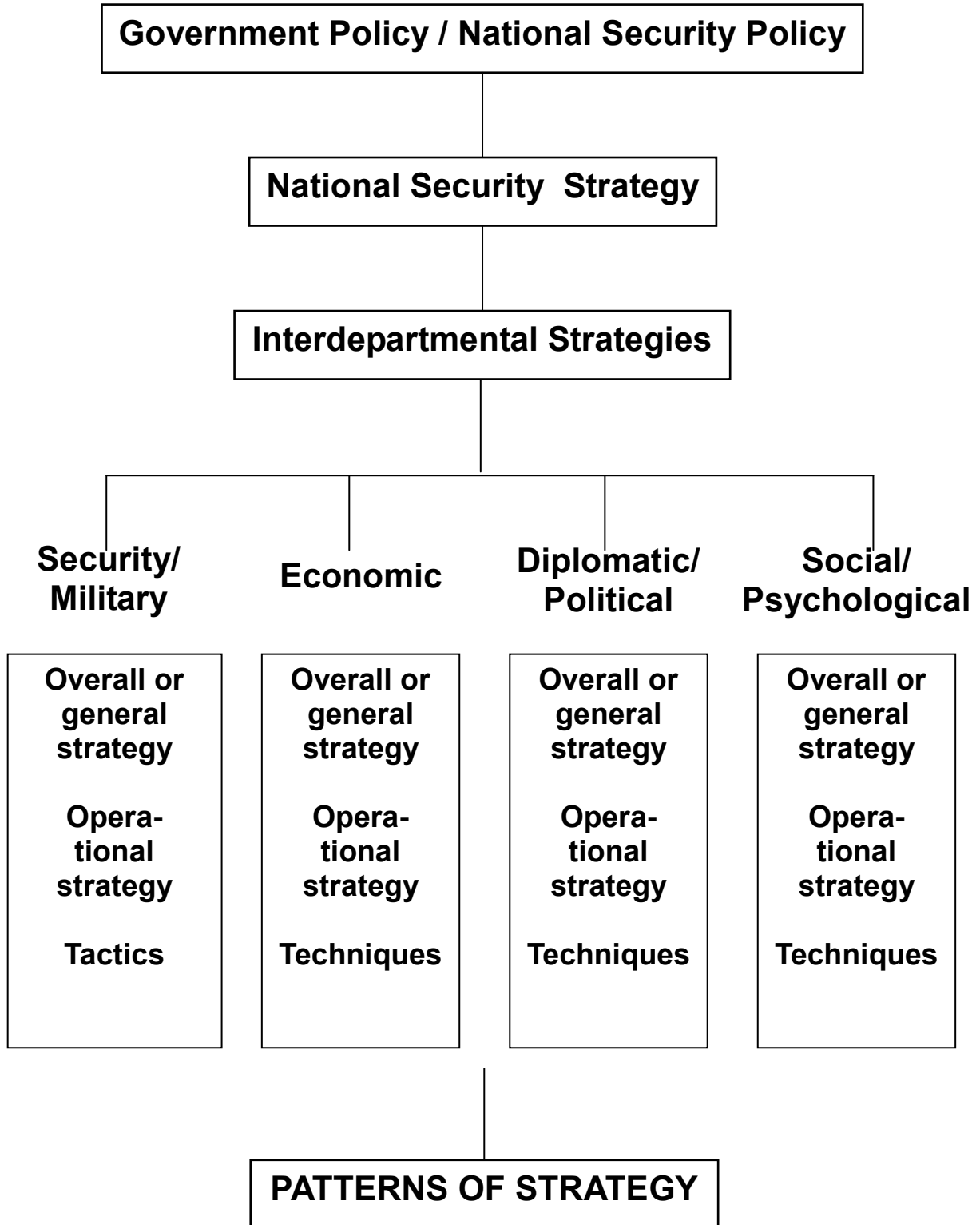
FIGURE 1: LEVELS OF STRATEGY