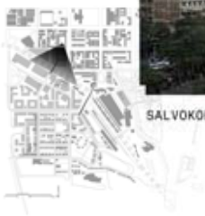
112. LOOKING OVER FORMER DAIRY MALL

- Ensure sensitive interventions to accommodate change and development