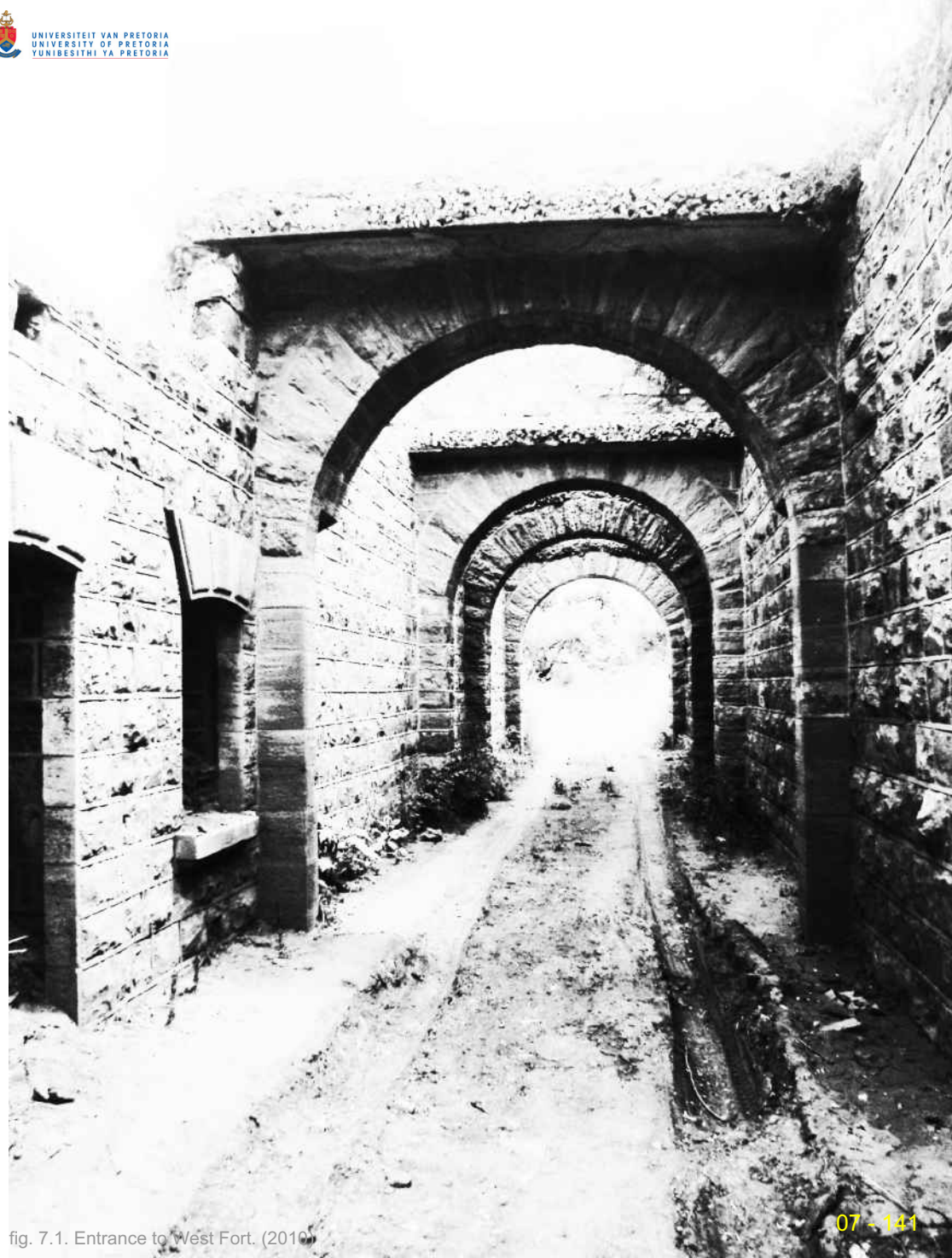
fig. 7.1. Entrance to West Fort. (2010)