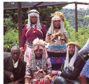
1.3 A forgotten culture