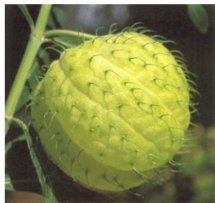
1.1 Asclepias fruticosa