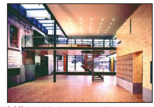
fig.6.29. A play of old and new, and heavy and light materials is created on the interior.