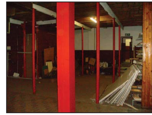
fig.6.14. Steel supports inserted for wooden flooring above