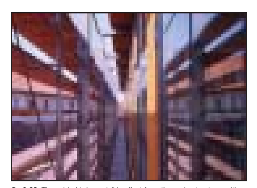
fig.6.28. The added brise-soleil is offset from the main structure, with a metal grille inserted in-between as a fire escape