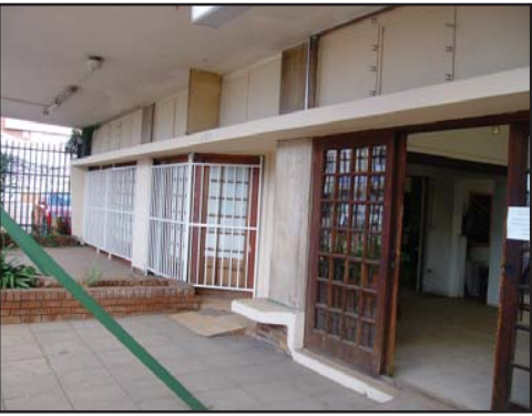
fig.6.10. Main pedestrian entrance (previously shop fronts)