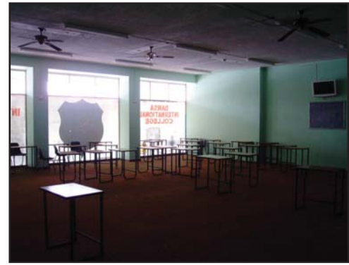
fig.6.24. Gathering space on ground floor (previously retail activity)