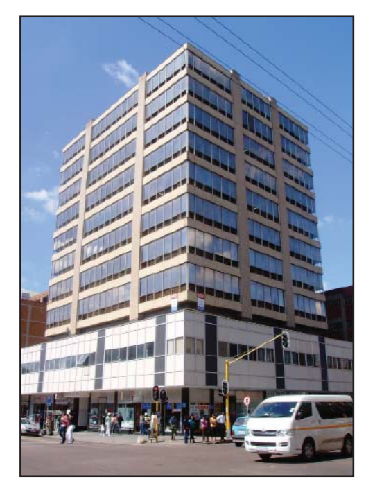
fig.6.6. The Apollo Centre

- Significant associations between people and place should be respected, retained and not obscured. Opportunities for the interpretation, commemoration and celebration of these associations should be investigated and implemented (For many places associations will be linked to use.)