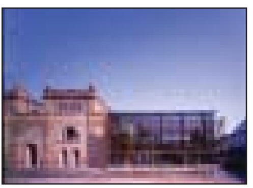
fig.6.26. The alteration clearly distinguishes the old and new on the elevation with different materials. The scale of the alteration has been done in a sympathetic way to the existing

This project entailed the adaptive re-use of an historic slaughterhouse to a public library. Koenig (1999: 114) states that the architects' solution consistently forged a dialogue between old and new-juxtaposing lightness with heaviness, transparency with opacity, and traditional elements with simple machinelike interventions-to achieve an integrated whole. A wood-slatted brise-soleil is wrapped around the exterior of the existing masonry structure together with the architects glass and steel addition. Koenig (1999: 119) states that Lamott addressed the structural limitations of the original foundations by pouring a new load-bearing concrete slab that is independent of the existing shell, not even touching it. She adds that this separation between old and new is accentuated by gaps or reveals where Lamott's floors meet the stonewalls and the original cast-iron columns.