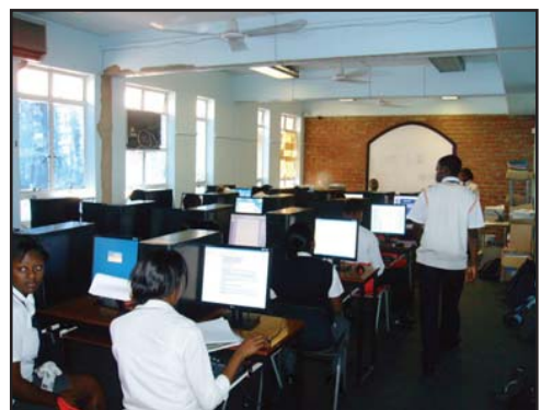
fig.6.20. IT-lab (alteration visible in background)