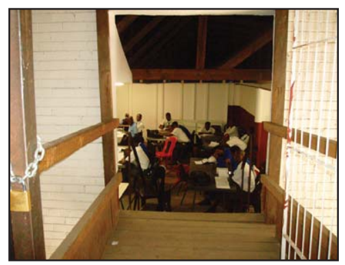
fig.6.13. Drywall partitioning used to create classroom spaces