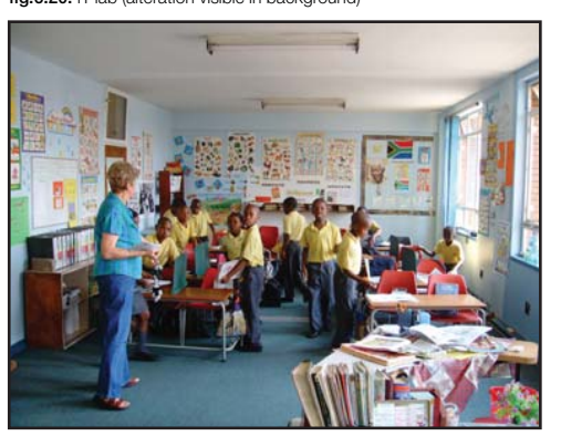
fig.6.21. Typical classroom with an abundance of northern light