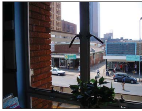
fig.6.23. Views of the urban context is constantly visible