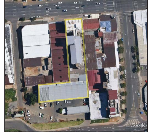
fig.6.17. Aerial Photograph of DANSA International College