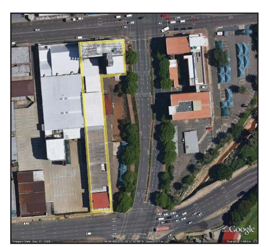
fig.6.8. Aerial Photograph of Berea Park School

Berea Park Independent School was established in 2003. They moved from their previous location, the Berea Park Clubhouse, to their current premises, a warehouse building type and the Lion Bridge Building, in 2008. The school site consists of two stands arranged in a longitudinal north-south orientation, forming the eastern perimeter of the city block. The structure on the southern stand was previously used as a retail outlet of electrical supplies. A brick warehouse, where all of the supplies were stored, was built up against the back of the shop fronts and offices facing Pretorius Street. The Lion Bridge Building, an eight-storey office building type, occupies the northern stand.