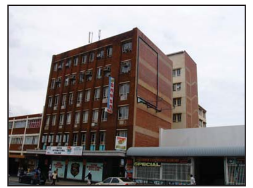
fig.6.16. DANSA International College

DANSA International College was established in 1996. They moved from their previous location, the current Berea Park Independent School, to their current premises, an office/apartment building type, in 2007. The school is located on a stand that edges Schoeman Street to the North and Skinner Street to the South. The structure was previously used as offices.