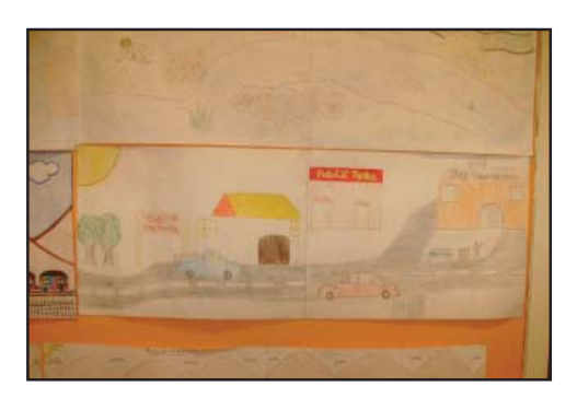
Drawings by students of DANSA International College